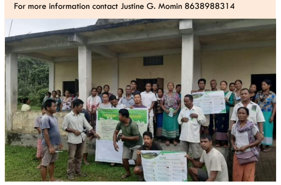
AWARENESS AND SENSITIZATION PROGRAMME AT JADUGRE. SOUTH GARO HILLS

Awareness and sensitization programmes were conducted at Minenggre and Rongsepgre under Gasuapara Block on 25th September, 2019. The VNRMC was formed; EC, VCF, Purchase Committee and Bookkeeper have also been identified at Minenggree. Rongsepgre needs time to form VNRMC and constitute EC, VCF, Purchase Committee and Book-keeper.