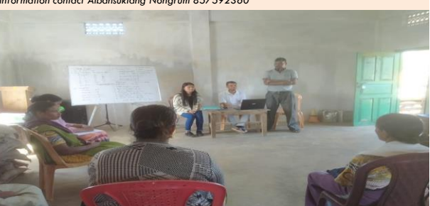
CNRMP, PLAN PREPARATION AT PATHARKHMAH VILLAGE, EGH PDA registration of VCF in DPMU, East Garo Hills District was done on 5th