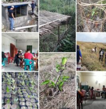
FIELD VISIT TO SOHKYRBAM DOMPHLANG VILLAGE, RB Field Engineer Visited to Sohkyrbam Domphlang village under Jirang C&RD

Block on the 5^{\rm th}\, November 2020 for Site verification of the headwork, and followed up on the construction and fencing of the vermin-compost. For more mation contact Van Shan Buhphang 977 49 449 10