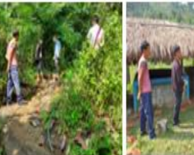
FIELD VISIT TO MAWBSEIN VILLAGE, RB Field visit for filling up of CNRMP Social Templates, Seasonal Cale Discussion on Problem Analysis were done on the 14th October 2020 at Mawbsein Village under Bhoirybong C&RD Block. For more information contact Van Shan Buhp

Block on the 5^{\rm th}\, November 2020 for Site verification of the headwork, and followed up on the construction and fencing of the vermin-compost. For more mation contact Van Shan Buhphang 977 49 449 10