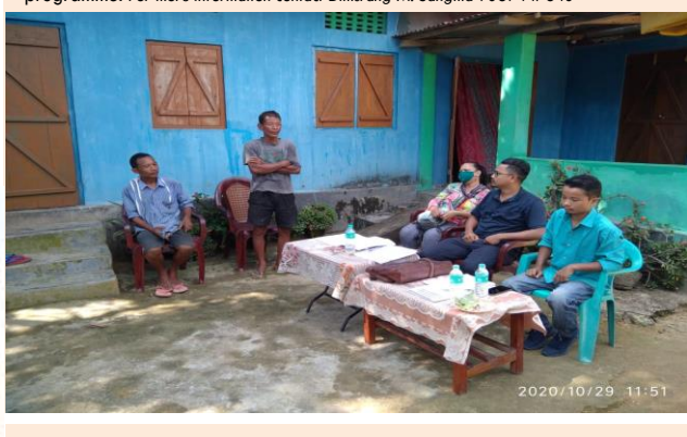
CNRM PLAN PREPARATION AT NARWAN VILLAGE, W.IH Collection of data based on the CNRM template, drawing of the resource & social map and preparation of the seasonal calender & vision map was done at Narwan village under Saipung Block on 29th October 2020. For more