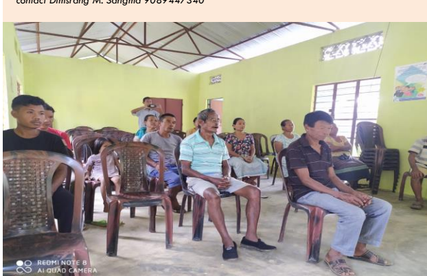
TRAINING PROGRAMME IN WGH