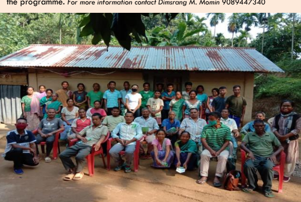
CNRM PLAN PREPARATION AT JARAIN VILLAGE, WJH

Collection of data based on the resource & social map and preparation of the seasonal calender & vision map was done at Jarain village under Saipung Block on 30<sup>th</sup> October 2020.