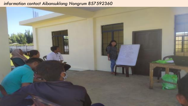
AWARNESS PROGRAMME AT GABIL VILLAGE, EGH On 6^{\mbox{\tiny th}} of November, an awareness programme was conducted at Gimbilgre village and on the same day VNRMC was formed. 59 participants took part in