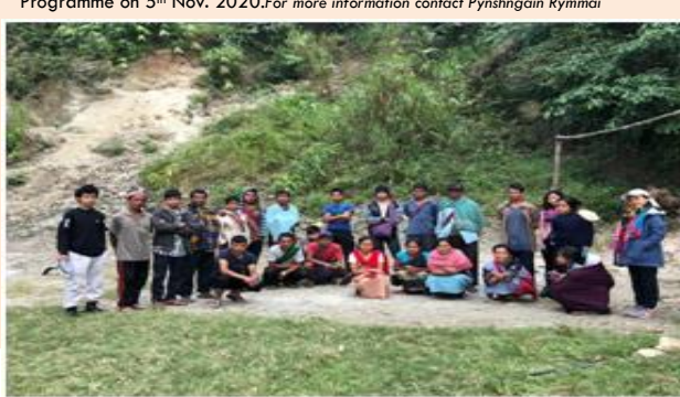
CNRM PLAN PREPARATION AT DIMIT WARIKKATCHI.

Sensitisation along with PRA and Focused Group Discussion on Problem Analysis, Seasonal Calendar, was conducted at Khwad Village, Mawkynrew, in East Khasi Hills District. 40 numbers of participants took part in the Programme on 5th Nov. 2020.For more information contact Pynshngain Rymmo