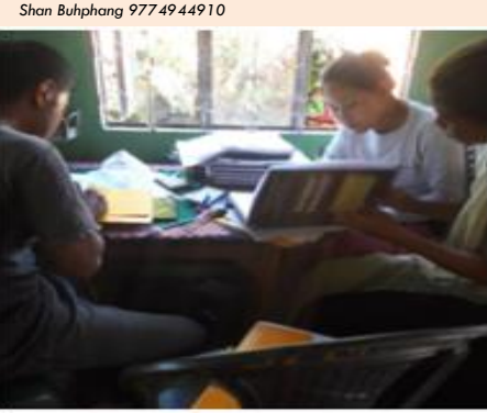
FOLLOWUP VISIT AT GABIL GANDUAL VILLAGE, EGH Follow up at Gabil Gandual village for project intervention under Rongjeng Block; East Garo Hills District was done on 6th Nov. 2020. For more information