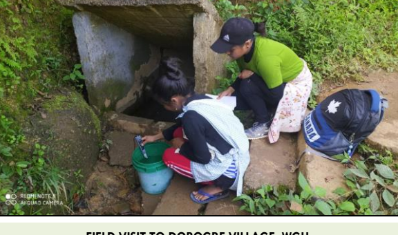
FIELD VISIT TO DOPOGRE VILLAGE, WGH District AM-KM, AM-M&E,

GIS External Expert Revisited Nongpyrdet village of Bhoirymbong {\sf C\&RD} block on the 17th Dec. 2020 for spring discharge measurement, water testing quality and also trained the VCF how to use the water tracer. For more information contact Van Shan Buhpang 9774944910