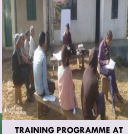
15<sup>th</sup> Dec. 2020 and Collected data based on the CNRM template, drawing of the resource & social map and preparation of the seasonal calendar & vision map. For more information contact Wilhelmos Shyllo