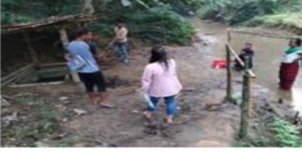
VISIT TO DOBA APAL VILLAGE NGH team visited Doba Apal village under Resubelpara Block, NGH District to inspect 18 days Composting done by Doba Apal VNRMC members on 18th Dec. 2020. For more information contact

plan estimate and other clarifications with regards to the implementation on 17th Dec. 2020. For more information contact Sitaram Prasad Sah 7005051834