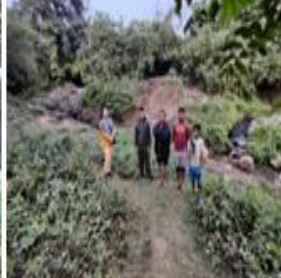
VISIT TO CHANDAPARA VILLAGE, WGH

District FE visited Chandapara to brief the community regarding the implementation of Spring Chamber at Sengme Chimik according to the approved plan estimate and other clarifications with regards to the implementation on 14th Dec. 2020. For more information contact Sitaram Pro