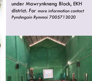
SENSITIZATION PROGRAMME AND PRA AT SMIT, EKH Community sensitization on CLLMP and PRA exercise for CNRMP development was conducted on 16<sup>th</sup> Dec. 2020 at Smit Village