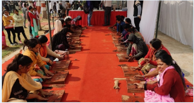
Live Demonstration on Agarbatti Making