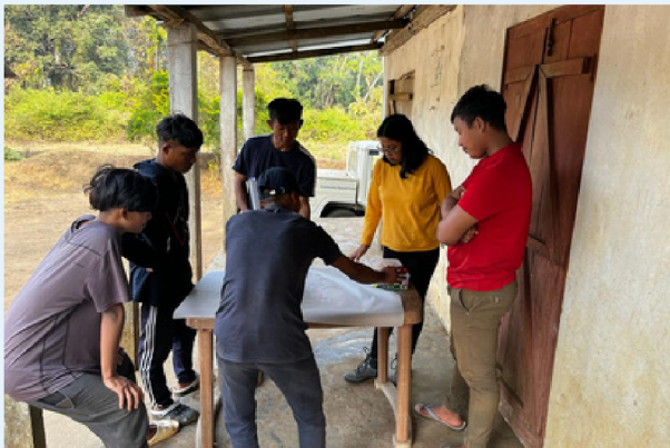
Facilitating the youths of Rajinpara Village under Gambegre C&RD Block in preparing Future Resource Map.