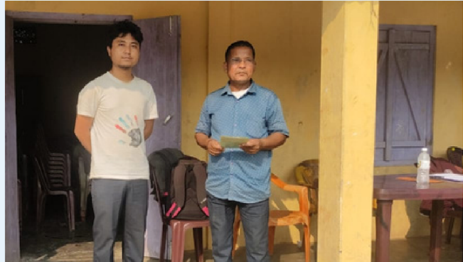
Village: Dokamcheng Village Block: Resubelpara