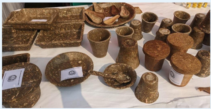
Crockery items made from lemongrass waste