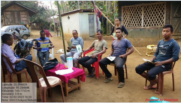
Village: Rebodotgri Block: Chokpot