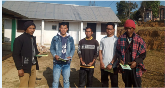
Village: Nongkohlew Block: Mawlai