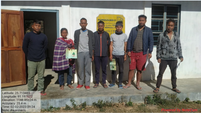
Village: Kyrдум village Block: Mawshynrut