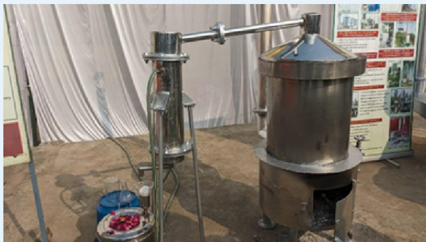
Demonstration on Rosewater Extraction