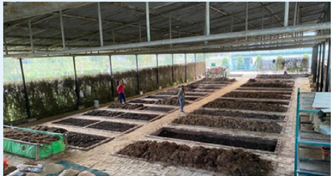
Vermi compost production area