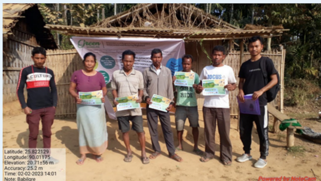
Village: Babilgree Block: Demdema