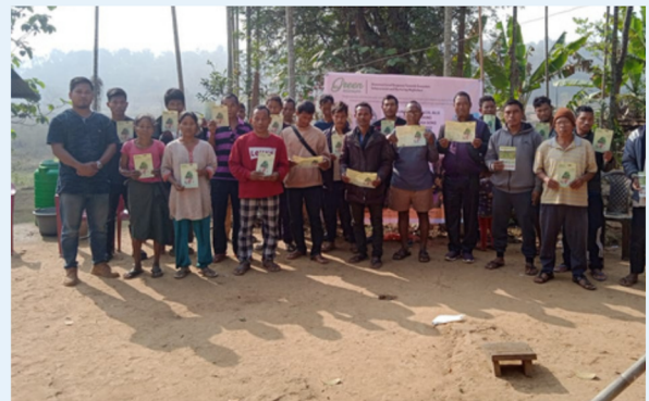
Village: Mongalgre Block: Rongram