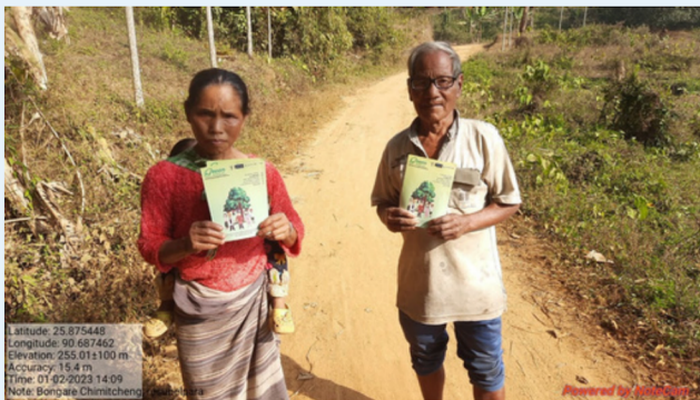
Village: Bongare chimitcheng Block: Resubelpara

To ensure the successful implementation of this scheme, Green Field Associates (GFAs) spread across all the districts are leaving no stone unturned in creating awareness and emphasizing on the importance of this scheme in conserving forests.