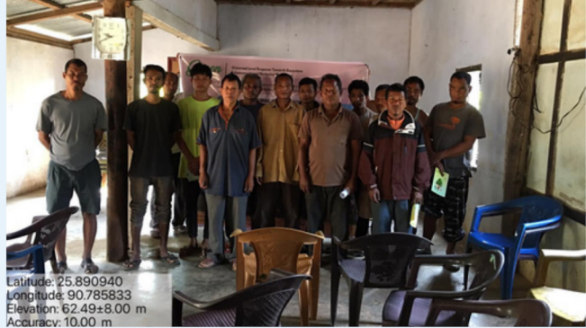
Village: Bugakol Block: Kharkutta