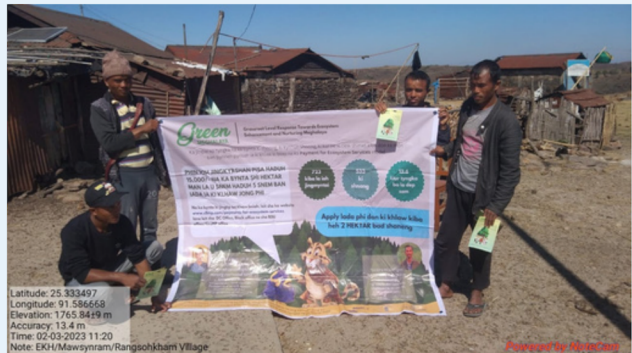
Location: Rangsohkham Village Block: Mawsynram