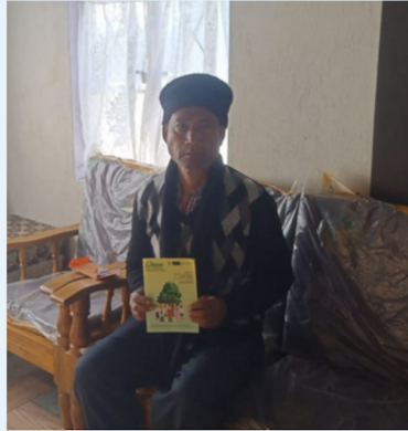
Village: Pingwait Block: Mawkynew