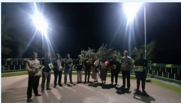
Village: Jasir Block: Shella