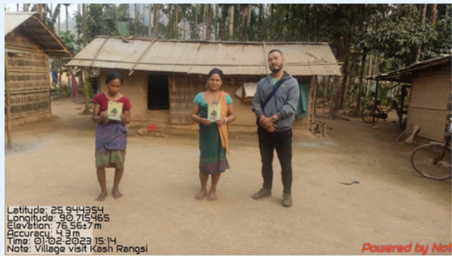
Village: Kash Rangsi Block: Resubelpara