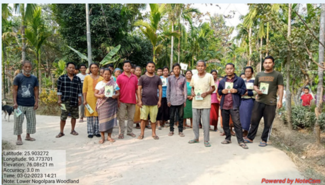
Village: Lower Nogolpara Block: Resubelpara