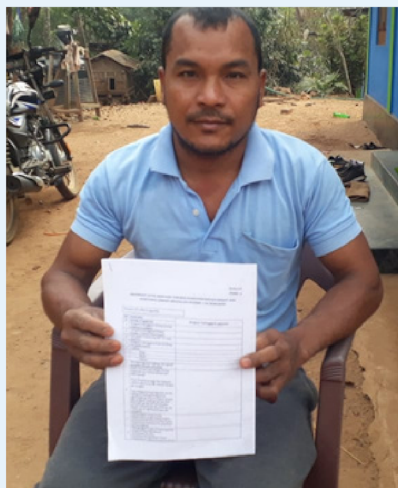
Village: Cherangre Block: Demdema