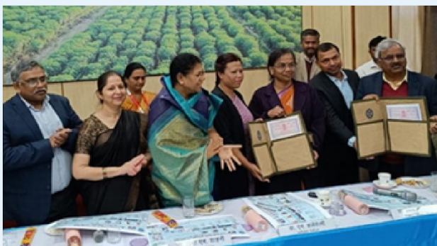
Exchange of MoU between INR and CIMAP