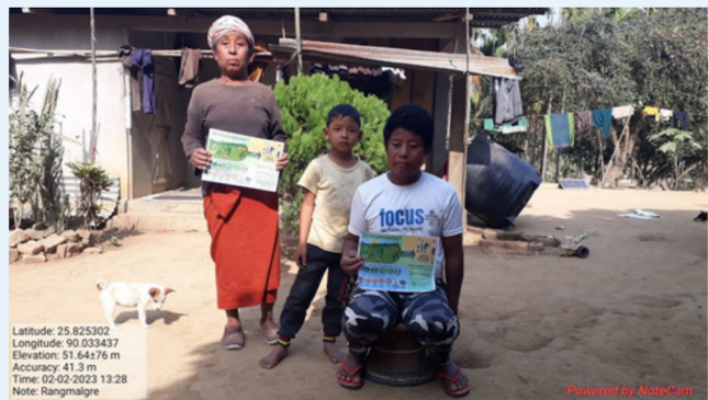
Village: Rangmalgre Block: Demdema