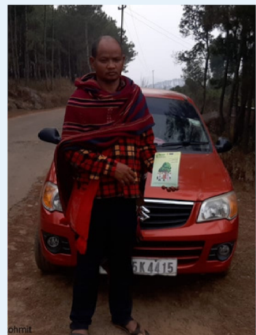
Village: Mawkohmit Block: Mawthadraishan