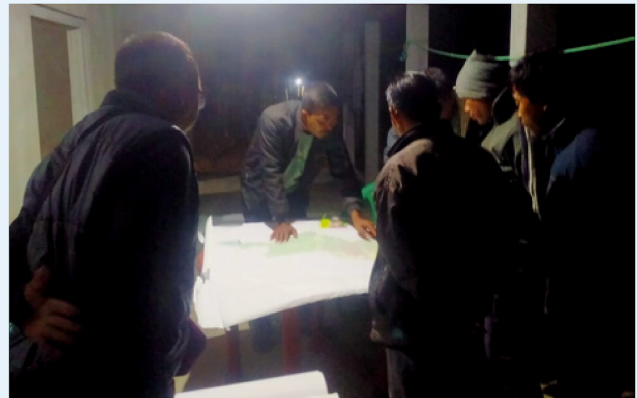
Continuation of Microplan activities at Chorepahar village under Resubelpara Block.

Sir David Gandhi visited Imsamal Village under Kharkutta C&RD Block and demonstrated Pratical SALT farming on how to make Contour line Layouting using A-FRAME to stabilize the Slope and improve the terrace or the contours to control soil erosion along the slopes to improve soil fertility. Total 7 potential farmers were willing to take up SALT farming for Agroforestry this year .