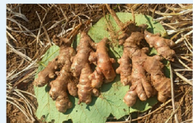
Site inspection to the ginger farm of ginger farmers at Jaroit village and Tynring village under Mawryngkneng Block, East Khasi Hills.