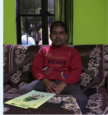
Village: Sohka Shnong Block: Amlarem