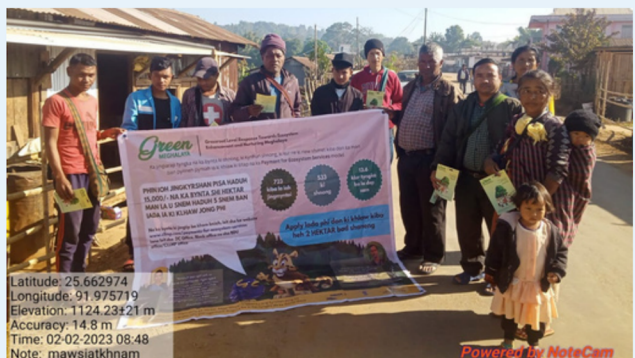
Village: Mawsiatkhnem Block: Mawlai