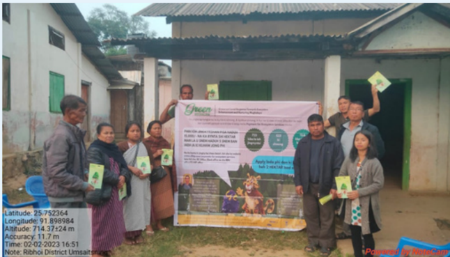
Village: Umsaitsning Dorbar pyllun Block: umsning