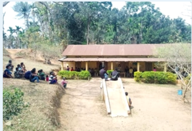
VPIC meeting conducted at Gindopara, Rongram, WGH.