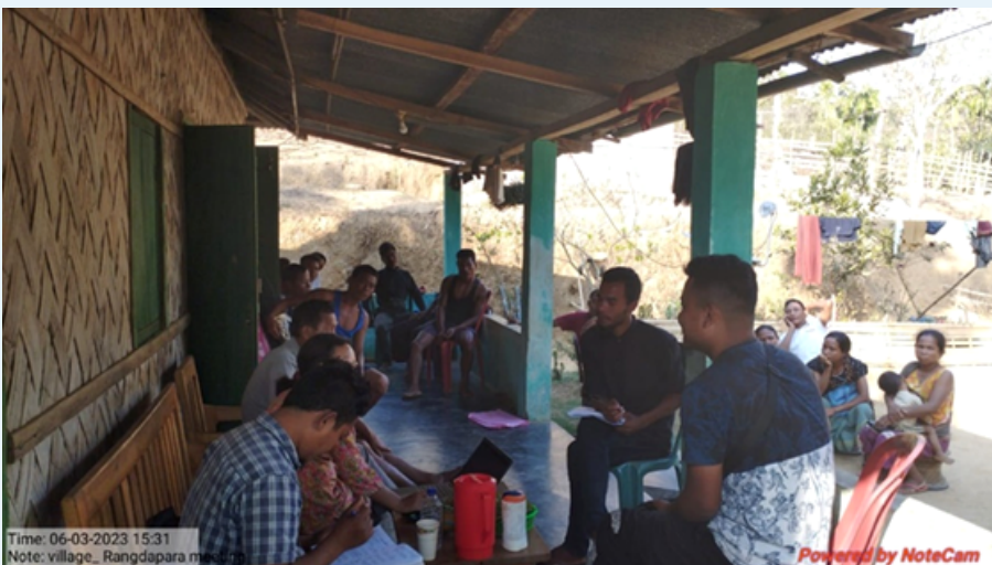
VPIC meeting conducted at Rangdapara Village, Dalu, WGH