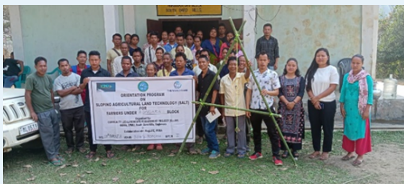
Thirty farmers participated in an orientation program on SALT conducted for 2nd Batch Villages of Rongara, SGH.