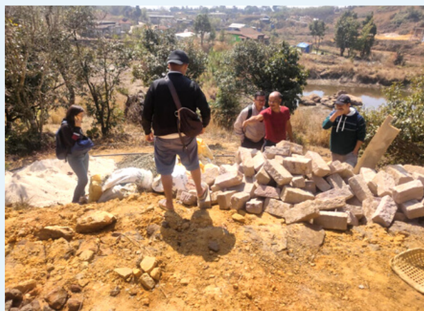
Laitmawsiang, Laitkroh Block, East Khasi Hills District.

Site inspection and Sampling of Iron Concentration for open limestone channel (OLC) under MLAMP at Lumshyrmit, Khliehriat Block, East Jaintia Hills District