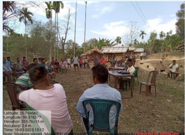
VPIC meeting conducted at Silsekgre, Rongram, WGH.