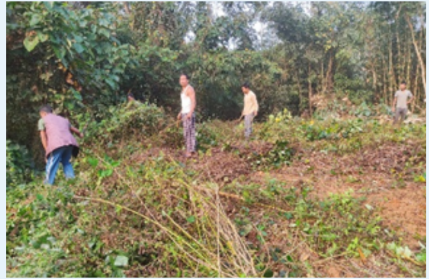
Clearing of jungle for Community Nursery in Dangkong Songgital, Songsak, EGH.