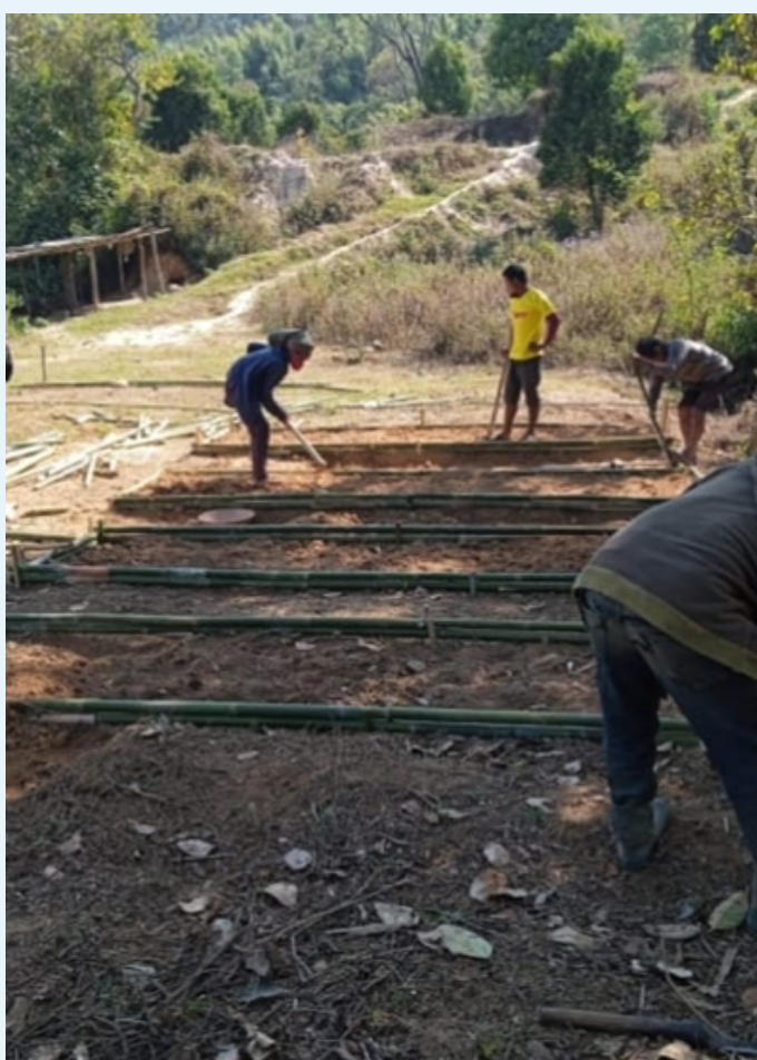
Baladinggre, Rongram, WGH