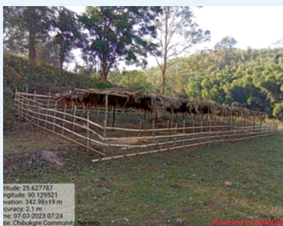
Chibokgre, Rongram, WGH