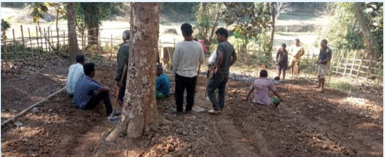
Derikgre, Rongram, WGH