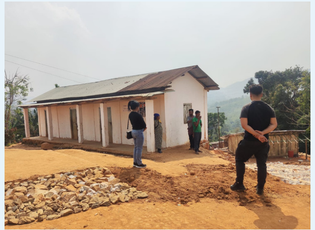
Jair Village, Ri Bhoi district.