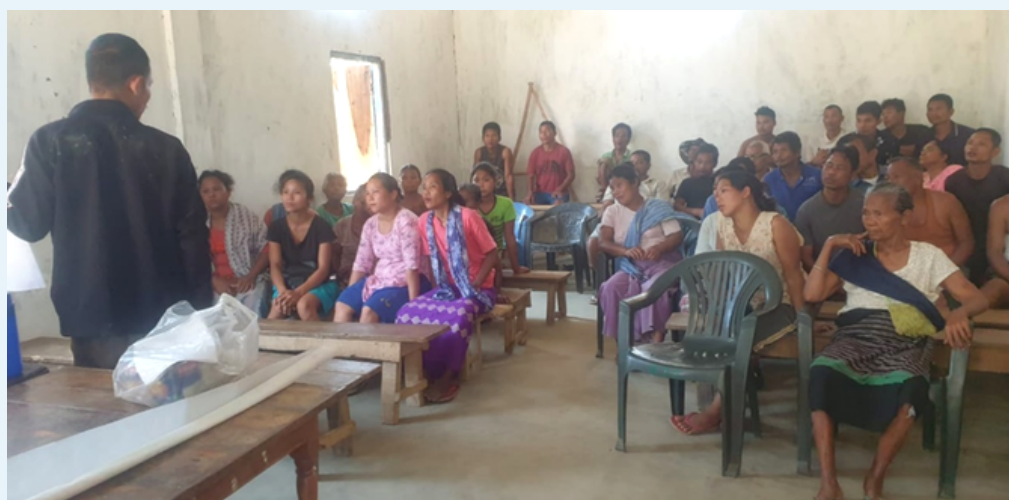
Continuation of Microplanning & PLUP exercises at Ajasiram Ajasiram Village, Resubelpara, NGH