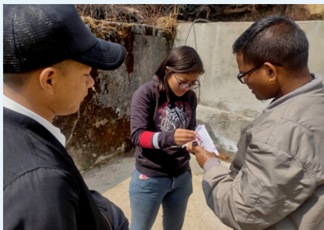
Laitryngew, Shella Block, Khasi Hills District.

The water resource team on 7th March 2023, conducted a site inspection and provided instructions for ongoing work for open limestone channel (OLC) under MLAMP while also conducting a water quality check using the water test kit in two villages.