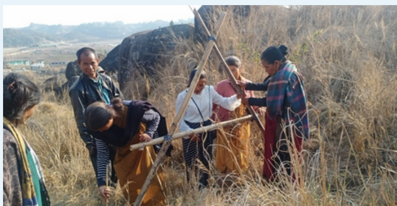
One day orientation on SALT farming was conducted for new farmers of MegLIFE project villages under Mawkyrwat Block, SWKH.