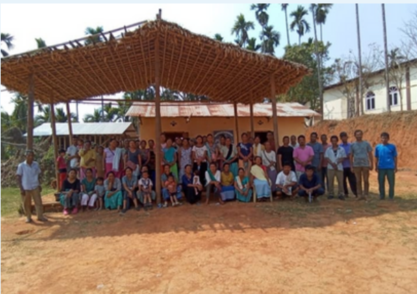
VPIC meeting conducted at Anogre, Rongram, WGH.