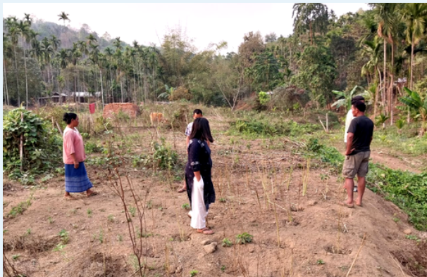
Rompa, Resubelpara, NGH