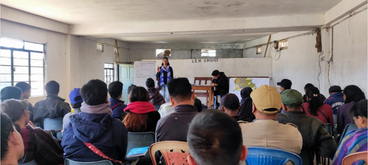
VPIC Meeting on plantation, community hall construction & maintenance of registers, Mawkynrew, EKH.