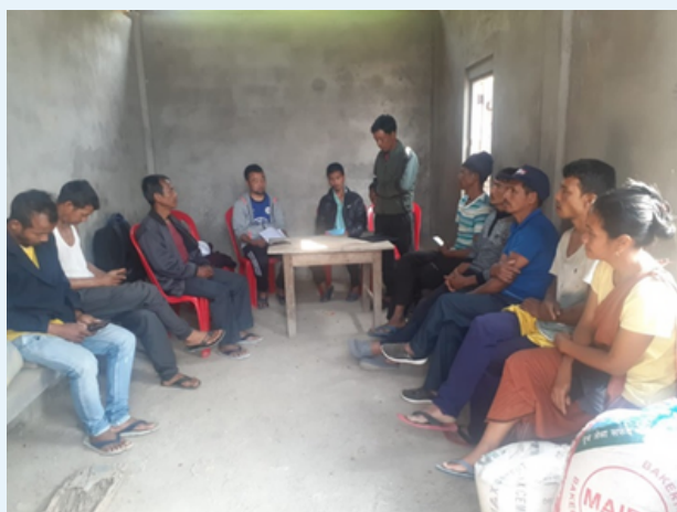
VPIC meeting conducted at Pyndensohlang, Mawkyrwat, SWKH