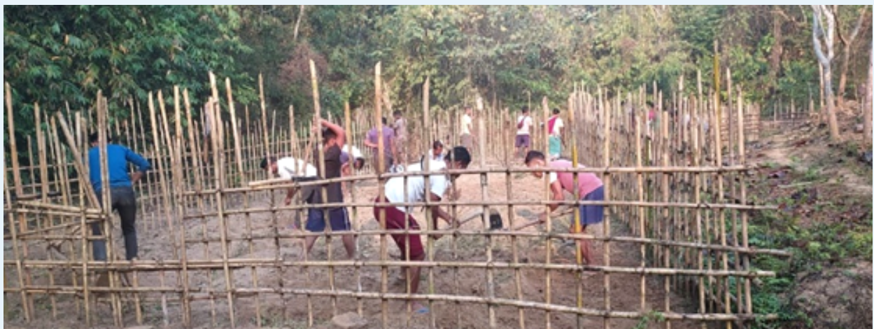
Darit Simragittim Village, Gasuapara, SGH, preparing for Community Nursery.