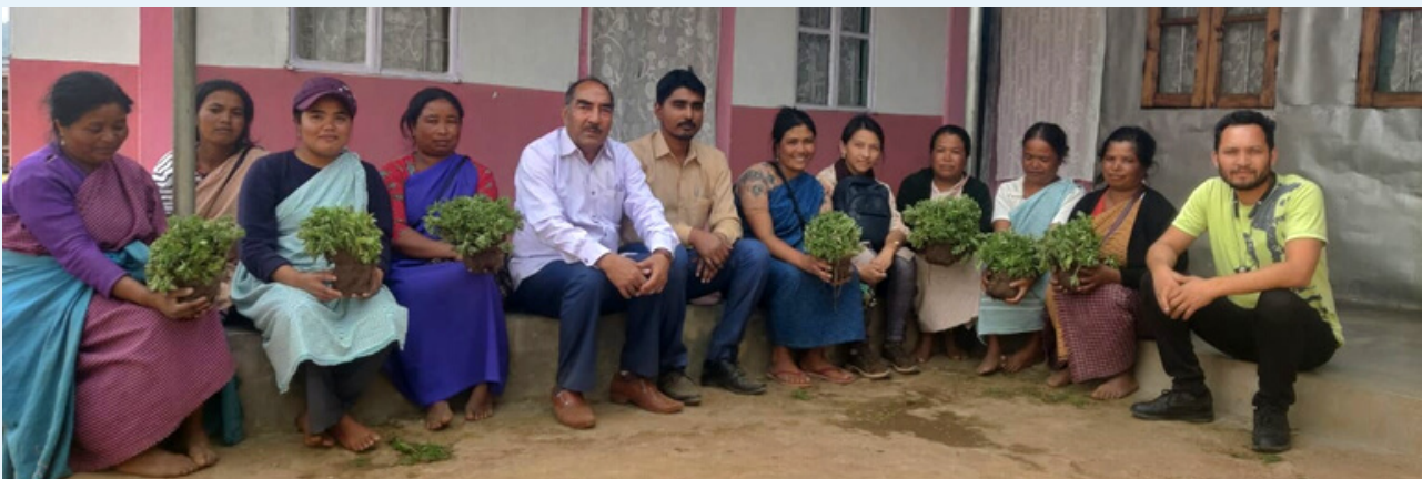
Distribution of Geranium plants to Puin SHG at Pyndenglitha, Mawphlang Block, East Khasi Hills district.

The Megh Aroma team, accompanied by CIMAP personnel, visited different villages to distribute geranium saplings and provide onsite demonstrations.