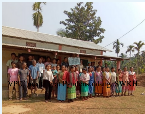
VPIC meeting at Pyndensohlang, SWKH.