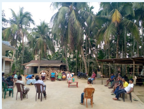
VPIC EC meeting conducted at Dilsinggre Village, Rongara, South Garo Hills