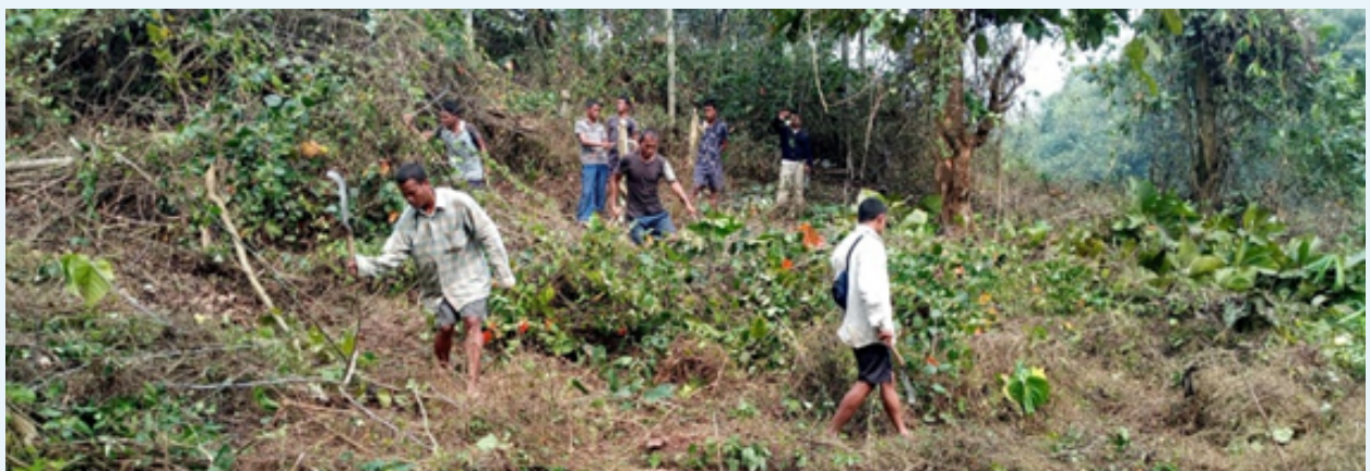
Clearing jungle for Community Nursery at Dangkong Dokatong, Songsak Block, EGH