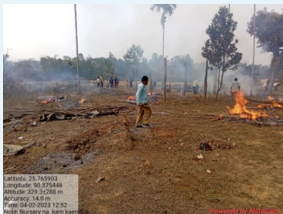
Silsekgre, Rongram, WGH