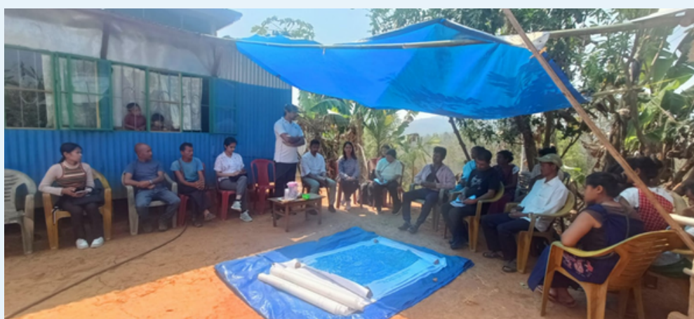
Visit of APD, Shri Gunanka DB, IFS to Mairang Block, WKH.