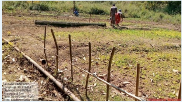
Sasatgre, Rongram, WGH