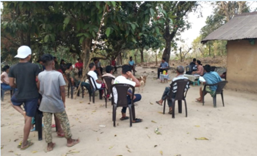
VPIC meeting conducted at Darenggagre Village Dalu, West Garo Hills.