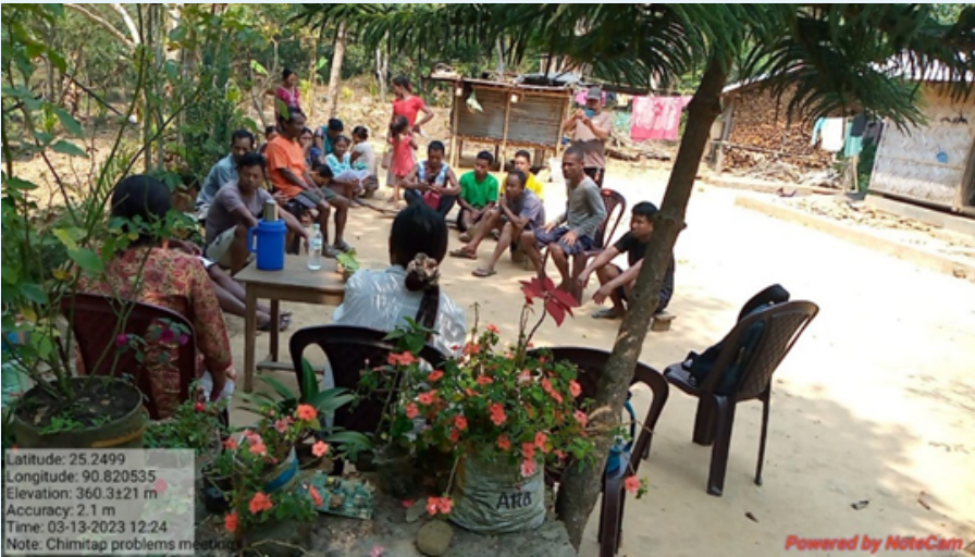
VPIC EC meeting at Chimitap Village, Rongara, South Garo Hills.