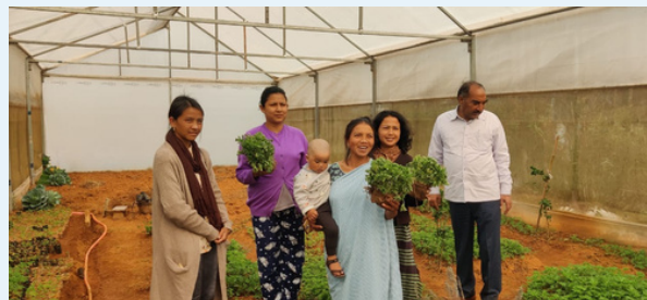
Mawreng Village, Mawphlang block, East Khasi Hills district