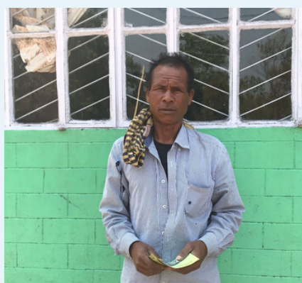
Amlamet Amlarem block West Jaintia Hills