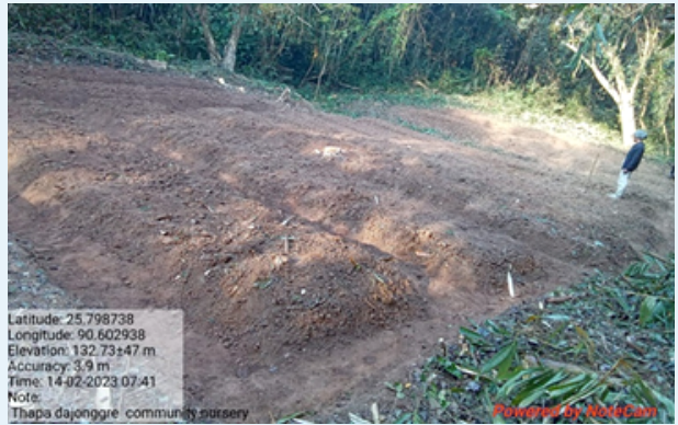
Thapa Dajonggre, Resubelpara, NGH