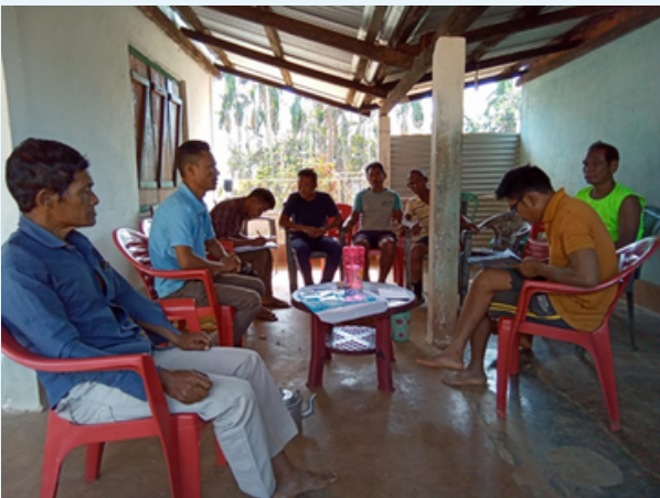
VPIC meeting conducted at Manggakgre, Rongram, WGH.