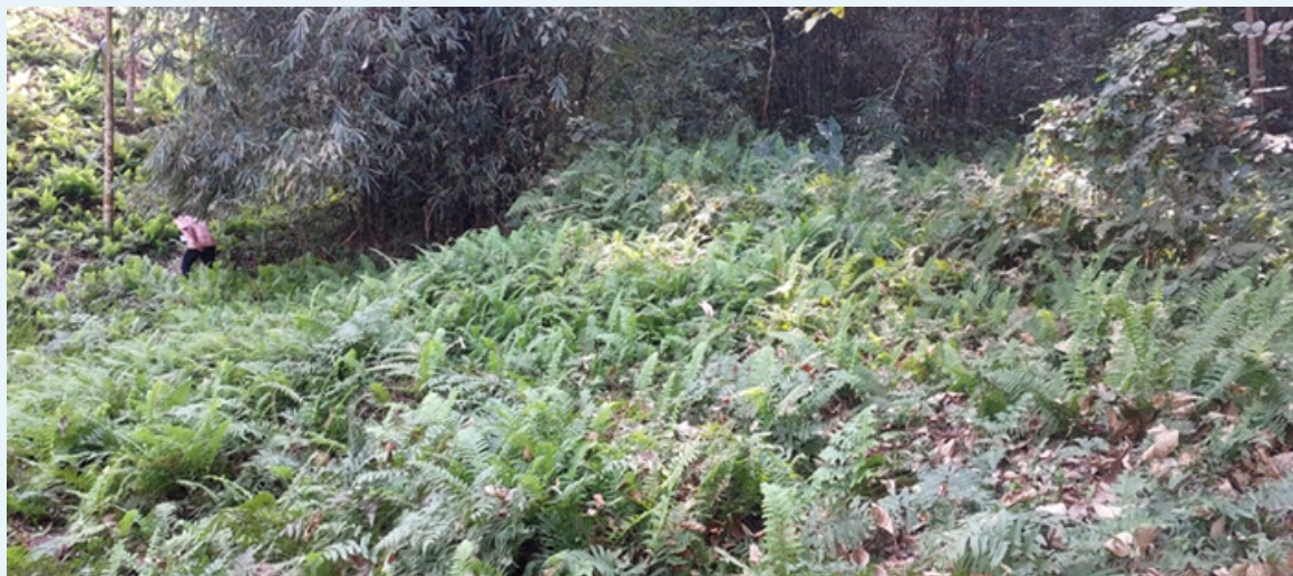
Demarcation of Plantation site for Kasibil & Ajonggre village under Betasing Block, SWGH.

Plantation demarcation status of Rongram block: plantation demarcation at Derikgre has been completed with private land making up 68.3 hectares and community land making up 3 hectares bringing the total up to 71.3 hectares. All 9 villages of the block are in process of demarcation with a total of 187.2 hectares for 10 villages as on 07.03.2023.