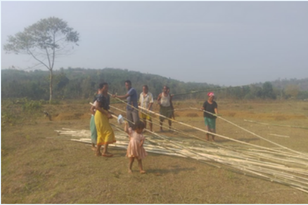
Chorepahar VPIC members preparing bamboo fencing, Resubelpapa, NGH.