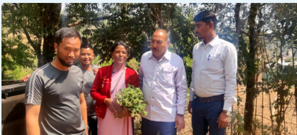
Mawphanlur Village, Mawthadraishan block, West, Khasi Hills district