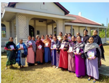
Pamphlet distribution in Mustem (Jaintia Hills)