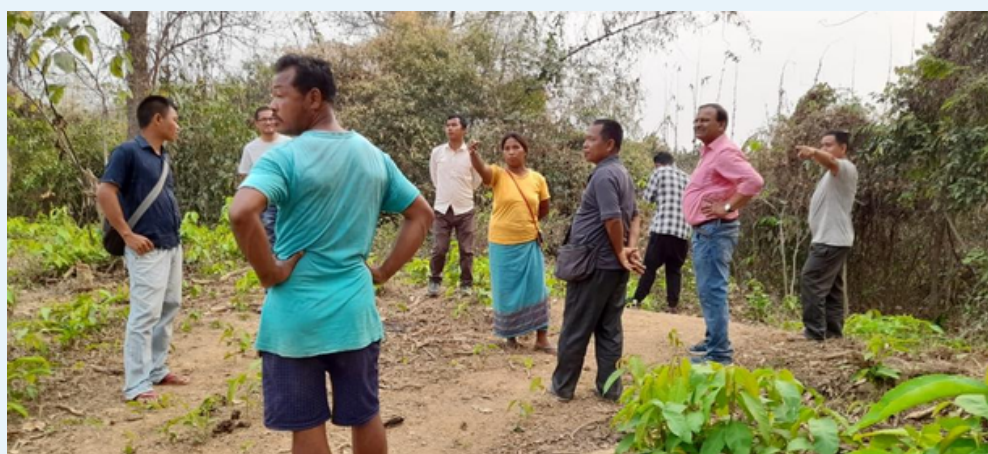
Inspection of Community Nursery and Community Hall at Ritekpara, Songmagre and Tarapara, Resubelpara, NGH.