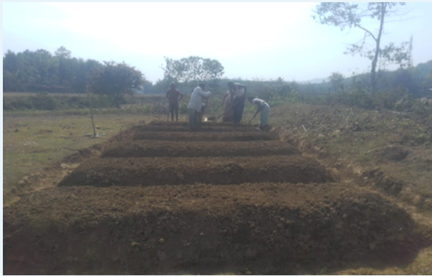
Galwangsa, Resubelpara, NGH