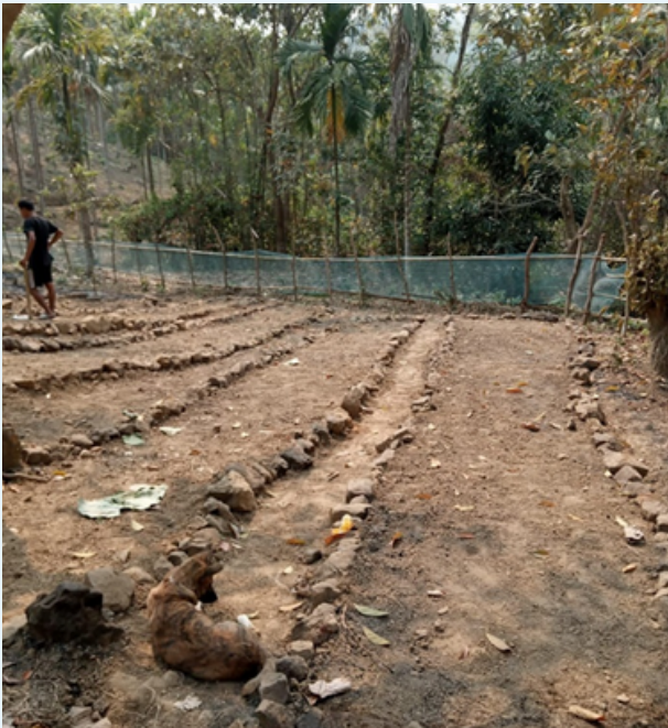
Preperation of land for Community Nursery, Waskogre Village, Gasuapara Block, SGH.