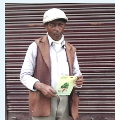
Mawkriah West Mawphlang block East Khasi Hills