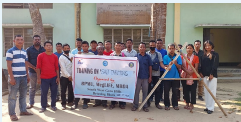
Training conducted for farmers of six villages under Betasing Block.