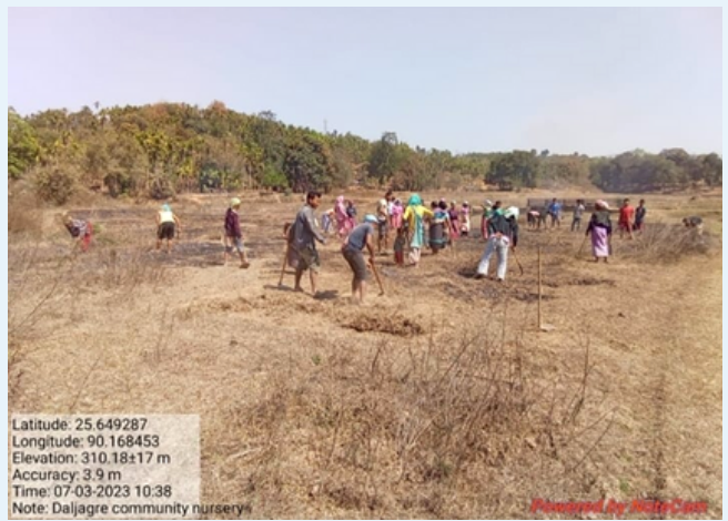
Daljagre, Rongram, WGH