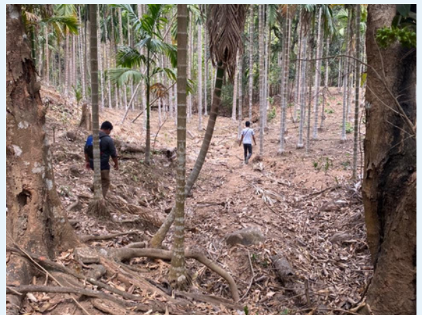
Site revisit to follow up on construction at Gonda Jasingre Village, Tikrikilla block, West Garo Hills district