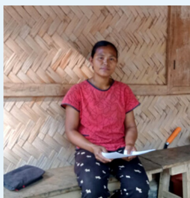
Samandalgre Damalgre block South West Garo Hills