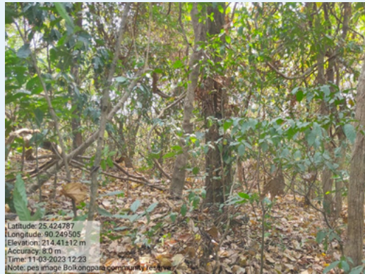
Bolkongpara community reserve