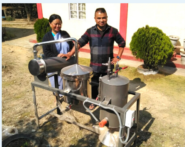
Larem SHG, Nongsynrih village, Mawkyrwat Block, SWKH district.

Overall, empowering entrepreneurs through the use of Field Distillation Units is a promising approach for supporting small-scale farmers and rural entrepreneurs, promoting sustainable economic development, and contributing to the achievement of Sustainable Development Goals.