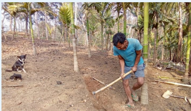
SALT farmer of Dijongro Apal, Rongram, WGH, preparing his plot.