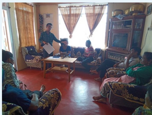
VPIC meeting conducted at Teksragre, Rongram, WGH

Meeting of the VPIC and landowners was held from the 8th to 11th March, 2023 in 7 project villages under Mawkyrwat C & RD Block, South West Khasi Hills viz, Nongnam, Mawbri, Mawtangden, Mawkhyrwang, Mawsain, Pyndenlyngdoh and Pyndensohlang.