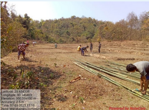
Marakapara, Rongram, WGH