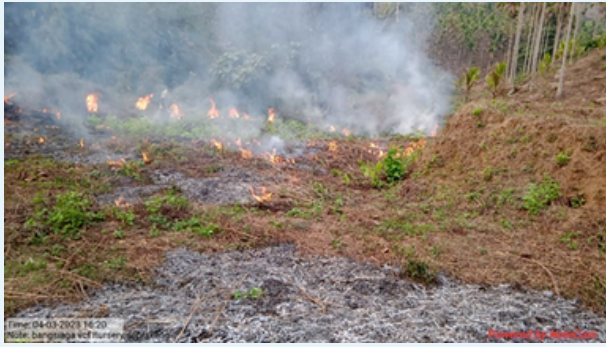
Bangsi A'ga, Resubelpara, NGH