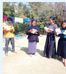
Home visits in Marshillong (SWKH)