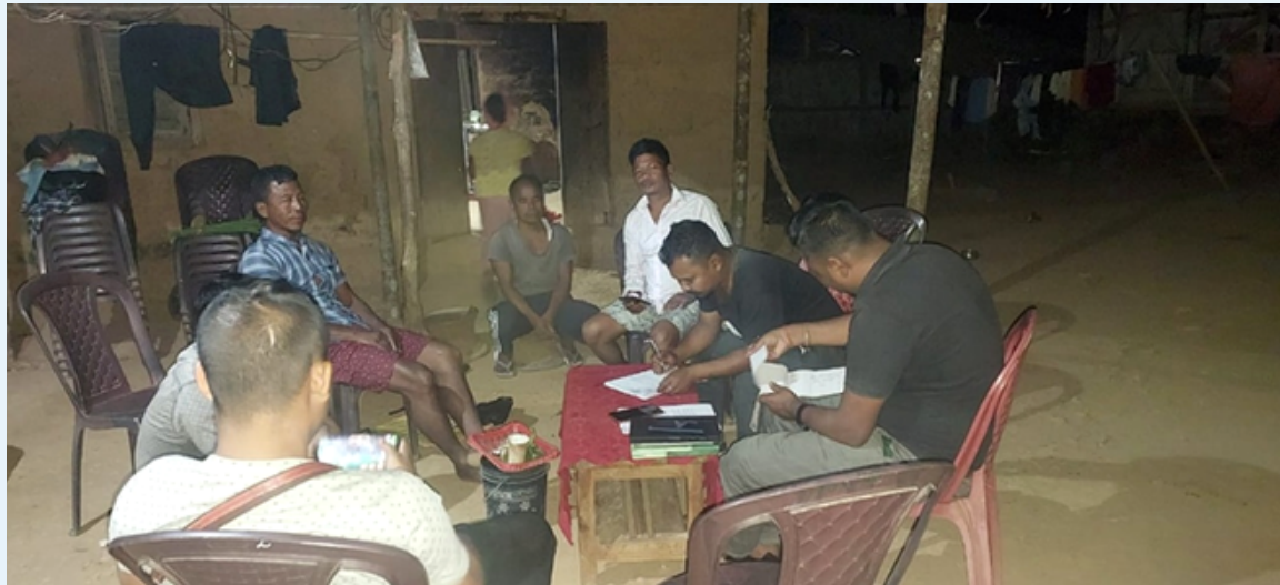
Discussion on identifying a suitable site for taking up plantation and negotiating an agreement for intervention on private land in Golmangre Village, Betasing Block, SWGH.

Advanced works for plantation are underway in all the blocks under the MegLIFE Project. 7500 Ha is targeted under the activity in 2023.