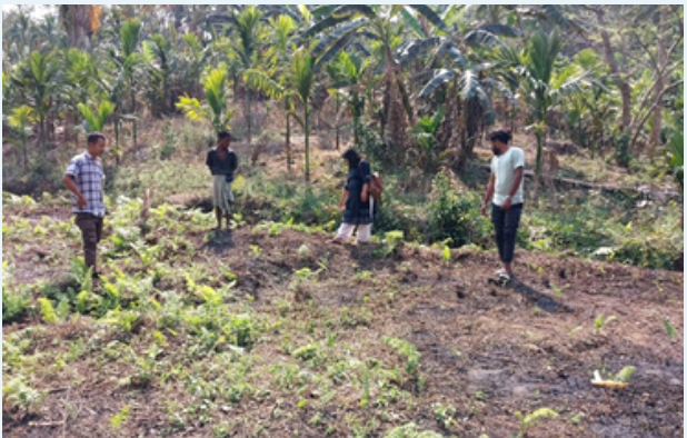
Guresimram, Resubelpara, NGH