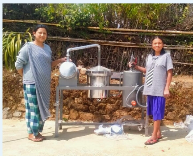
Iaiminot SHG, Mawreng village, Mawphlang Block, EKH district.