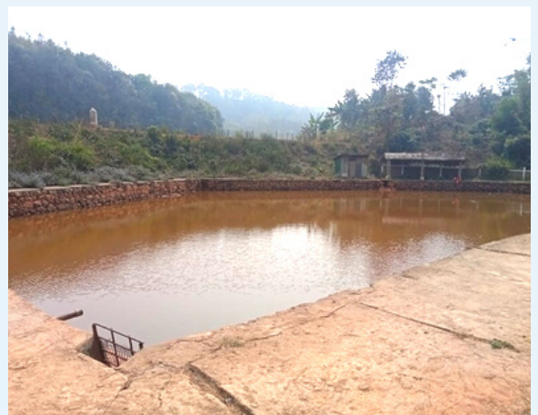
Site inspection at Nongbah Myrdon Village, Umsning block, Ri Bhoi district.