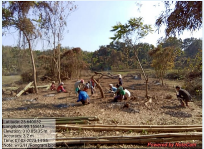
Bugakolgre, Rongram, WGH