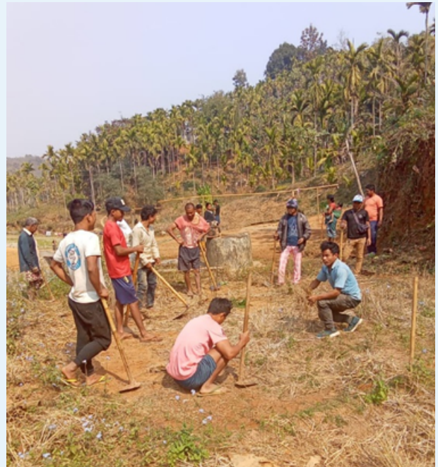
Jungle clearance for Community Nursery in Dangkong Chitoregre, Songsak Block, EGH.