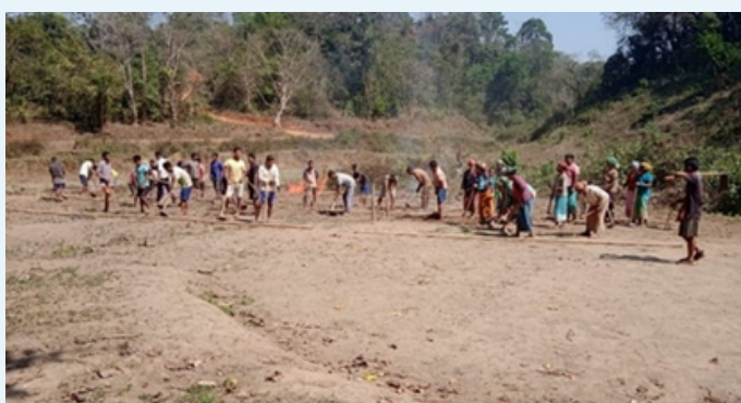
Renchagre, Rongram, WGH