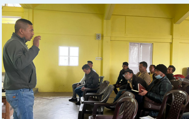
Orientation program for the beneficiaries at Jowai