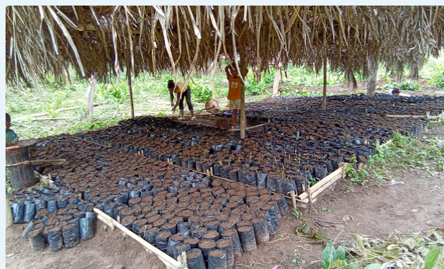
Community Nursery site at Bugakolgre Village under Rongram Block , WGH .