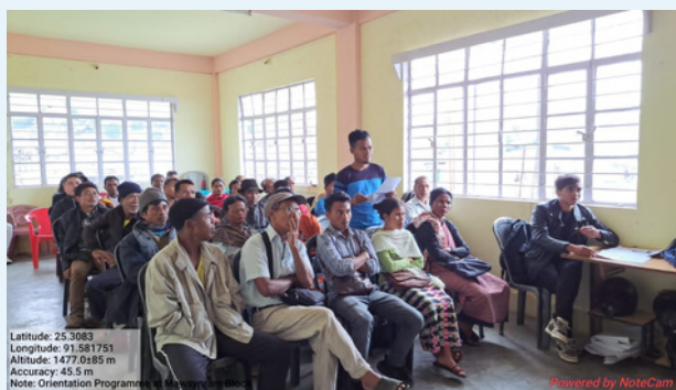
Orientation program at BDO Office, Mawsynram.