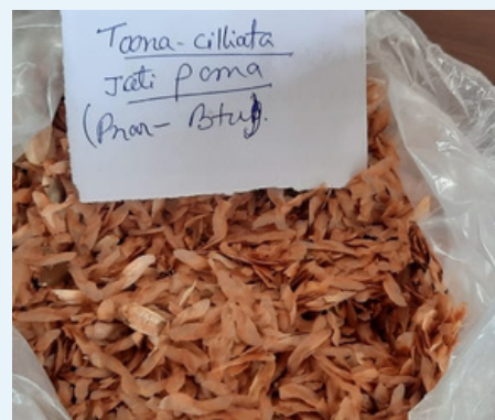
Toana- Ciliata Jati poma