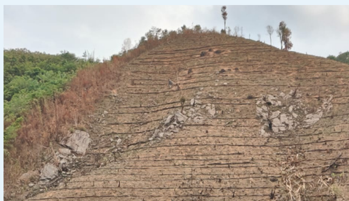
SALT farm prepared by Soil Department, EGH in Rongchekgre, Samanda Block, EGH.

SALT training is being imparted to farmers of the MegLIFE Project wherever feasible to improve land productivity and fertility. The technique is enthusiastically being adopted by the trainees.