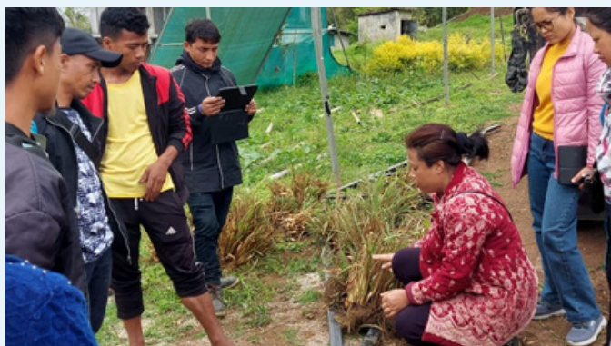
SALT Training conducted for 9 villages by MINR on planting aromatic grasses (Citronella) for SWC at Mawkyntrew, EKH.