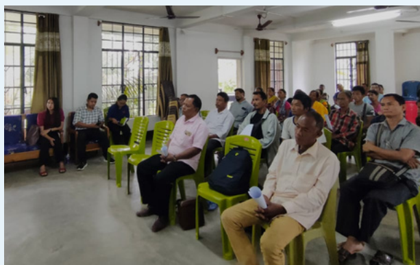
Orientation program for the beneficiaries at Baghmara

The purpose of these orientation programs was to ensure that the beneficiaries were well-informed about the different aspects of the scheme before they signed the Memorandums of Understanding (MoUs). By conducting these orientations, the GFAs aimed to provide comprehensive information and guidance to the beneficiaries, enabling them to make informed decisions and understand the benefits and requirements of the scheme. These orientations were conducted in close coordination and with the support of the respective DMPUs.