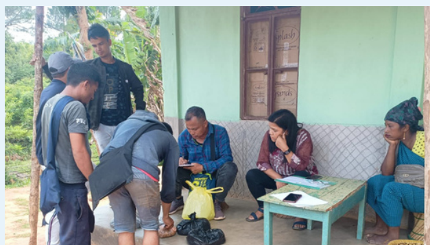
Discussion with the VPIC on Plantation and Community Nursery construction at Sohphohwaiong Village, Thadlaskein, WJH.