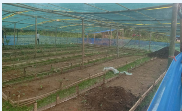
Community Nursery site of Nepalgre Village under Betasing, SWGH.