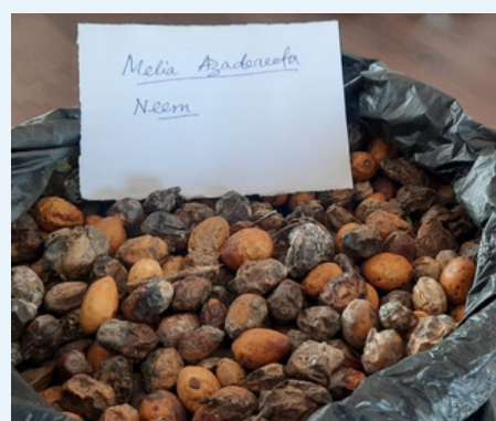
Melia Azadirachta / Neem