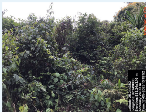
PES verification at Amlamet village. 2 Community forests verified