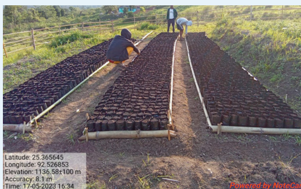
Community Nursery work in progress at Moolasngi Village, Saipung, EJH.