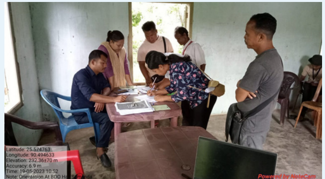
Orientation Program at BDO Hall Samanda Block