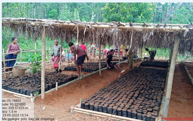
Community Nursery at Manggakgre Village under Rongram Block, WGH