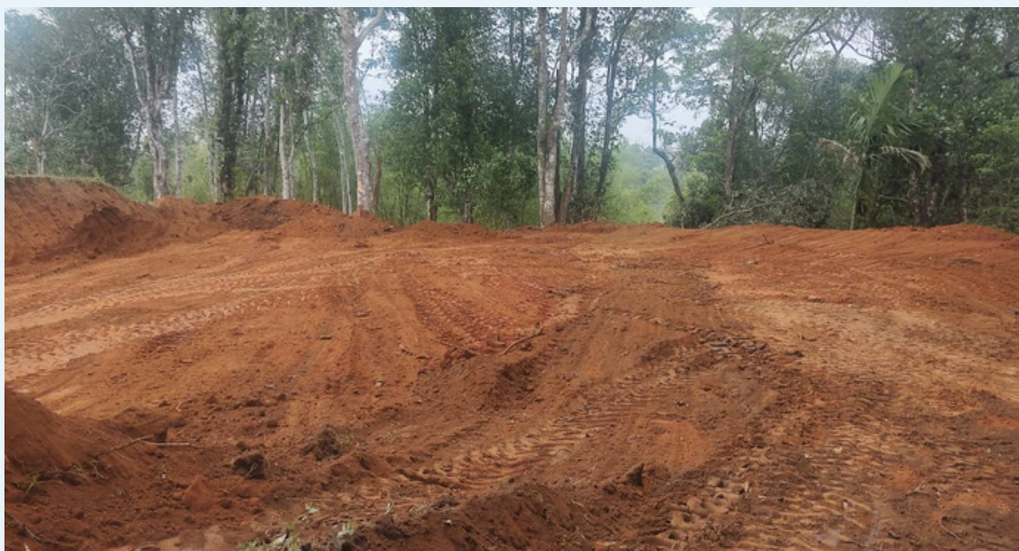
Kalak Songgital, Samanda Block, EGH, has started preparing land for Community Hall

The construction of 370 community halls has been sanctioned under EPA of MegLIFE. Initial phases of site preparation is underway.