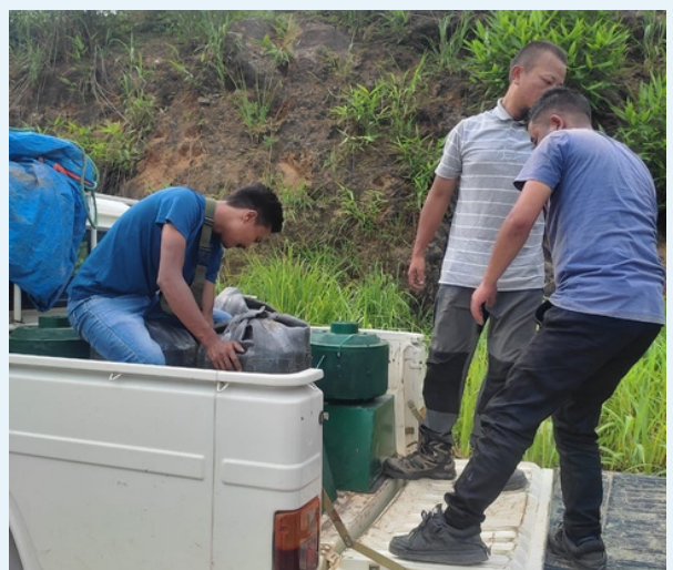
Shallang, Mawshynrut Block, West Khasi Hills