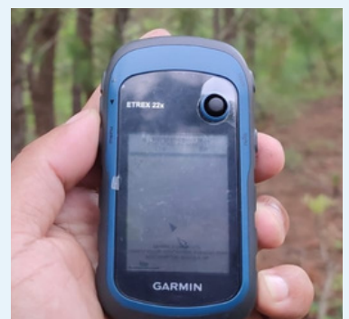
PES Verification & Boundary Mapping at Nartiang. 3 applications mapped & verified. Total forest area: 70 hectares approximately.