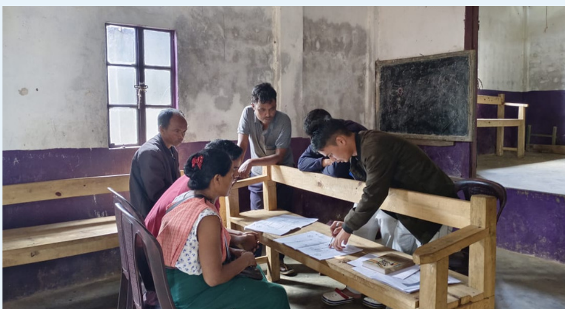
Workshop on Community Hall with Community Construction Committee at Sohphohwaiong Village, Thadlaskein, WJH.