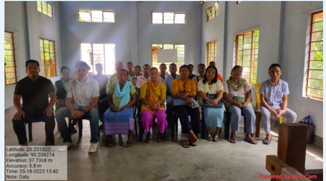
Orientation program for the beneficiaries at Dalu block