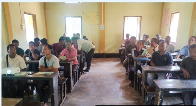
Orientation program at Dambo Rongjeng