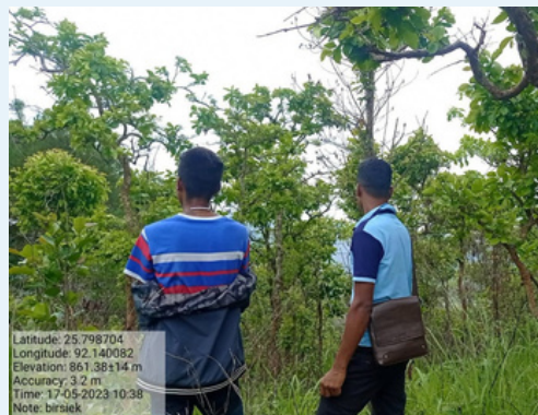
PES Verification at Birsiej village, Bhoirymbong Block Ri Bhoi District