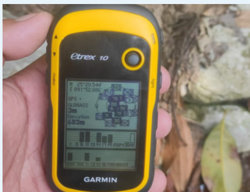
PES Verification Community forest, Nongblai