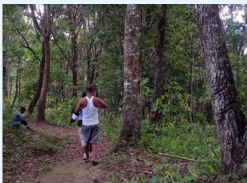
PES Verification at Khyndewso village, Bhoirymbong Block, Ri Bhoi District