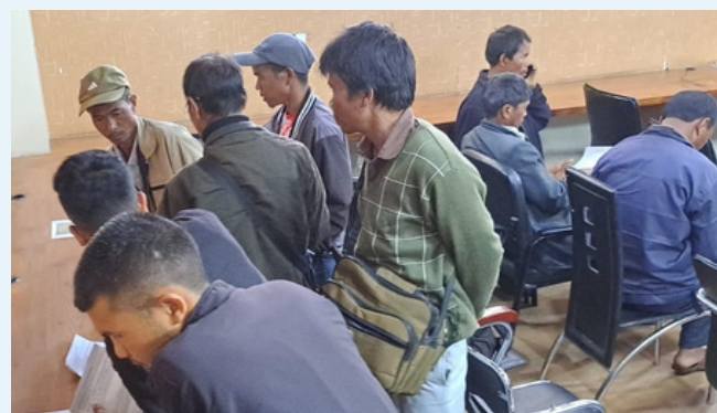
Orientation Programme at MBDA Hall for Pynursla, Khatarshnong-Laitkroh, Shella and Mawkynew Blocks and signing of the MoUs