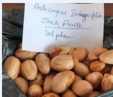
Artocarpus Integrifolia / Jack fruit