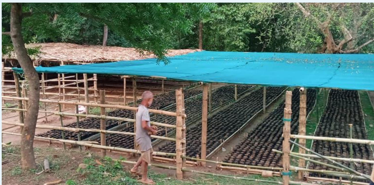
Community Nursery at Balikimgre Village, Gambegre Block, WGH.