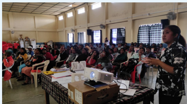
Orientation program at Mawkyrwat