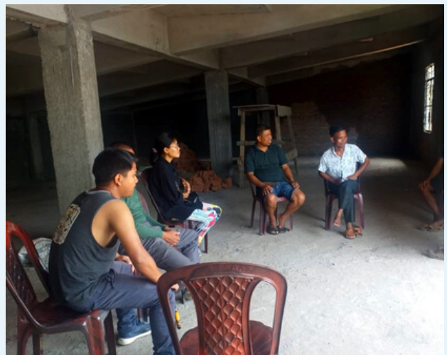
Gambagre, Rerapara Block, South West Garo Hills