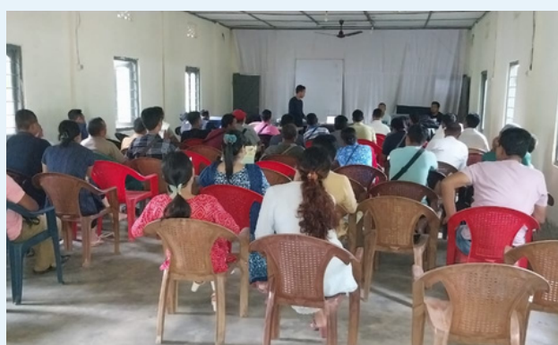
Orientation program for beneficiaries from Resubelpara and Kharkutta.