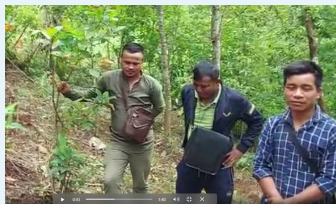
Visit to SALT farm in Umsning Block, Ri Bhoi