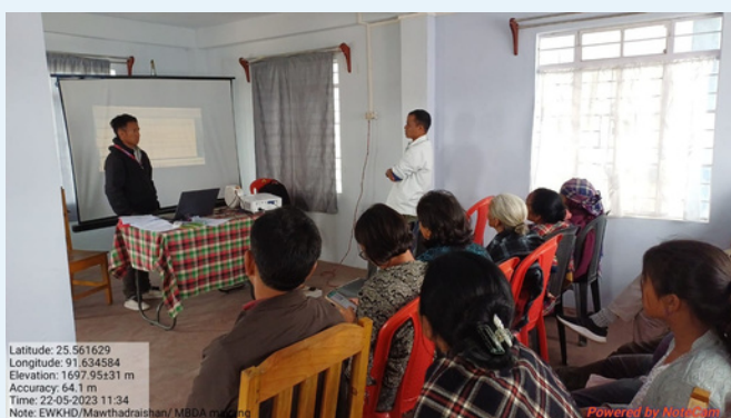
Orientation program at Mairang block