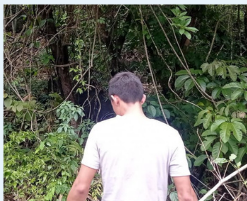
Verification at Liarkhla village, Bhoirymbong Block Ri Bhoi District