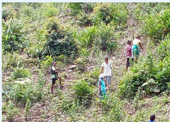
Staking at Dobakol Changalgittim, Bhagmara, SGH