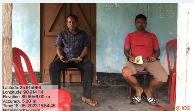
Konchikol Apal village