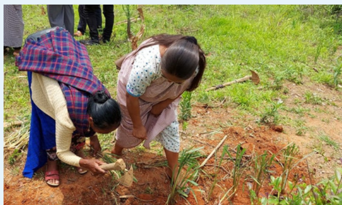
Training on planting citronella barriers for SWC in Mairang Block.