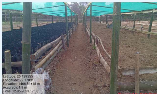
Community Nursery of Demthring VPIC under Thadlaskein, WJH.