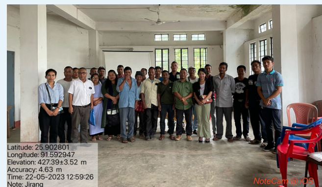
Orientation program at Jirang C&RD