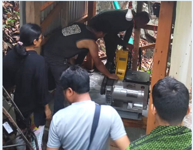
Dalmagre Village, Rongram Block, West Garo Hills