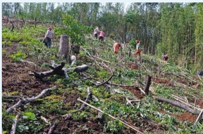
Plantation work in progress at Manggakgre Village, under Rongram, WGH.