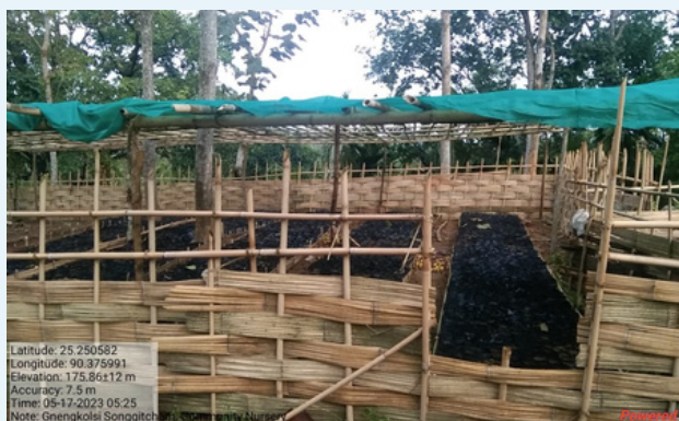
Community Nursery of Gnengkolsi Songgitcham Village, Gasuapara, SGH.

433 Villages under MegLIFE Project have elected to set up community nurseries. Following the completion of preparation of nursery mother beds where seeds will be sown, communities are working on filling Polybags with potting material; a mix of soil, sand and compost (in prescribed proportion). Polybags are for transplanting the small seedlings from mother bed into a container for transportation to the planting site.