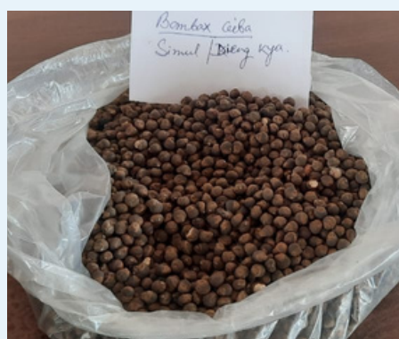
Bombax ceiba / Simul