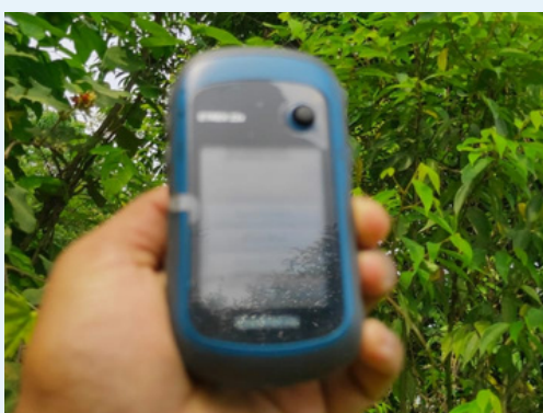
PES Verification at Umsning Block, Ri Bhoi District