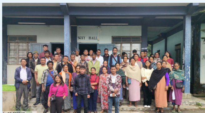
Orientation program at Nongstoin Block office