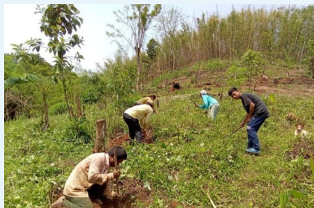
Plantation WGH work in progress at Silsekgre Village, under Rongram, WGH.