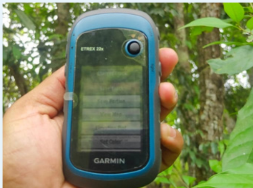
PES verification at Mawhati Ddeng village under Umsning block