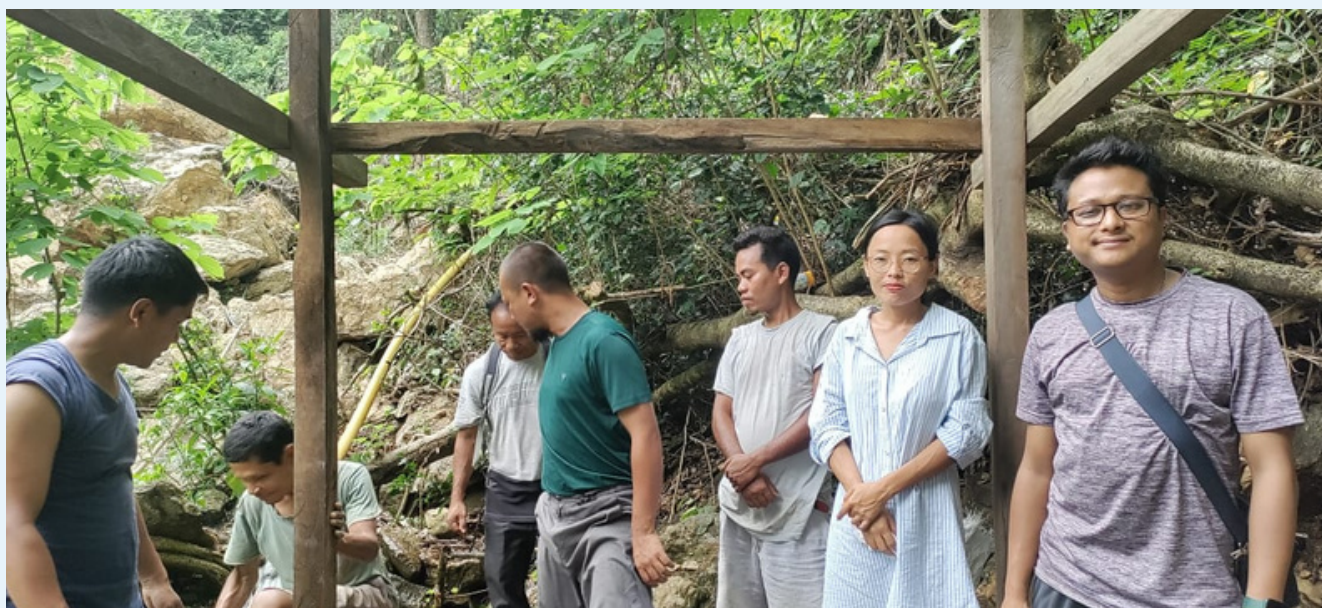
Lower Dobakol, Baghmara Block, South Garo Hills