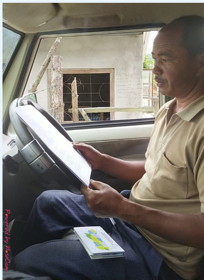
Khatarshnong Laitkroh Block