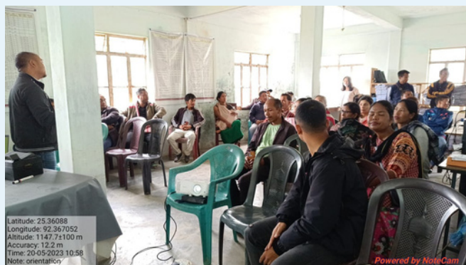
Orientation program at BDO Khliehriat block