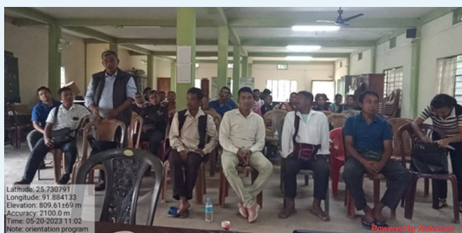
Orientation Program for Umsning, Umling, and Bhoirybong Blocks at BDO Office Hall, Umsning, Ri Bhoi District.