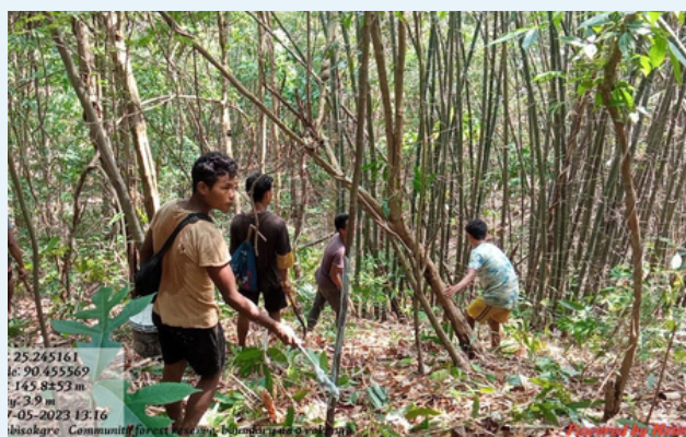
At Gasuapara Block, SGH, Tebisokgre Village's VPIC is now marking boundaries and choosing key timber and water-friendly tree species for regrowth at their plantation site.