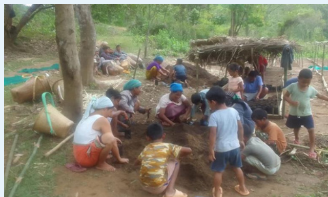
Community Nursery at Dorenggre Village, Gambegre Block, WGH.