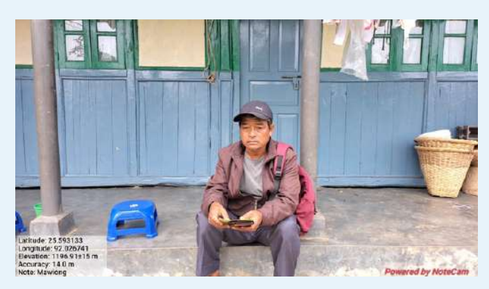
Headman of Sohlaper village