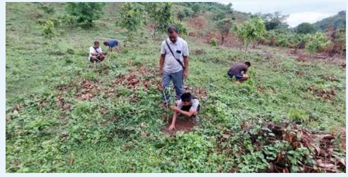
1600 seedlings from SWC Nursery were planted at Malchapara Community Land