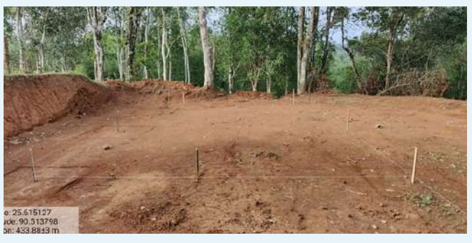
Alignment in progress in Kalak Songgital Village, Samanda Block