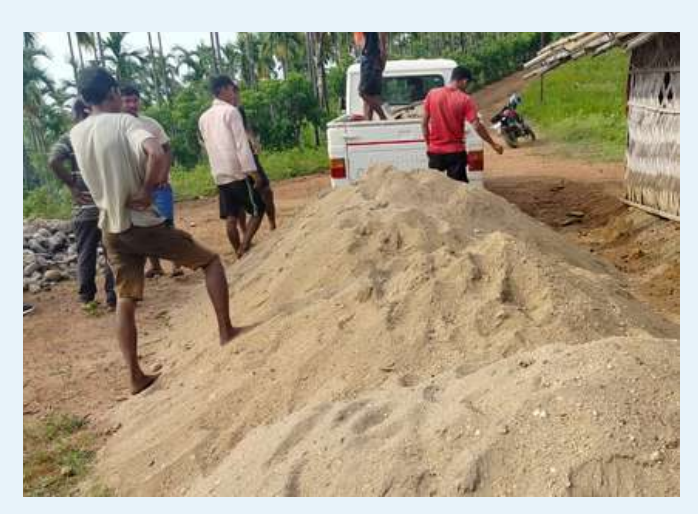
Boulders and sand delivered to Danal Dasik