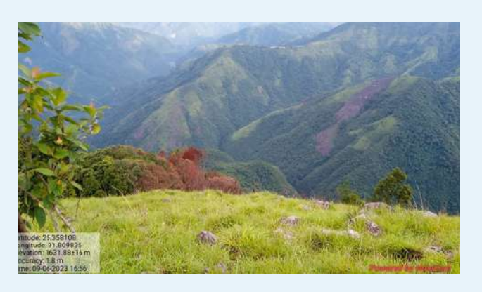
PES Verification at Rangra Forest Mawrah