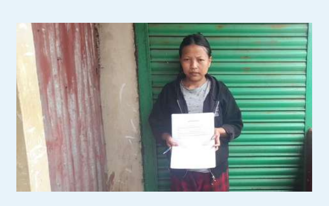
Collected MOU from Shella Block