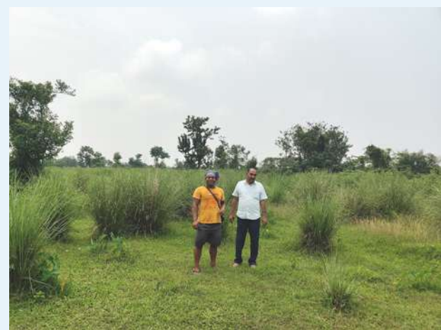
Monitoring of Vetiver Plantation at Pyrdiwah village, Pynursla Block ,East Khasi Hills District.