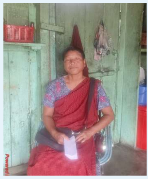
Forest owner of Madanbynthet village