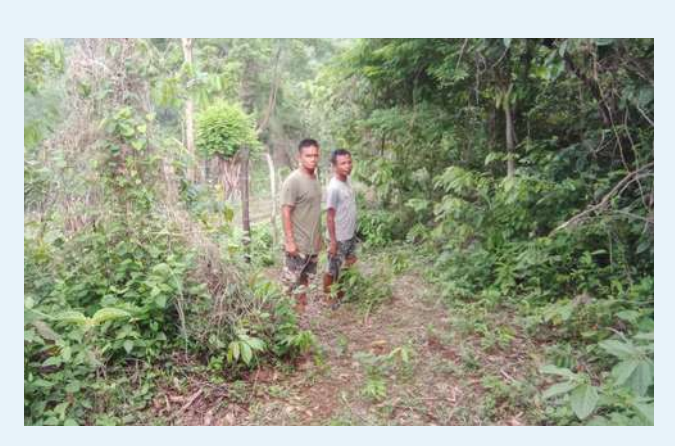
PES verification at Wakantagre village