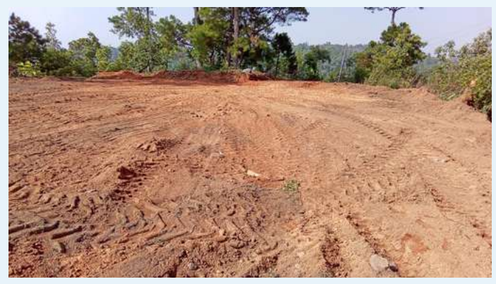
Work for Community Hall in progress at Iongsniehtakhniang, Thadlaskein

The construction of 370 community halls has been sanctioned under EPA of MegLIFE. Initial phases of site preparation is underway.