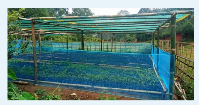
Na'nil A'pal, Resubelparaa