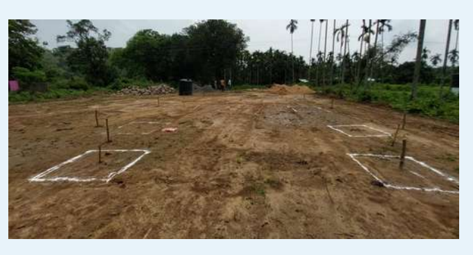
Footing Alignment, Rangdapara, Dalu Block