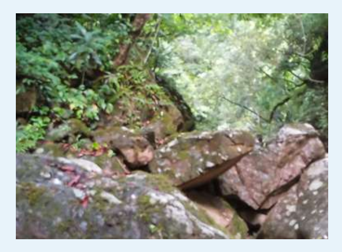
PES verification at Diengsang forest Mawrah village, Khatarshnong Laitkroh block