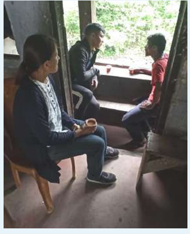
Site feasibility, for the cultivation of MAPs conducted at Umwai village, Shella Bholaganj, East Khasi Hills District.