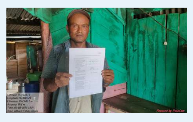
Collected MOU from Sakahain village