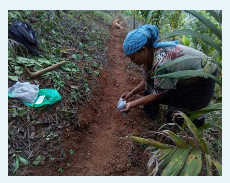
Preparation of SALT farm in Gitokgre

SALT training is being imparted to farmers of the MegLIFE Project wherever feasible to improve land productivity and fertility. The technique is enthusiastically being adopted by the trainees.