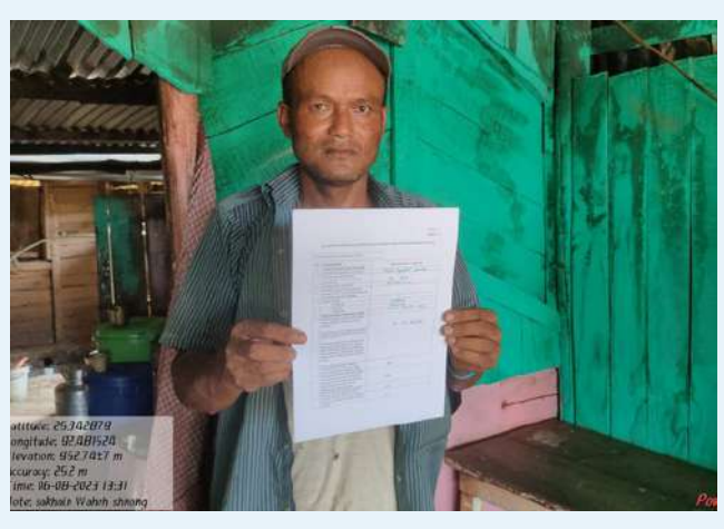
Headman of Sakhain village