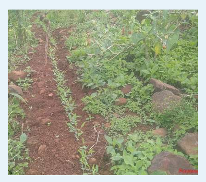
Germination of NFPs at Rangphlang village, Mawkynrew Block