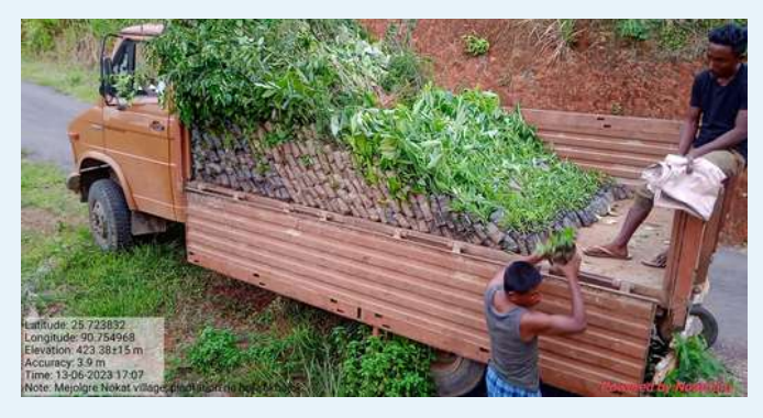
Mejolgre Nokat village lifted seedlings from SWC