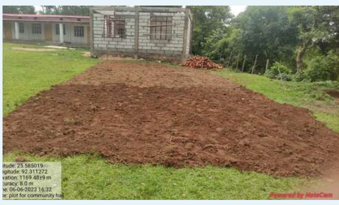
Work for Community Hall in progress at Madansynrang, Thadlaskein