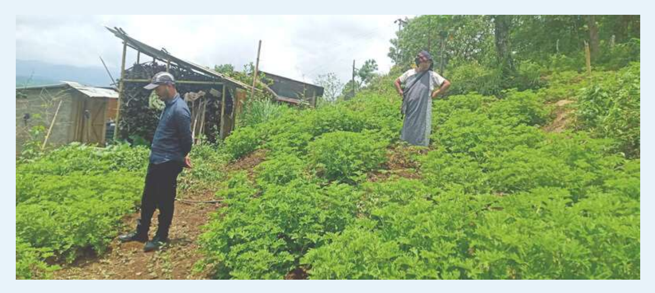
Follow up and monitoring at Umdohbyrthih, Bhoirymbong Block, Ri Bhoi District.