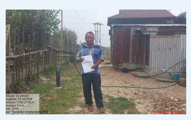
Mawpran Nonglyndiang village