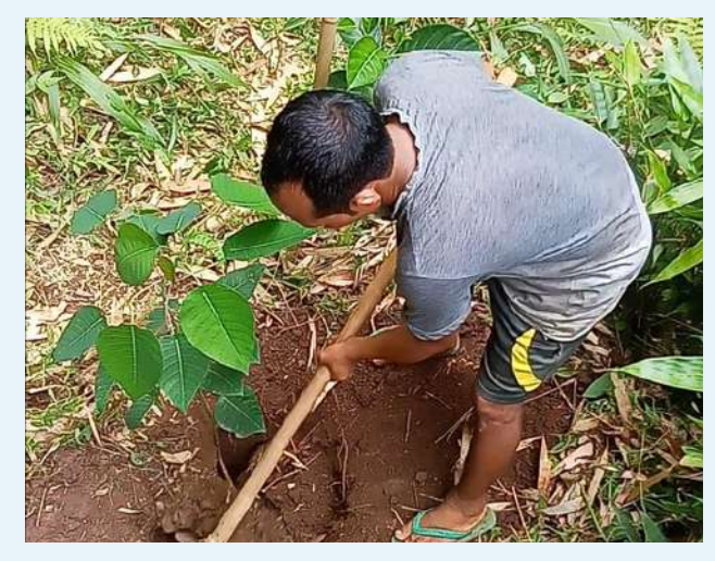
Plantation in Thaugittim village

MegLIFE communities are hard at work to achieve the project's goal of covering 22,500 hectares of plantation. Site preparation and advance works are currently underway.