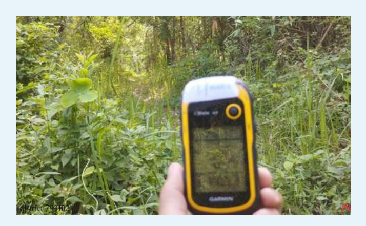
PES verification at Jowe village