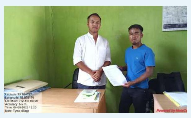
Collected MOU from Tyrso village