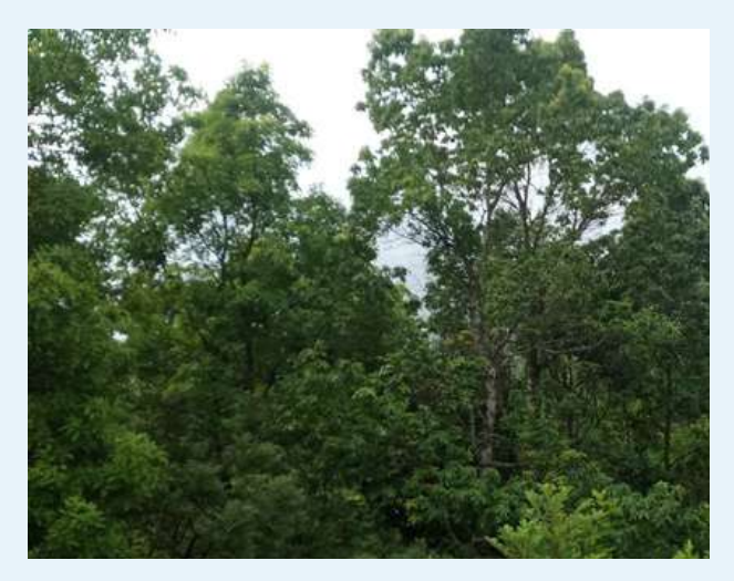
PES Verification at Daistong village