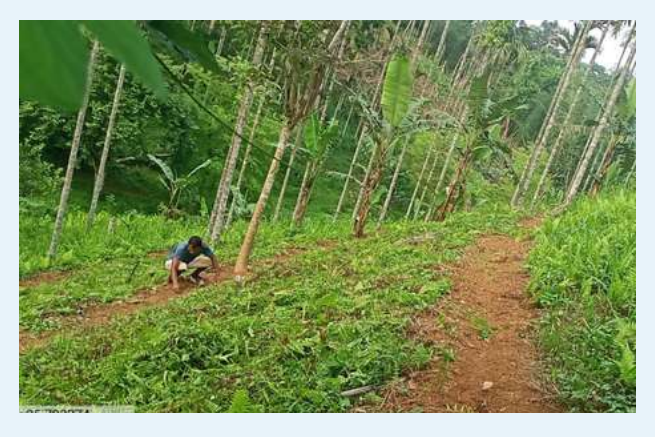
Preparation for SALT cultivation, Dijingro Apal