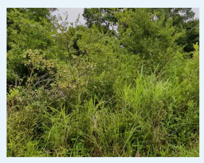
PES Verification at Rohbah village.