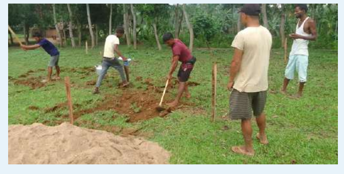
Ajasiram starting earthwork for Community Hall Construction