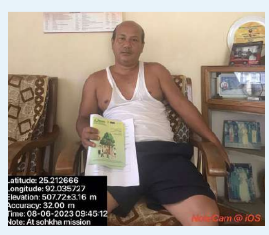
Forest owner of Sohkha Mission village