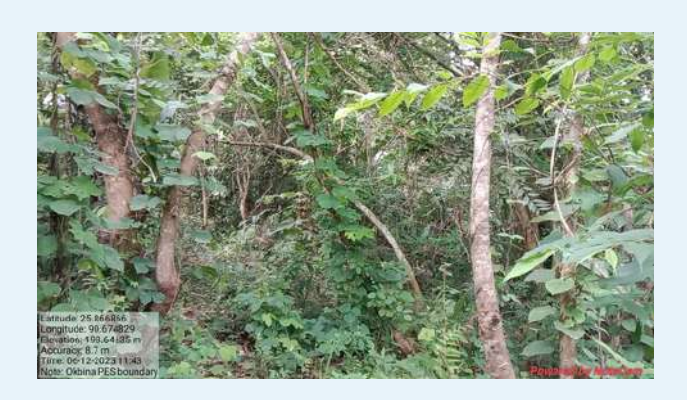
Okbima Resubelpara Block PES verification by VCF, Pinku Hato