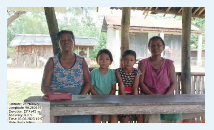
Villagers of Ruga Ading, Gasuapara block