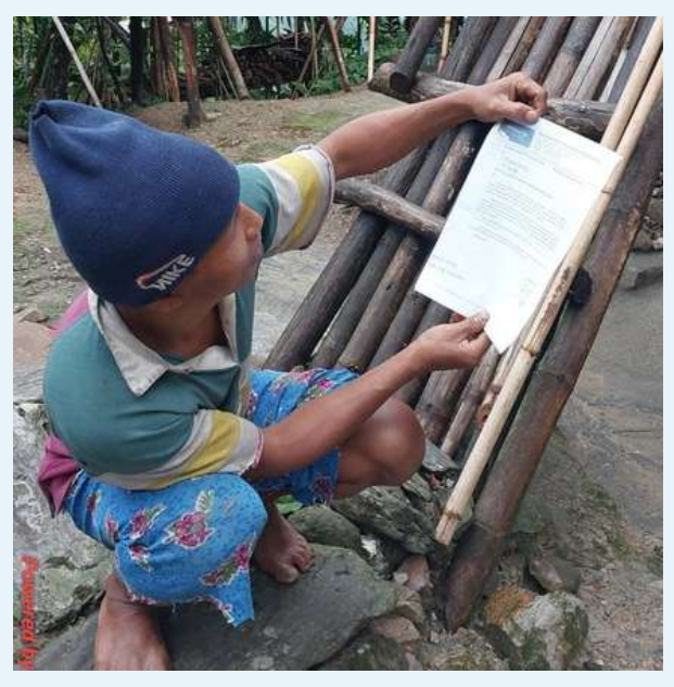
Headman of Lyngngai village