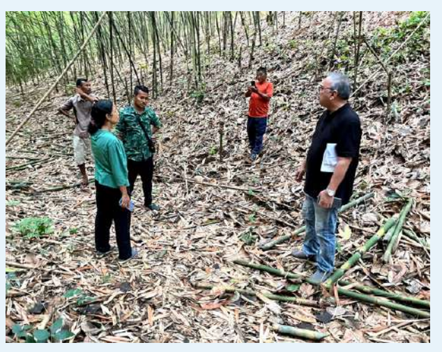
Plantation site of Miktongjeng village.