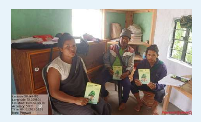
Forest owners of Pingwait village