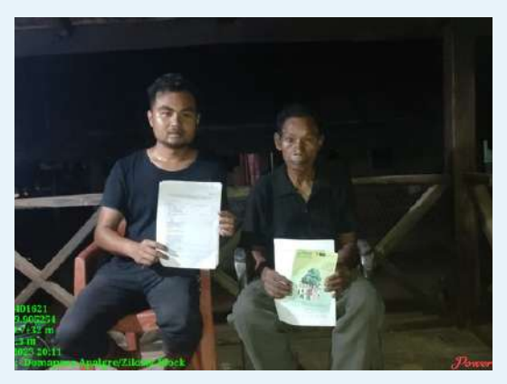
Secretary of Domapra village