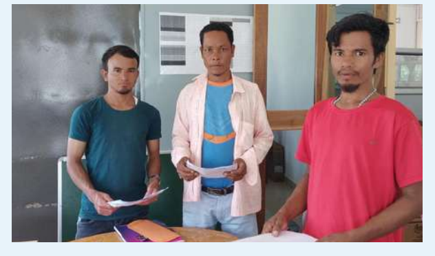
Collected MOU from Suchen village