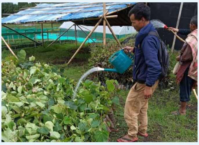
Watering and lifting of saplings in Mawkathein village