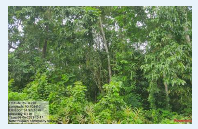
PES verification at Bugakolgre community Reserve, Chokpot, South Garo Hills