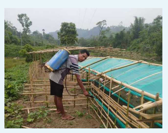
VCF of Nengkongkil Village watering the nursery