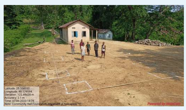
Column alignment done for CH by FEs at Nalnapara Village, Gambegre Block.