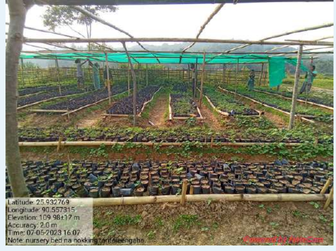
Chorepahar Village Rebuilds Green Net After Devastating Storm

433 Villages under MegLIFE Project have elected to set up community nurseries. Following the completion of preparation of nursery mother beds where seeds will be sown, communities are working on filling Polybags with potting material; a mix of soil, sand and compost (in prescribed proportion). Polybags are for transplanting the small seedlings from mother bed into a container for transportation to the planting site.