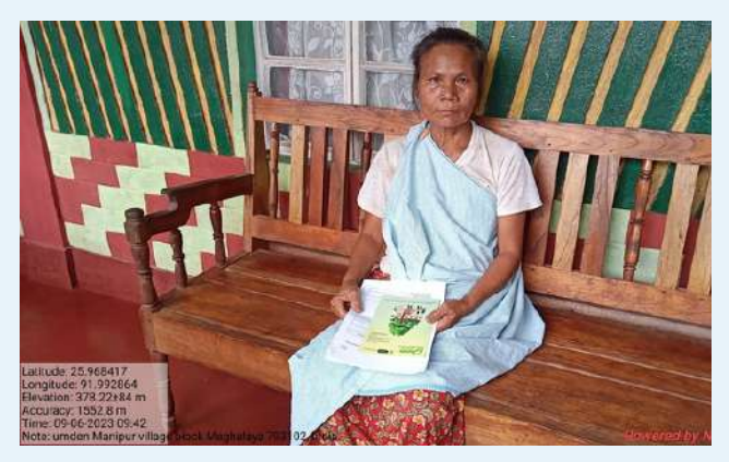
Forest owner of Umden village