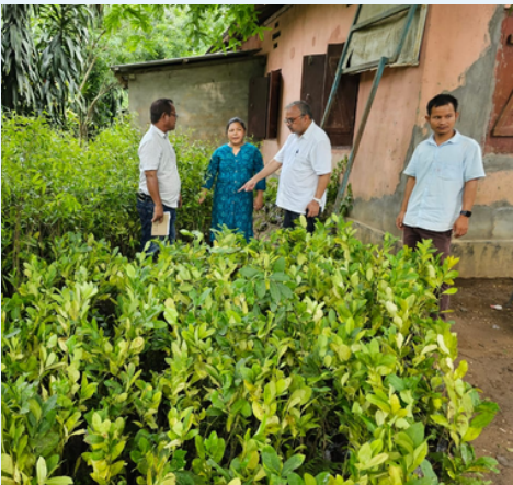
Lifting seedlings from Samgong Nursery for Rongpetchi Cluster, EGH