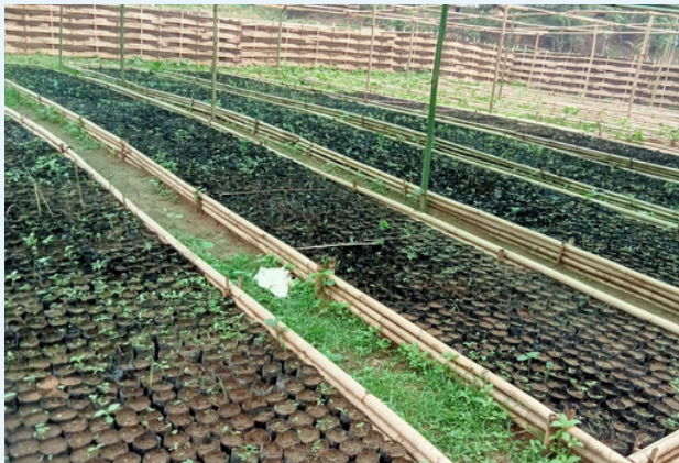
Community Nursery of Ruatsogre Village, Gasuapara Block, SGH