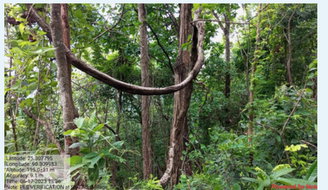
PES verification at Silki Adu village (Gasuapara Block)