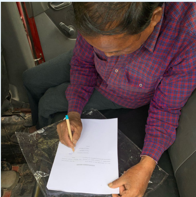
Collected MOU from Thadlaskien