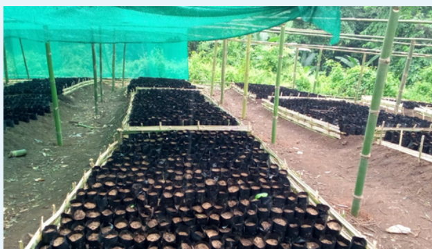
Arengdo Village Community Nursery under Kharkutta Block, NGH