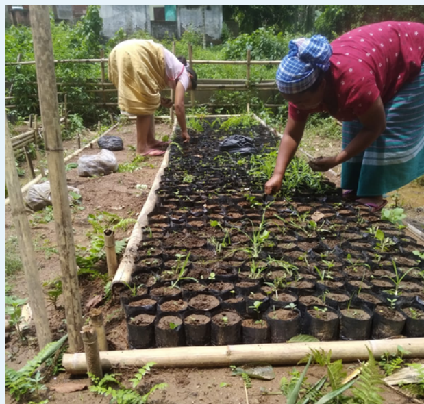
Planting tegatchu / mangiferrea indica, tebrong / artocarpus heterophyllus .