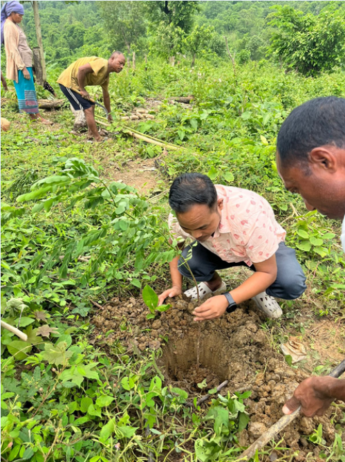
Afforestation in barren land at Wakolnanggre Village, Gambegre Block. Target: 4.3 ha area, 4730 seedlings.

MegLIFE communities are hard at work to achieve the project's goal of covering 22,500 hectares of plantation. Site preparation and advance works are currently underway.