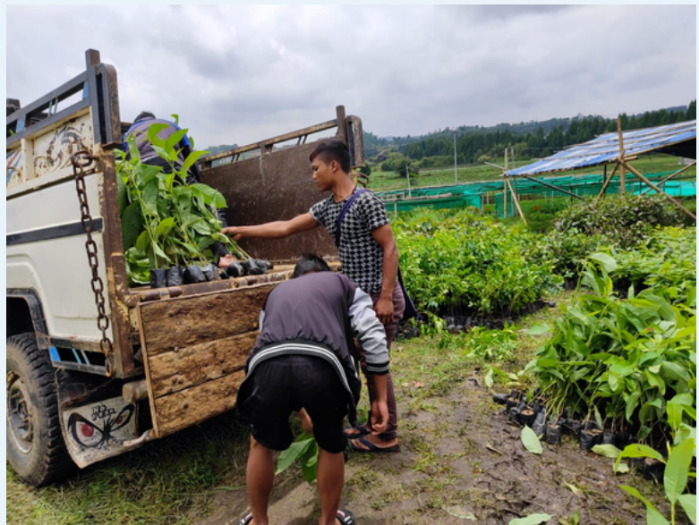
Laitmysang VPIC, Mawkynrew, EKH, lifted 2100 saplings from Smit nursery