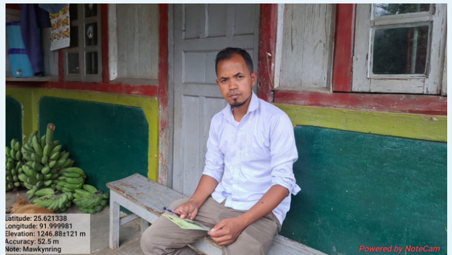
Headman of Mawkyring village