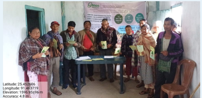
Latitude: 25.452606 Longitude: 91.463719 Elevation: 1596.95±96 m Accuracy: 4.8 m