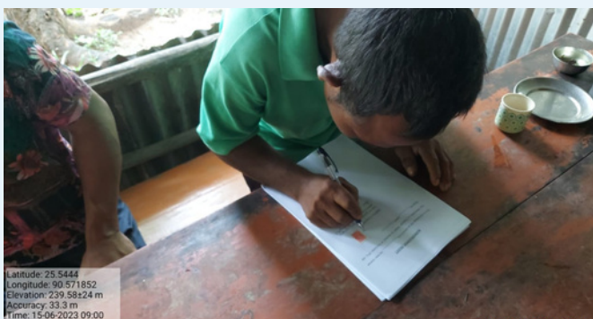
Collected MOU from Rongap Songgita