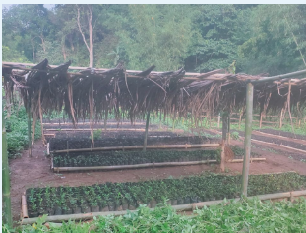
Bibrage Community Nursery under Rongram Block, WGH