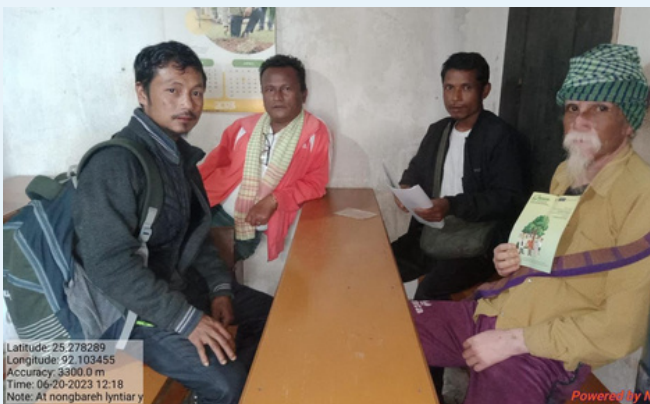
Members of Pohlong clan at Nongbareh Lyntiar village