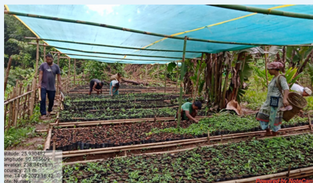
Community Nursery, Nokatgre Village, Resubelpara Block, NGH