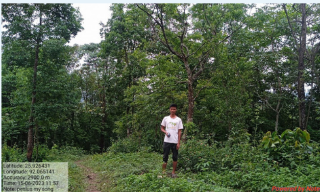
PES verification under Umsning block