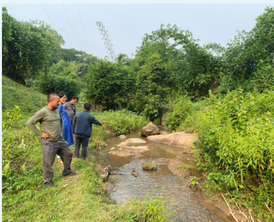
The Green Energy team convened a meeting with the Block Development Officer (BDO) of Dadengre in the West Garo Hills district. The primary objective of the meeting was to discuss the progress and status of the ongoing project focused on decentralised green energy development project in the district and a site verification was conducted simultaneously at Samanda village.