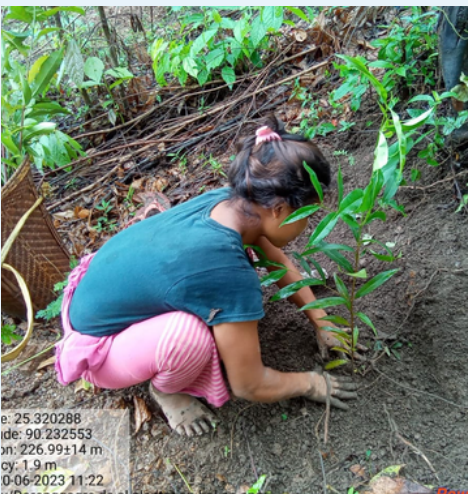
Plantation at Daranggagre Village, Dalu Block, WGH