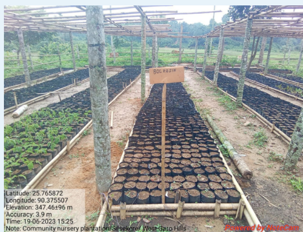
Silsekgre Community Nursery under Rongram Block, WGH