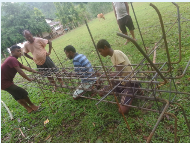
Community Hall Construction at Rongpetchi and Ajasiram, Resubelpara Block, NGH