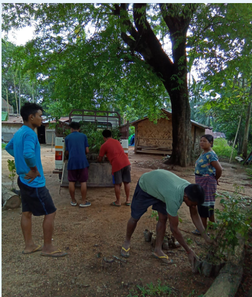
Lifting of saplings for Chorepahar Village, Resubelpara Block, NGH