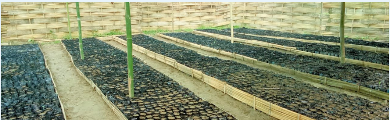
Community Nursery of Gngengkolsi Songgital Village of Gasuapara Block, SGH.