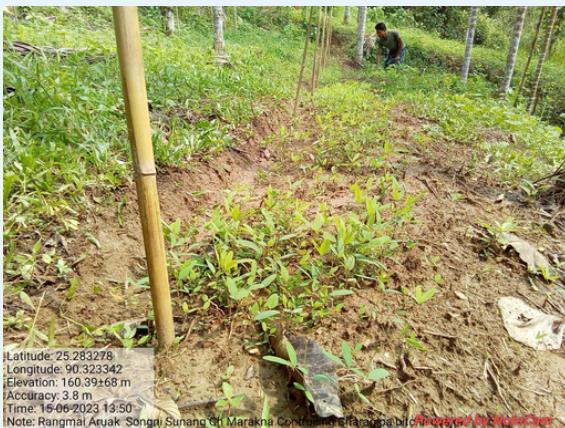
Salt Farm of Sunang Ch Marak of Rangmai Aruak village, Gasuapara Block, SGH.