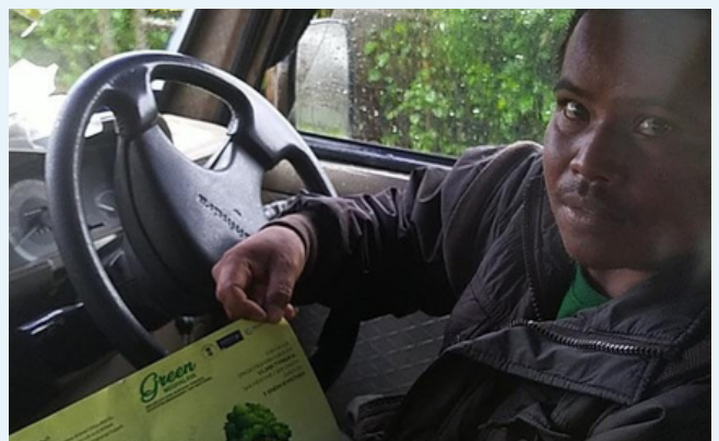
Sordar of Mawrah village