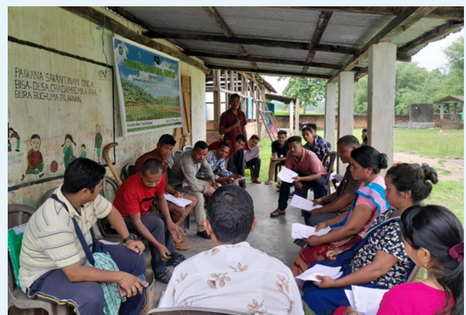
Natural Farming Training for batch 1 Villages under Tikrikilla Block, WGH