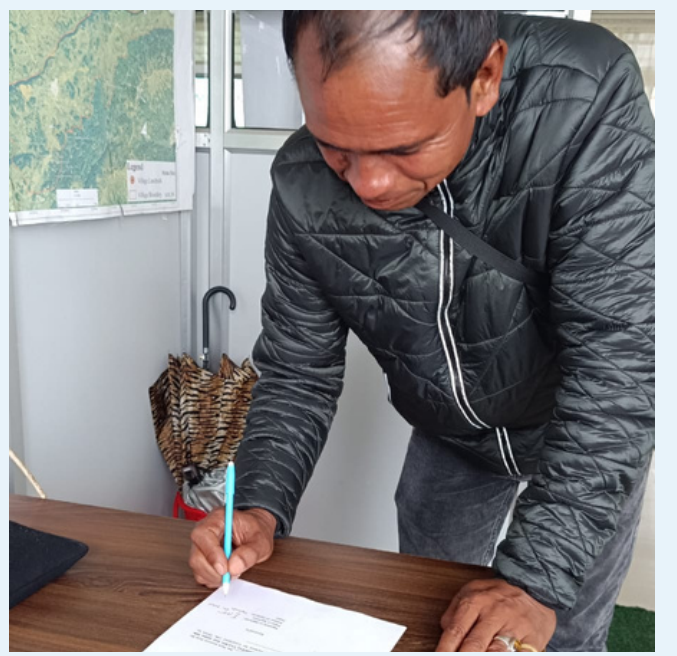
Collected MOU from Khliehriat