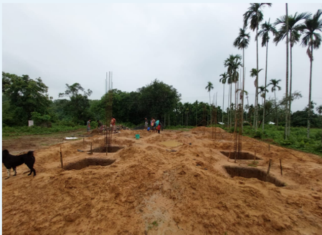
Rangdapara Village, Dalu Block, WGH