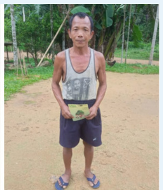
Community members : Agronggre village