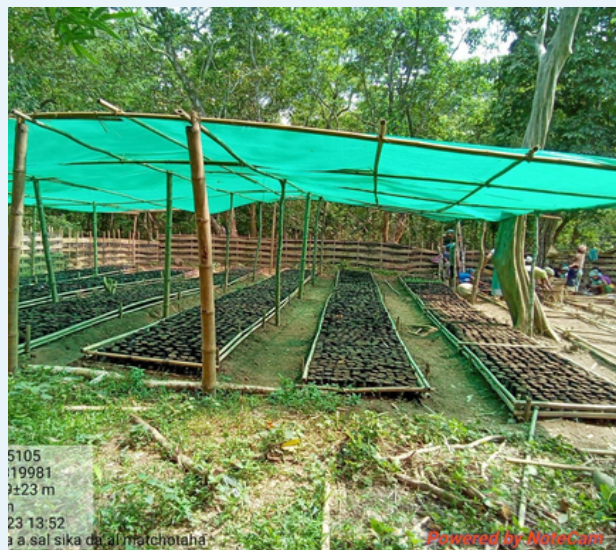
Community Nursery of Karawengre VPIC, Gasuapara Block, SGH