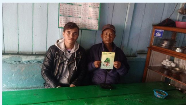
Forest owner at Mawlngot, Mawkynew block