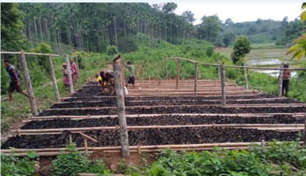
Community Nursery shed construction completed by Gindopara VPIC, Rongram Block, WGH

433 Villages under MegLIFE Project have elected to set up community nurseries. Following the completion of preparation of nursery mother beds where seeds will be sown, communities are working on filling Polybags with potting material; a mix of soil, sand and compost (in prescribed proportion). Polybags are for transplanting the small seedlings from mother bed into a container for transportation to the planting site.