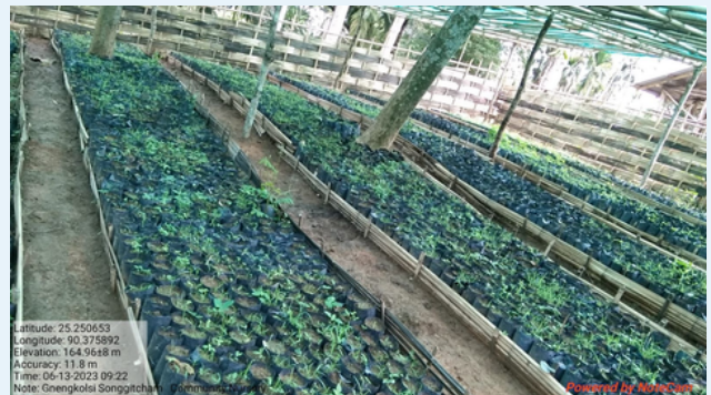
Community Nursery of Gngengkolsi Songgitcham Village, Gasuapara Block, SGH