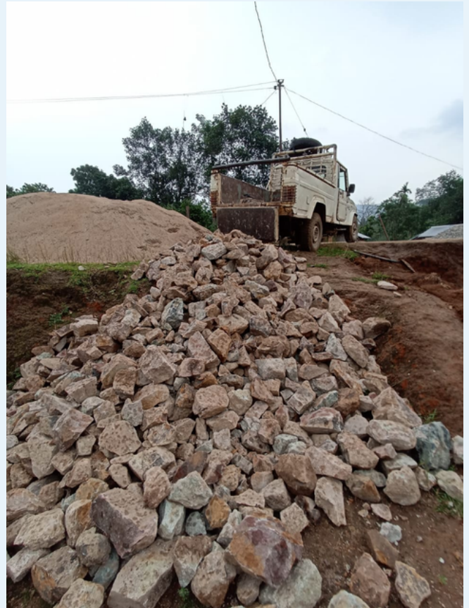
Materials collection for Community Hall construction Goeragre, Rongram Block, WGH.