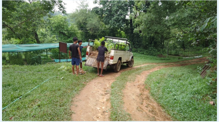
Lifting of seedlings for Kopogre, Balikingre and Sisogre Villages, Gambegre Block, WGH