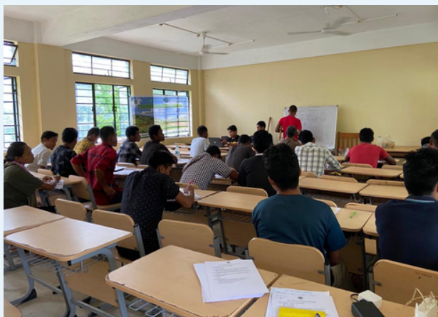
Natural Farming training at Gasuapara Block, SGH.