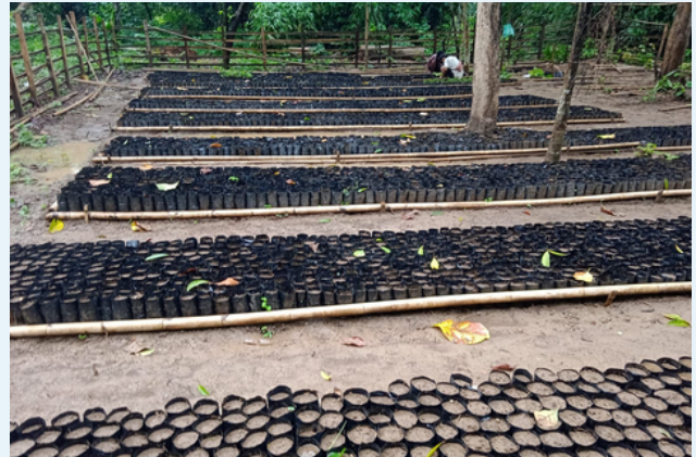
Community Nursery of Watregre Village Gasuapara Block, SGH