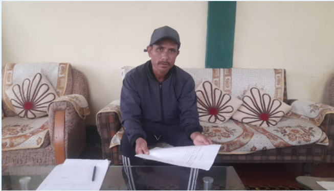
Collected MOU from Shella Block