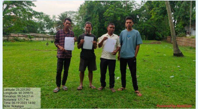
Collected MOU from Nokatgre