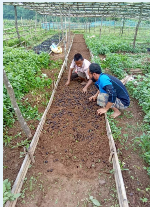
Daljagre VPIC under Rongram sowed seeds of bombax ceiba, artocarpus heterophyllus, mangiferrea indica, pongamea pinata and syzygium comini in both poly bags and mother bed on 20/06/23.