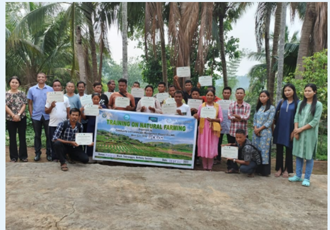
Natural Farming Training for Rongram Block Farmers, WGH Tebrongre ended with the Certificate distribution by the DPM MBDA MegLIFE/ Basin WGH.