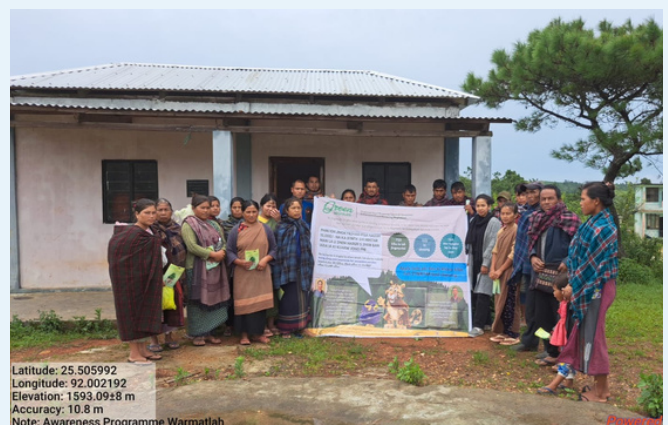
Latitude: 25.505992 Longitude: 92.002192 Elevation: 1593.09±8 m Accuracy: 10.8 m Note: Awareness Programme Warmatlah