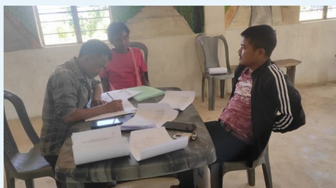
Headman and Secretary of Mawkliaw village