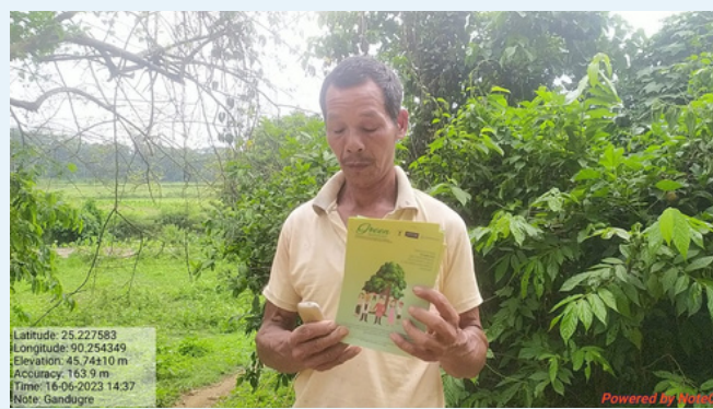
Headman of Gandugre village