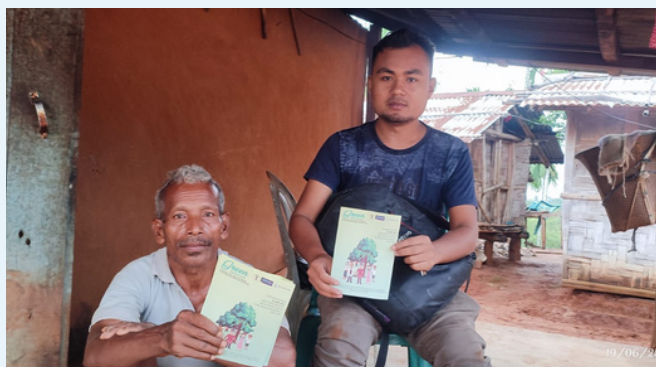
Headman of Rongsepgre village