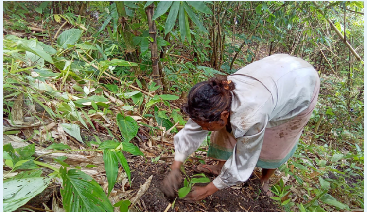
Plantation at Mejolgre Nokat under Dambo-Rongjeng Block, EGH