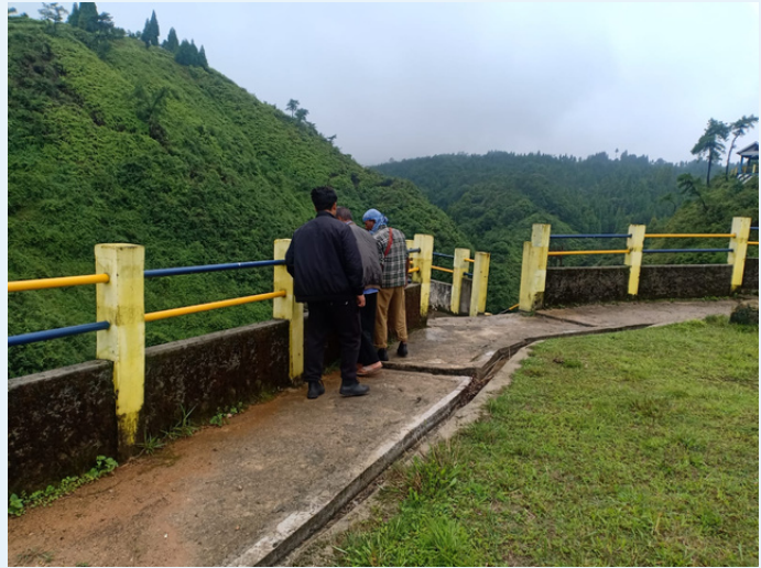
Site inspection carried out by the Green Energy team under Decentralised Green Energy Development Project at Lumthangding, Laitkroh-Khatarshnong block, East Khasi Hills district.