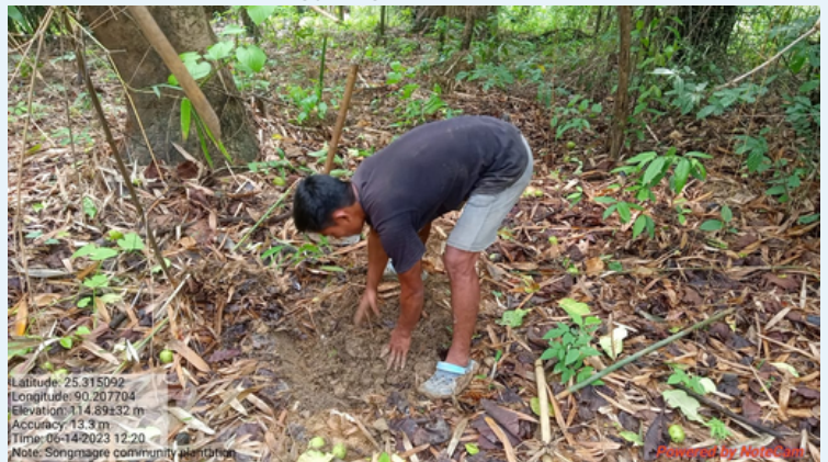
Plantation at Songmagre Village, Dalu Block, WGH