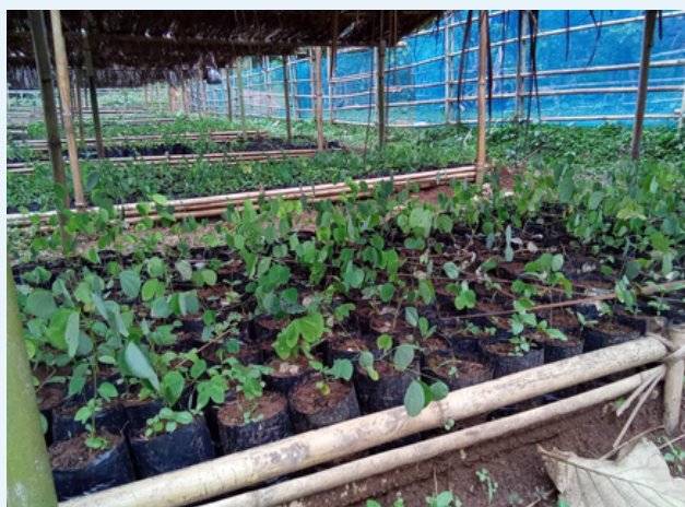
Balupara VPICcommunity Nursery, Rongram Block, WGH