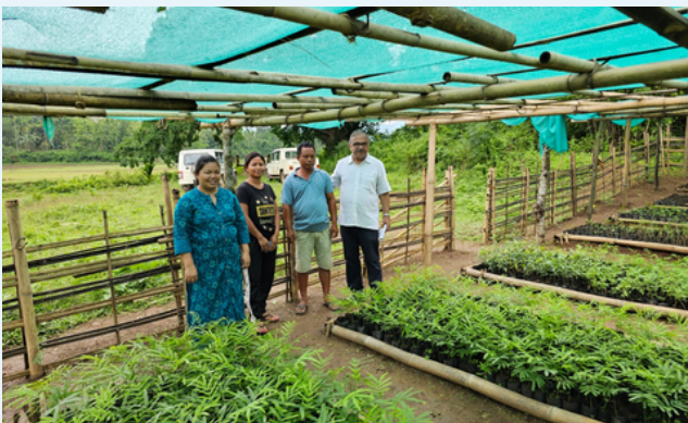
Visited to Ajasiram and Rongpetchi, Resubelpara, NGH, for assessment of ongoing activity along with by PMC