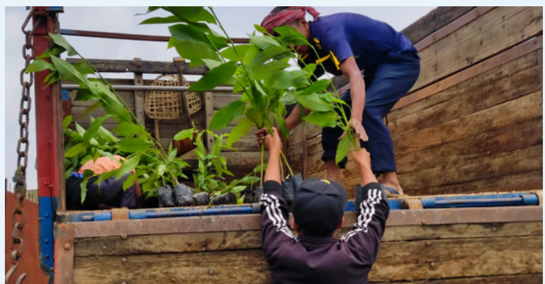
3500 saplings lifted today by Mawdulop VPIC, Mawkynrew, EKH