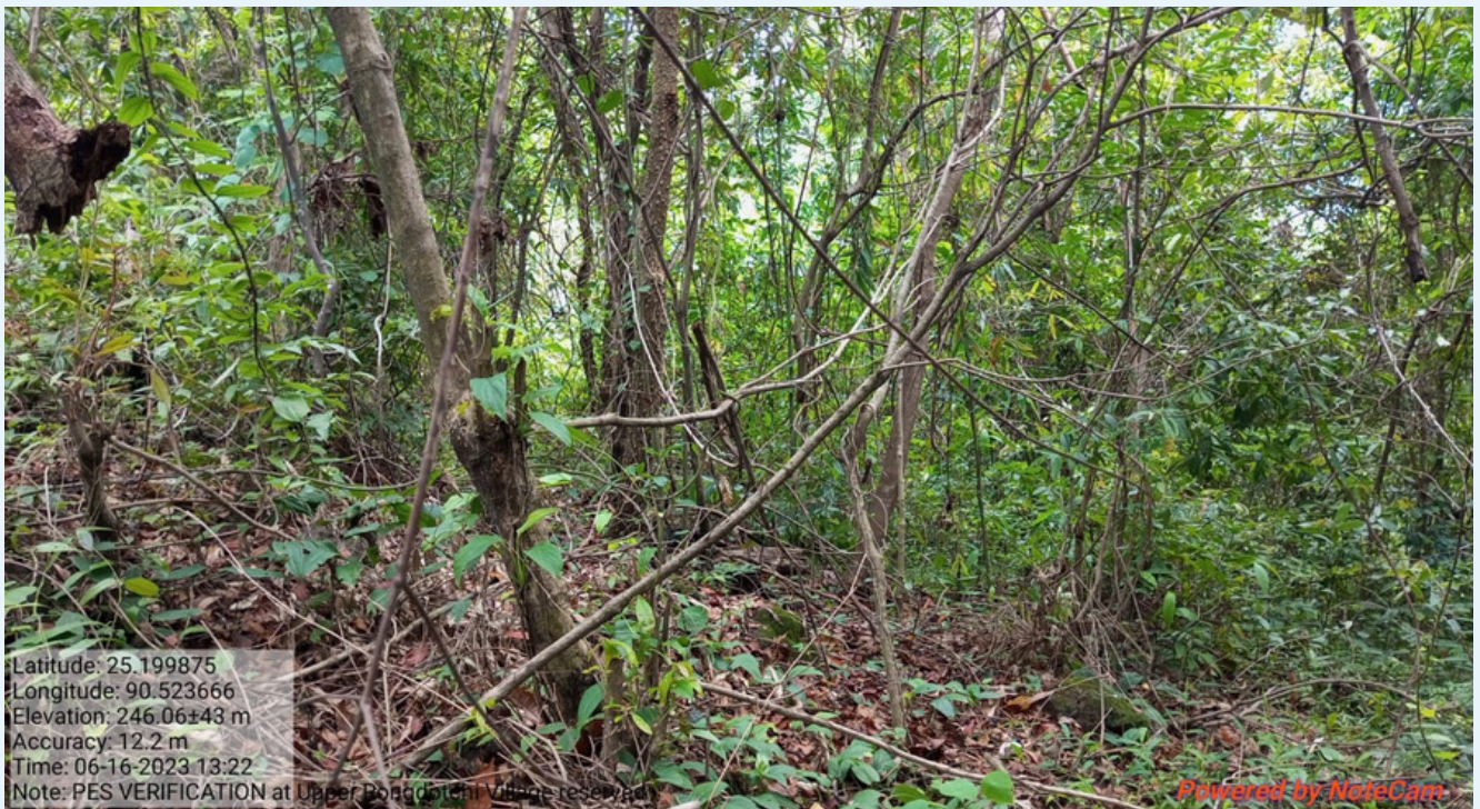
PES verification at Upper Rongdotchi Village Reserve, under Baghmara Block by VCF Clement Sangma.