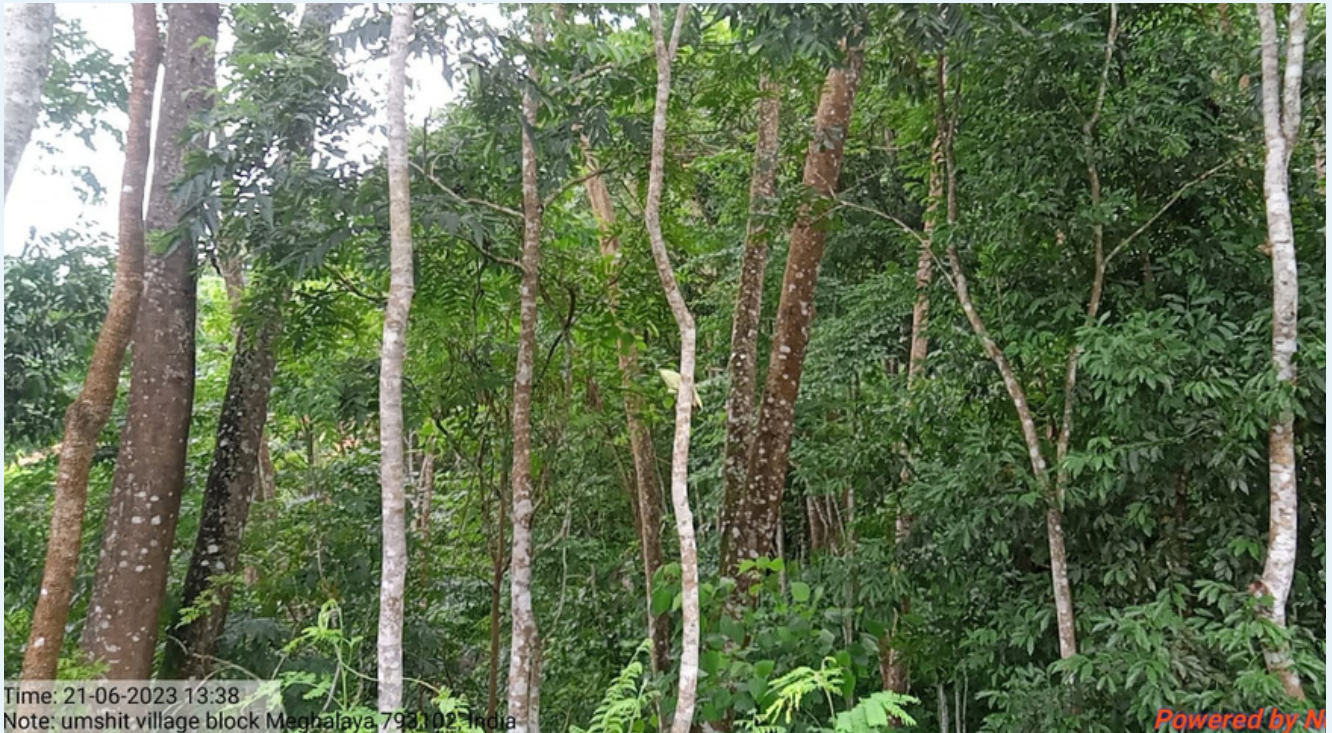
PES verification at Umshit village