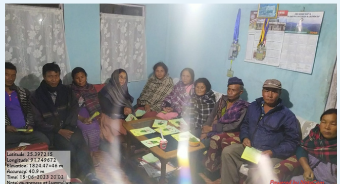
Latitude: 25.397215 Longitude: 91.749672 Elevation: 1824.47±46 m Accuracy: 40.9 m Time: 15-06-2023 20:02 Note: awareness at Lumpyllun