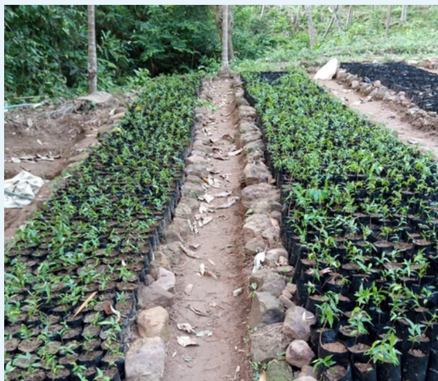
Community Nursery, Wakskogre Village, Gasuapara Block, SGH