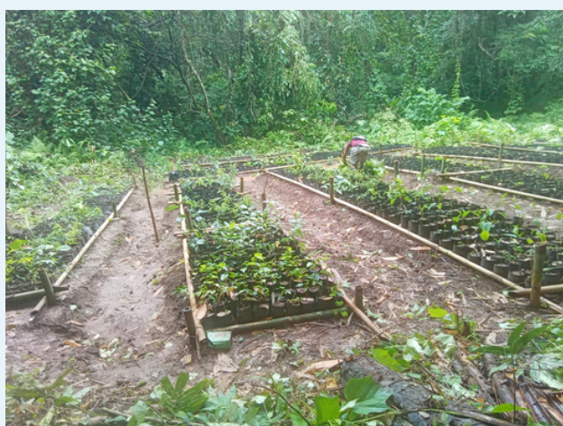
Thapa Dajonggre Community Nursery, Resubelpara Block, NGH