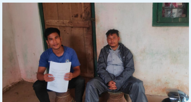
Collected MOU from Umsning block