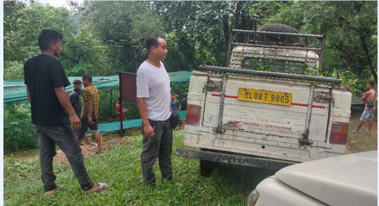
6928 seedlings lifted from Chokpot Block on 13-06-2023 for Rangmai Aruak VPIC, Gasuapara Block, SGH