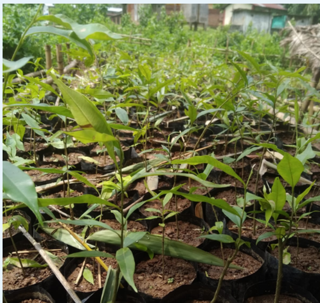
Anogre raising 1500 agarwood saplings, Rongram Block, WGH.