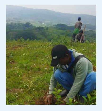
AR model: Plantation at Daistong and Saipung villages