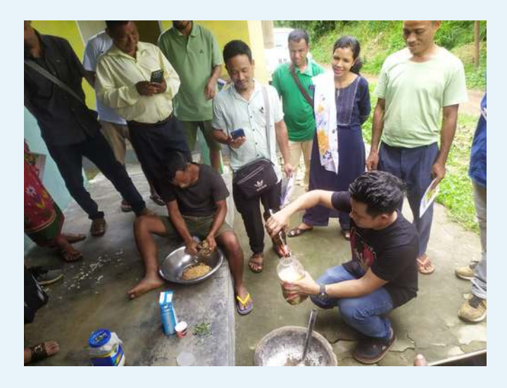
Natural Farming for Dambo-Rongjeng at Songsak Bajar. A total of 24 farmers from Batch 1 villages attended the training.

Organized by CLLMP at Bethany Society, the training programme on Natural Farming includes preparation of Lactic Acid Bacteria (LAB) OHH (Oriental Herbal Nutrients) FAA (Fish Amino Acid), FPJ (Fermented Fruit Juice) IMO (Indigenous Micro Organism) and Oyster Mushroom cultivation, Bokashi Poultry, Bokashi Piggery, Vermi Compost making, Sq feet metre garden etc. The farmers were given both theoretical & practical demonstration.