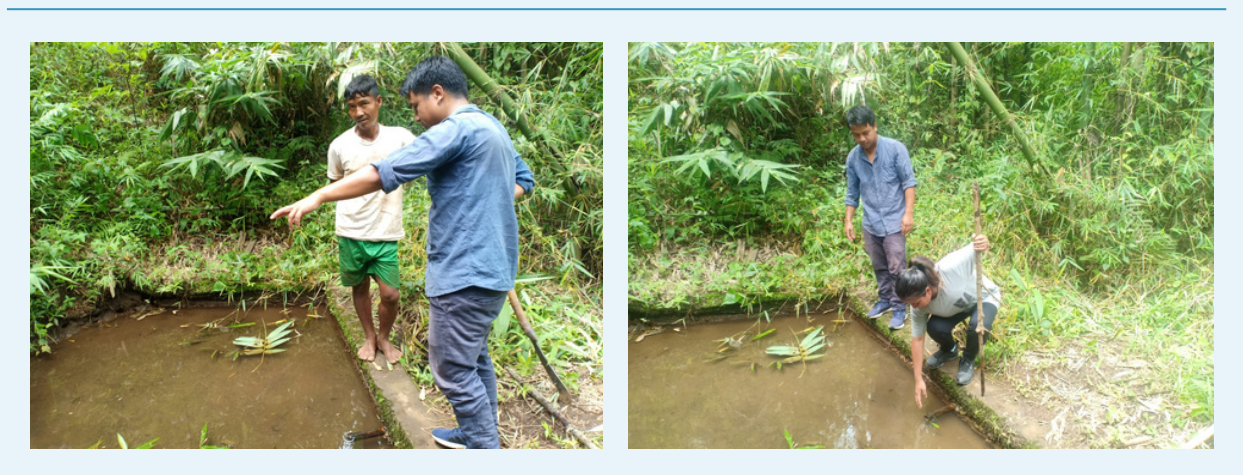
Site supervision for civil works at Ja-ir, Ri bhoi district.

Site Electrification conducted by the Green Energy team at Cham Cham Village, Khliehriat block, East Jaintia Hills for the purpose of Eco-tourism lighting.