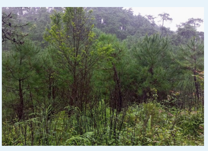
PES verification at Mawnai village