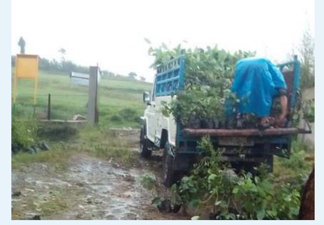
Lifting of 3000 saplings by Mawjatap VPIC

MegLIFE communities are hard at work to achieve the project's goal of covering 22,500 hectares of plantation. Site preparation and advance works are currently underway.