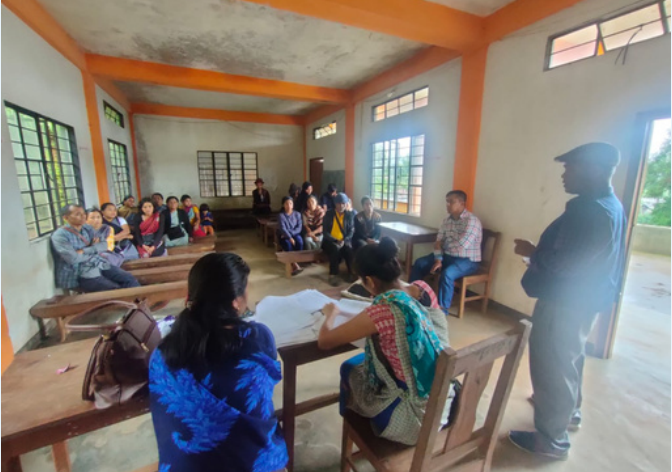
On 6th July 2023, the Inaugural General Meetings (IGMs) were conducted in Mawlyntriang village for Mawlyntriang IVCS and in Rikhen village for Rikhen IVCS under the Mairang block EWKH.