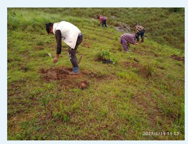
Kremlymbit, Pashang VPIC