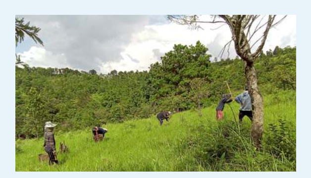
Plantation at Saipung Village, Saipung Block