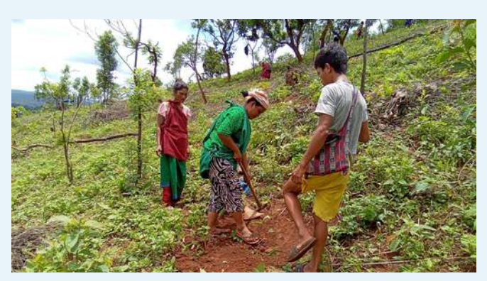
Plantation going on at Sanaro village