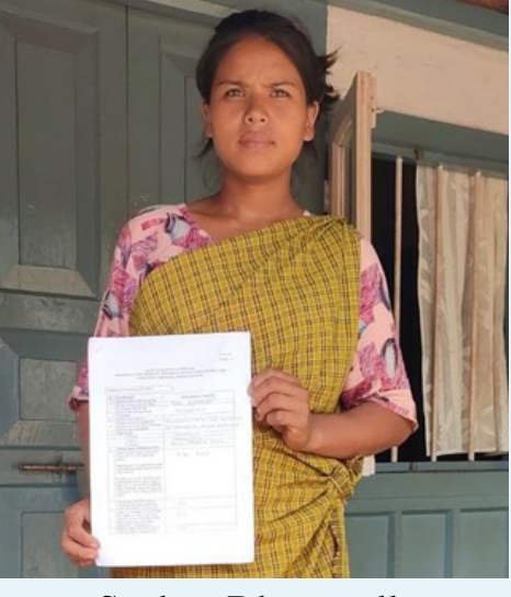
Suchen Dhana village