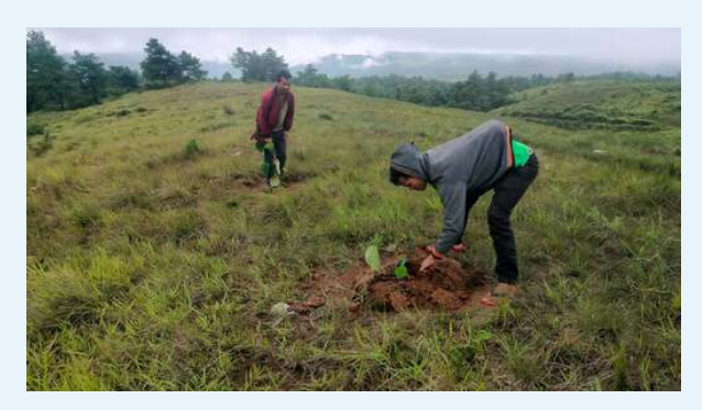
Plantation site at Mawsir village