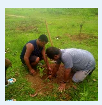
Planting at Ajasiram village