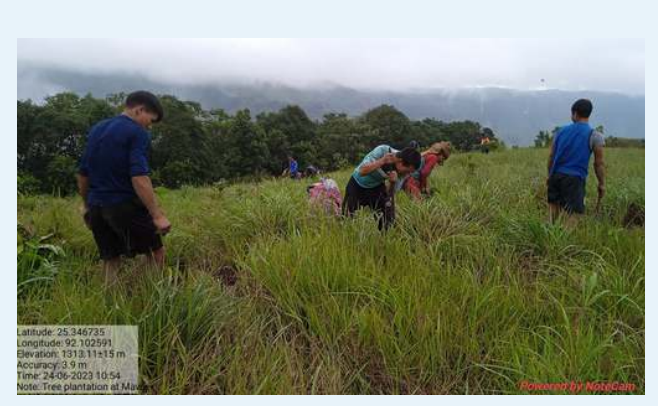
Plantation at Siangkhnai village,EKH