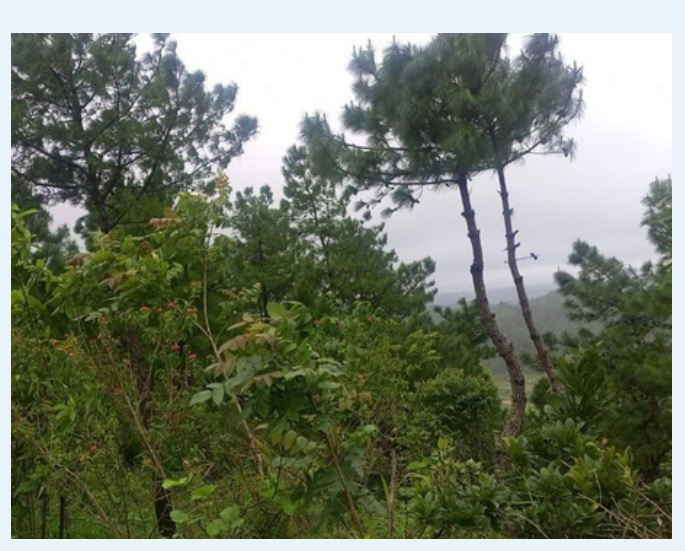
PES verification at Mawtharap village