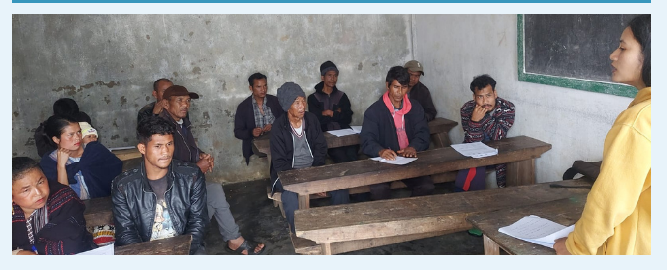
Had an Interaction with VPIC members about Aroma Mission in Pawphlang, Mawkyrwat SWKH.