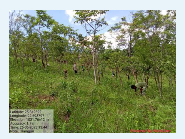
Plantation at Tlangpui village, Saipung Block