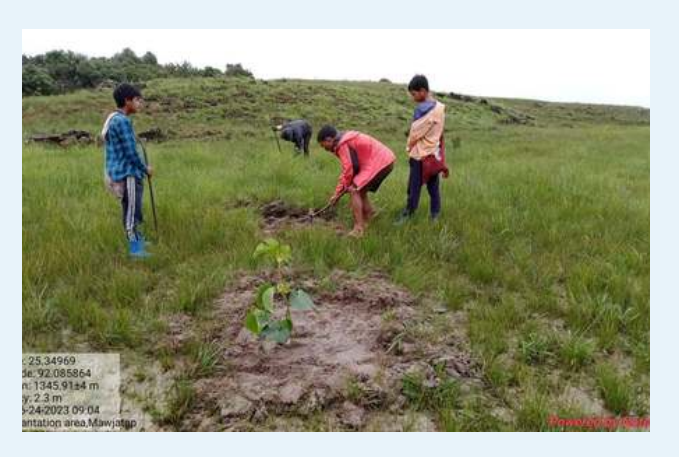
Plantation at Mawjatap village, EKH