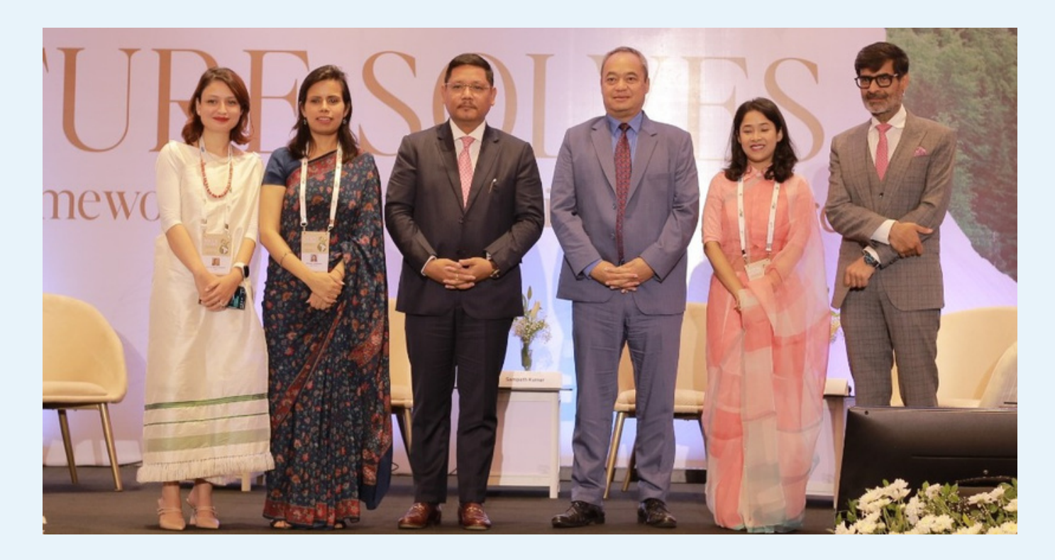
Bridging the Gap: Think Tanks and Policymakers Unite at the Think20 Conference

The Meghalaya Basin Management Agency, in collaboration with the Observer Research Foundation (ORF) as the Think20 (T20)under India's G20 Secretariat Presidency, successfully hosted the Think20 Conference titled "Nature Solves: A New Framework for Our Sustainable Future" in Shillong from July 5-7, 2023. The official engagement group of the G20, Think20 (T20) brought together think tanks and high-level experts to address policy issues relevant to the G20.