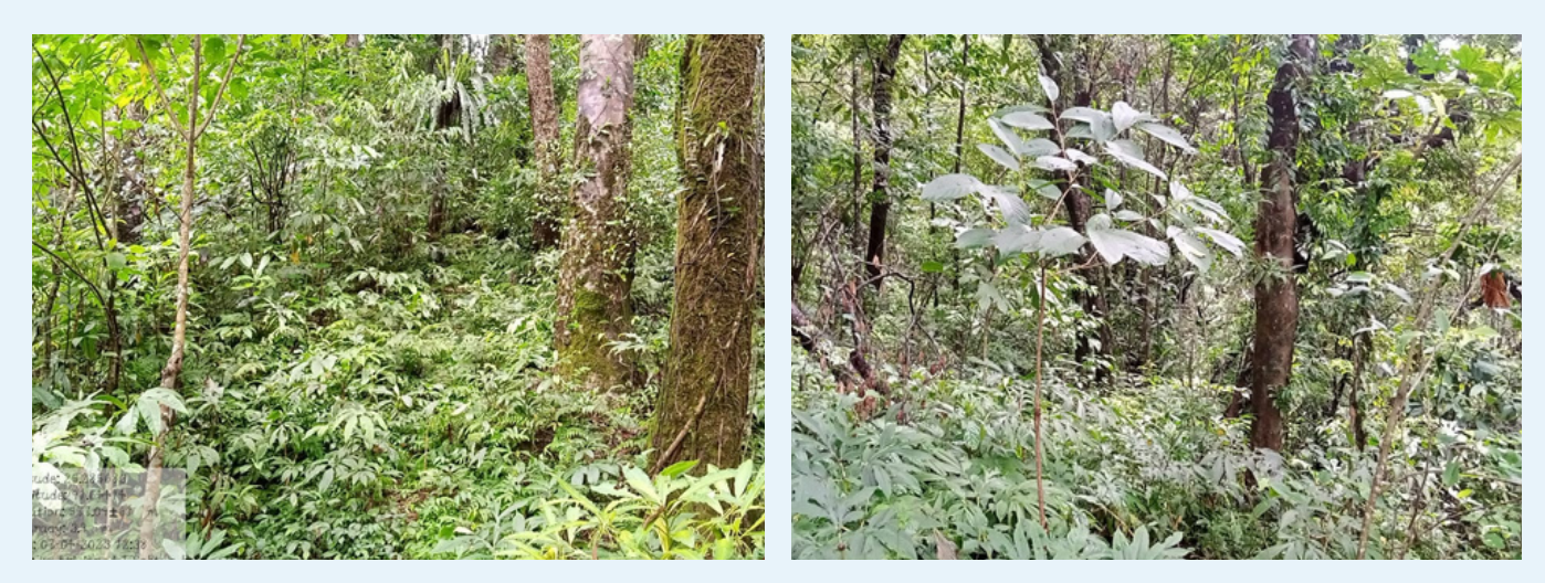
PES verification at Umblai village