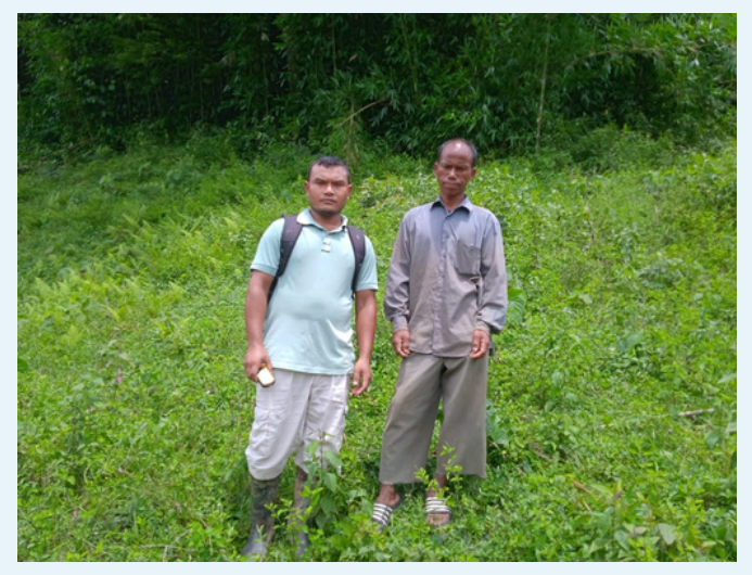
PES verification at Silsekgre Reserve forest