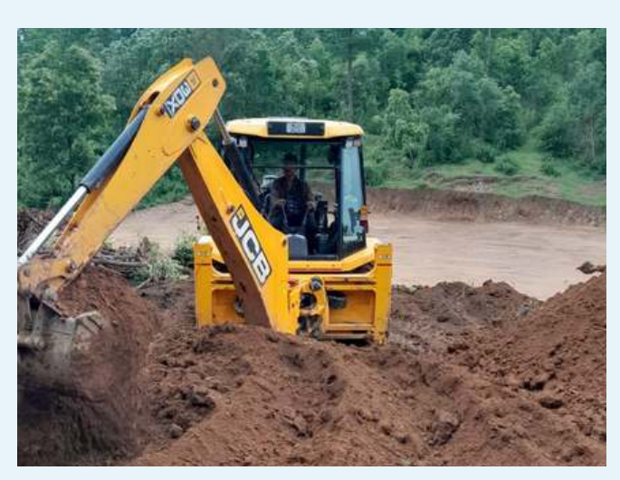
Progress of the construction of community hall at Pdieniadaw village

1st phase Community Hall Construction at Kerupara Village, Gambegre Block.