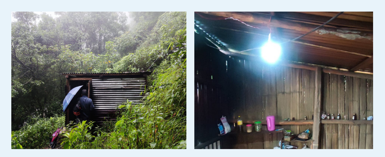
Site verification and electrification at Phottdei village,Mawkyrwat block, South West Khasi Hills District.