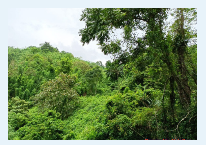
PES verification at Akarok village