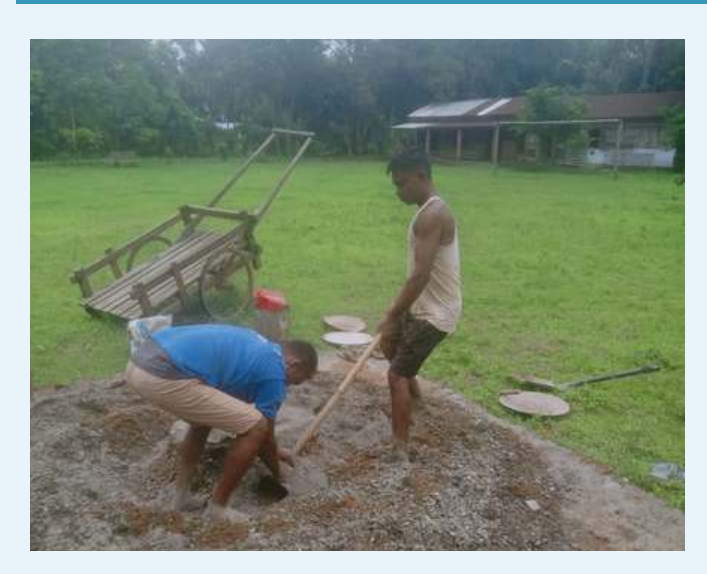
Rongpetchi Community Hall

The construction of 370 community halls has been sanctioned under EPA of MegLIFE. Initial phases of site preperation is underway.