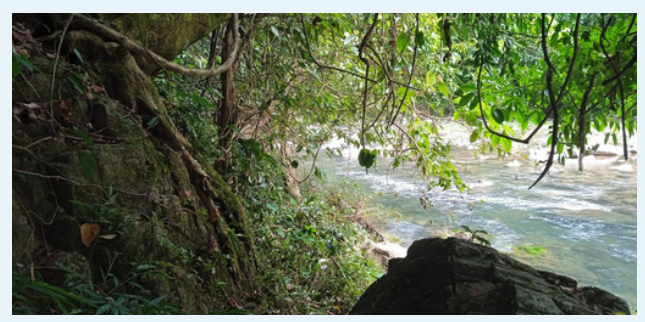
PES Verification at Reni Badimagre community Reserve ,SGH Chokpot