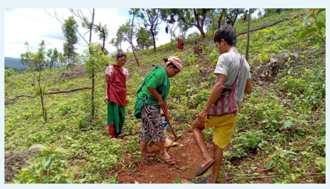
Plantation going on at Sanaro village. Male and female participate for a day