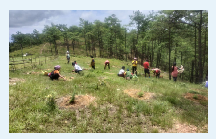
Plantation at Pomlahier village, EKH.