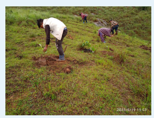
Kremlymbit, Pashang VPIC