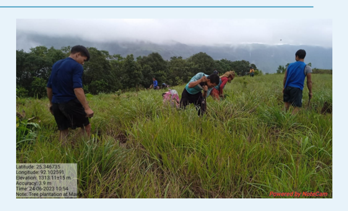
Plantation at Siangkhnai village,EKH