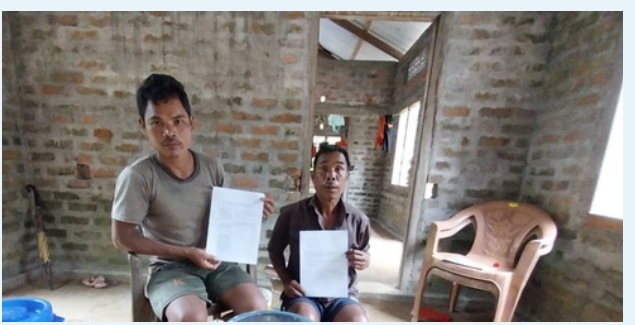
Collected MOU at Damit Aga Matchakolhre village