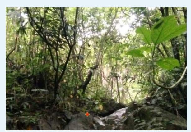
PES verification at Rangweng village