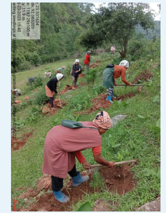
Plantation at kut village, EKH