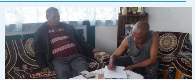
Headman and secretary of Mawkisyiem dorbar shnong