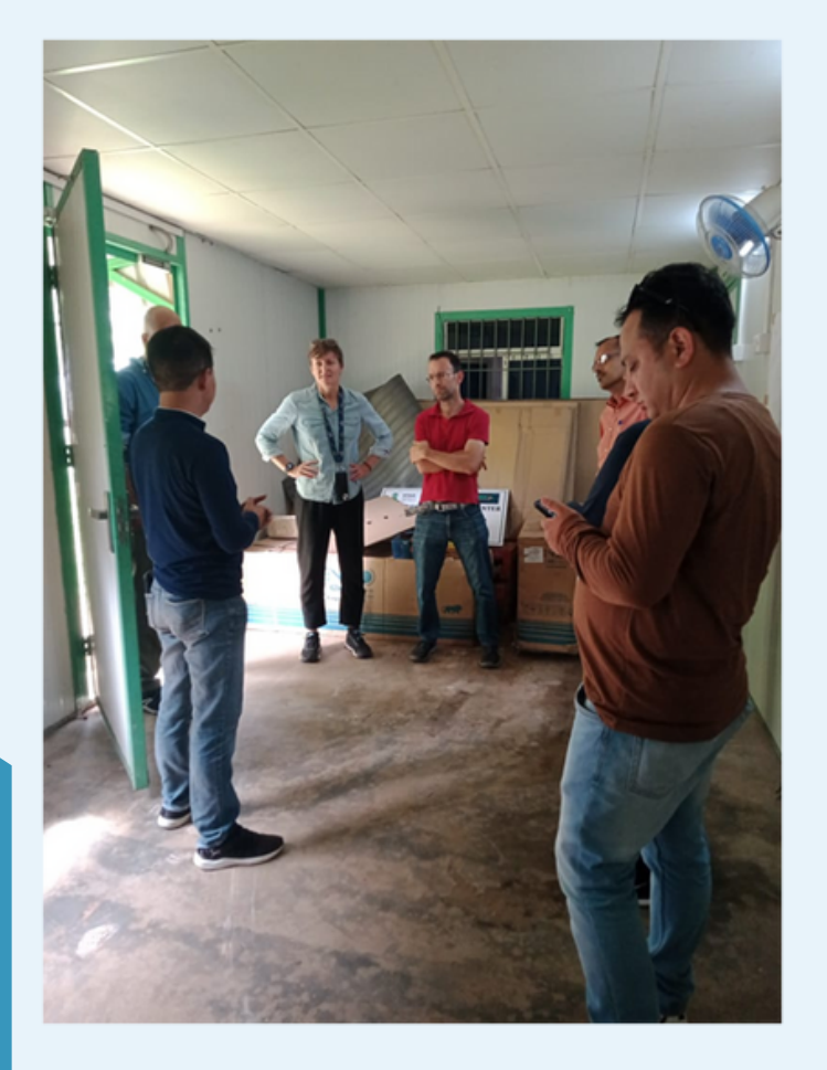
Officials from the Asian Development Bank (ADB) conducted a field visit to Umwang Pyllun IVCS Ltd., Ri Bhoi District.