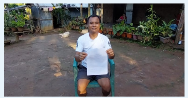
Collected MOU at Rompara village