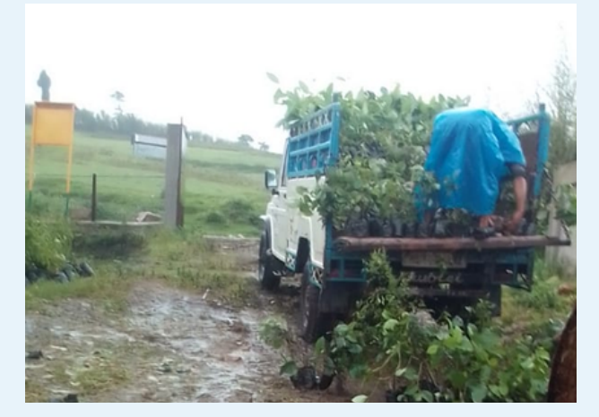
Lifting of 3000 saplings today by Mawjatap VPIC

MegLIFE communities are hard at work to achieve the project's goal of covering 22,500 hectares of plantation. Site preparation and advance works are currently underway.