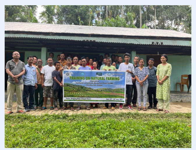
Natural Farming completed at Songsak Bajar for Dambo-Rongjeng.The farmers show interested in different technique of Natural farming.