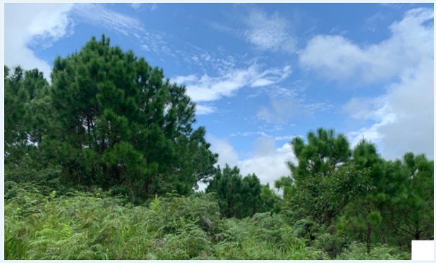
PES verification at Myrjai village.