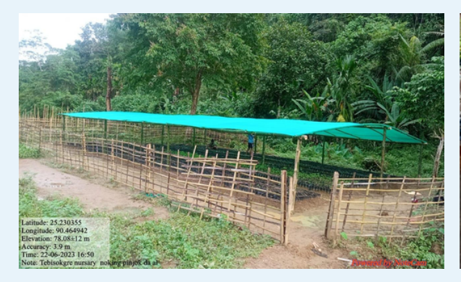
Tebisokgre village completed repairing their damaged nursery due to wind

433 Villages under MegLIFE Project have elected to set up community nurseries. Following the completion of preparation of nursery mother beds where seeds will be sown, communities are working on filling Polybags with potting material; a mix of soil, sand and compost (in prescribed proportion). Polybags are for transplanting the small seedlings from mother bed into a container for transportation to the planting site.