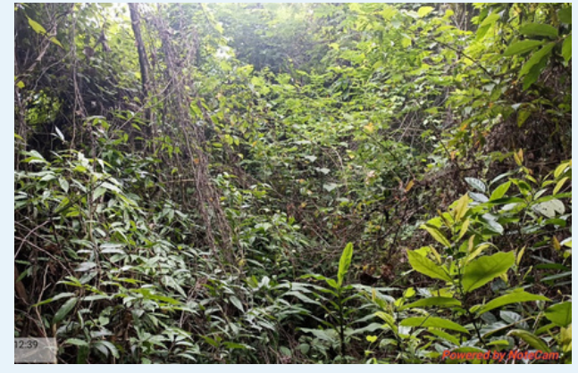
PES verification at Amokgre village.