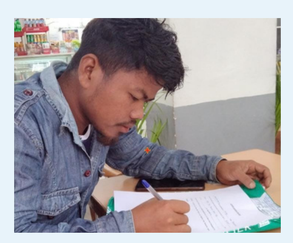
Collected MOU from the beneficiary of Pomblang village