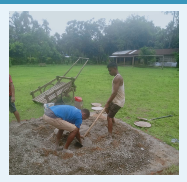
Rongpetchi Community Hall

The construction of 370 community halls has been sanctioned under EPA of MegLIFE. Initial phases of site preperation is underway.