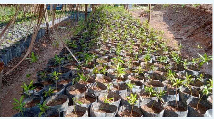
Nursery at Mawsir Village