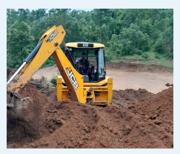
Progress of the community hall at Pdieniadaw village, Thadlaskein Block

1st phase Community Hall Construction at Kerupara Village, Gambegre Block.