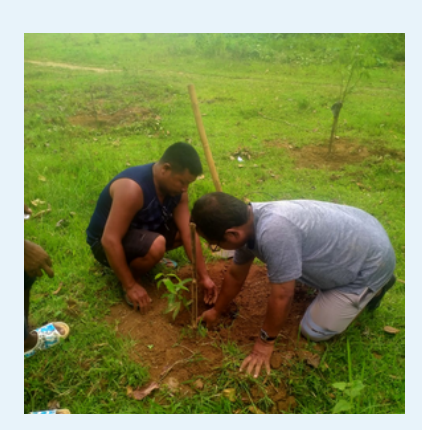
Planting at Ajasiram village started but halted due to heavy rain.