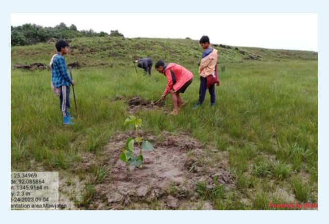
Plantation at Mawjatap village,EKH