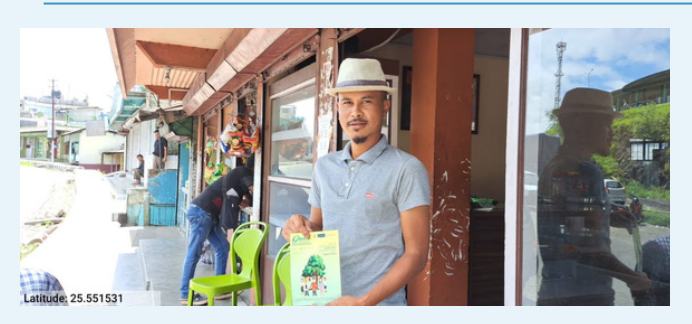
Rangbah dong Mission of Mawryngkneng village.