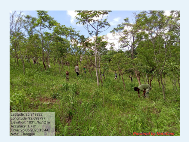
Plantation at Tlangpui village, Saipung Block