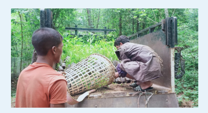
Lifting of tree saplings by Siangkhnai VPIC under Mawkynrew Block. It was lifted from Silviculture Permanent Nursery located at Sangmein Upper Shillong.