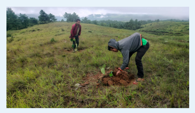
plantation site at Mawsir village