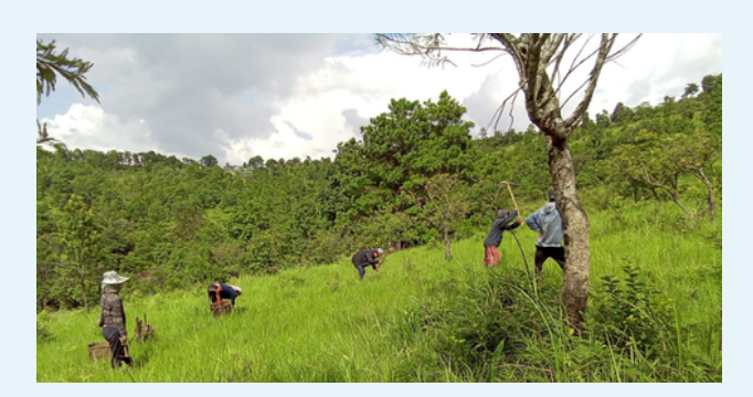
Plantation at Saipung Village,Saipung Block