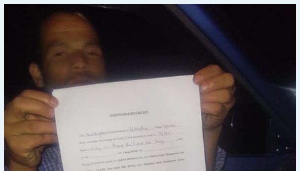
Collected MOU at Laitshuthim and Nongblai village