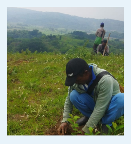
AR model: Plantation at Daistong and Saipung villages