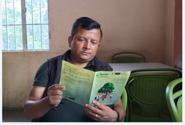
Headman of Mawryngkneng village.