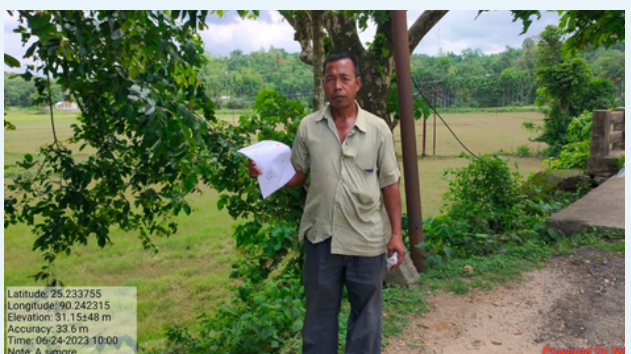
Collected MOU at Asimgre Nokma village