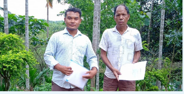
Collected MOU at Chigitchakgre village