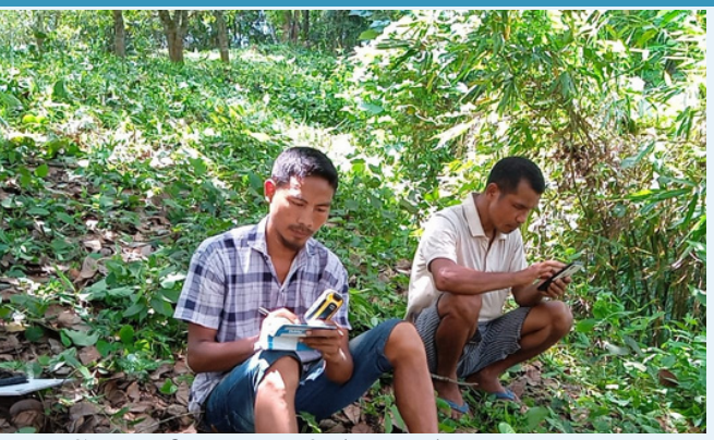
PES verification & boundary mapping at Ritekpara Community Forest Reserve.