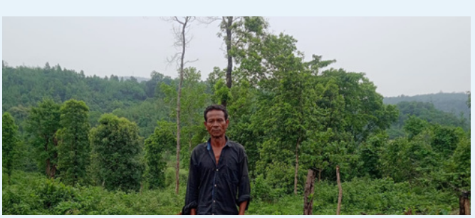
Forest owner of Mongalgre village