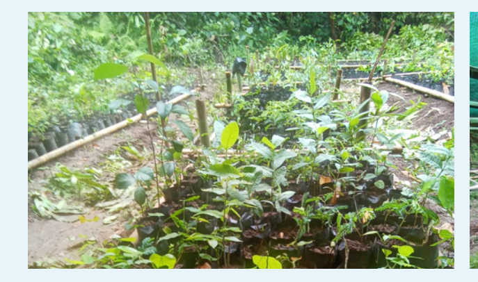
Thapa Dajonggre Community Nursery: Resubelpara Block

Germination of Terminalia arjuna, Miktongjeng