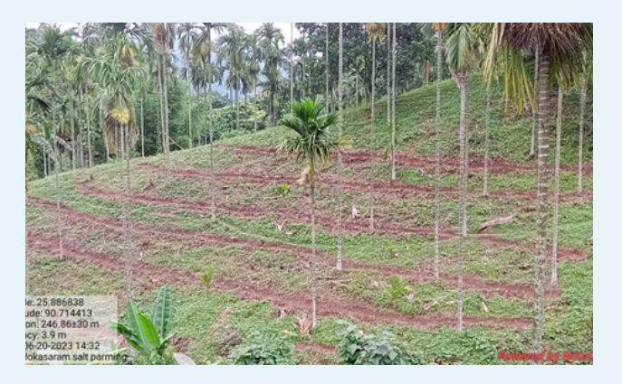
New SALT farm from Dokasaram village: Resubelpara Block