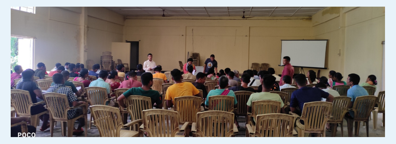
VPIC Meet at Zikzak Block SWGH