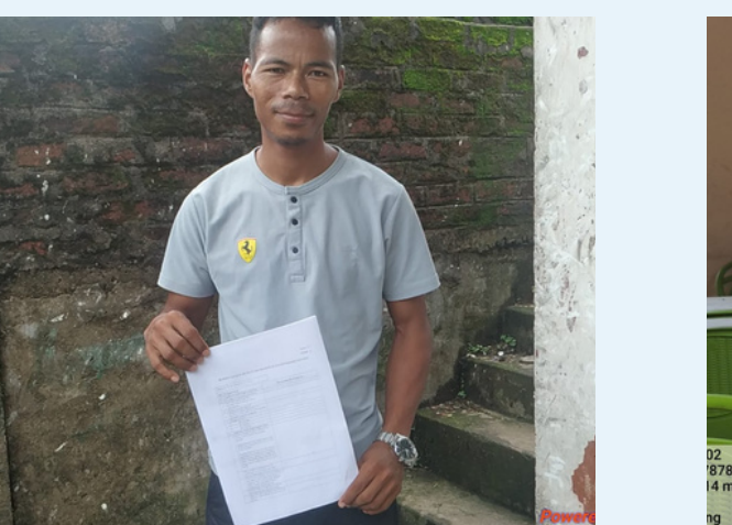
Collected MOU at Nongjaiaw village.