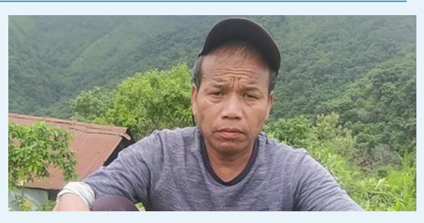
Forest owner of Mawmang village