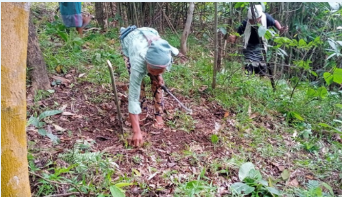
Weeding in progress at Rangdapara village.