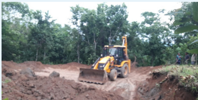
Excavation and site levelling in Rangapara village.