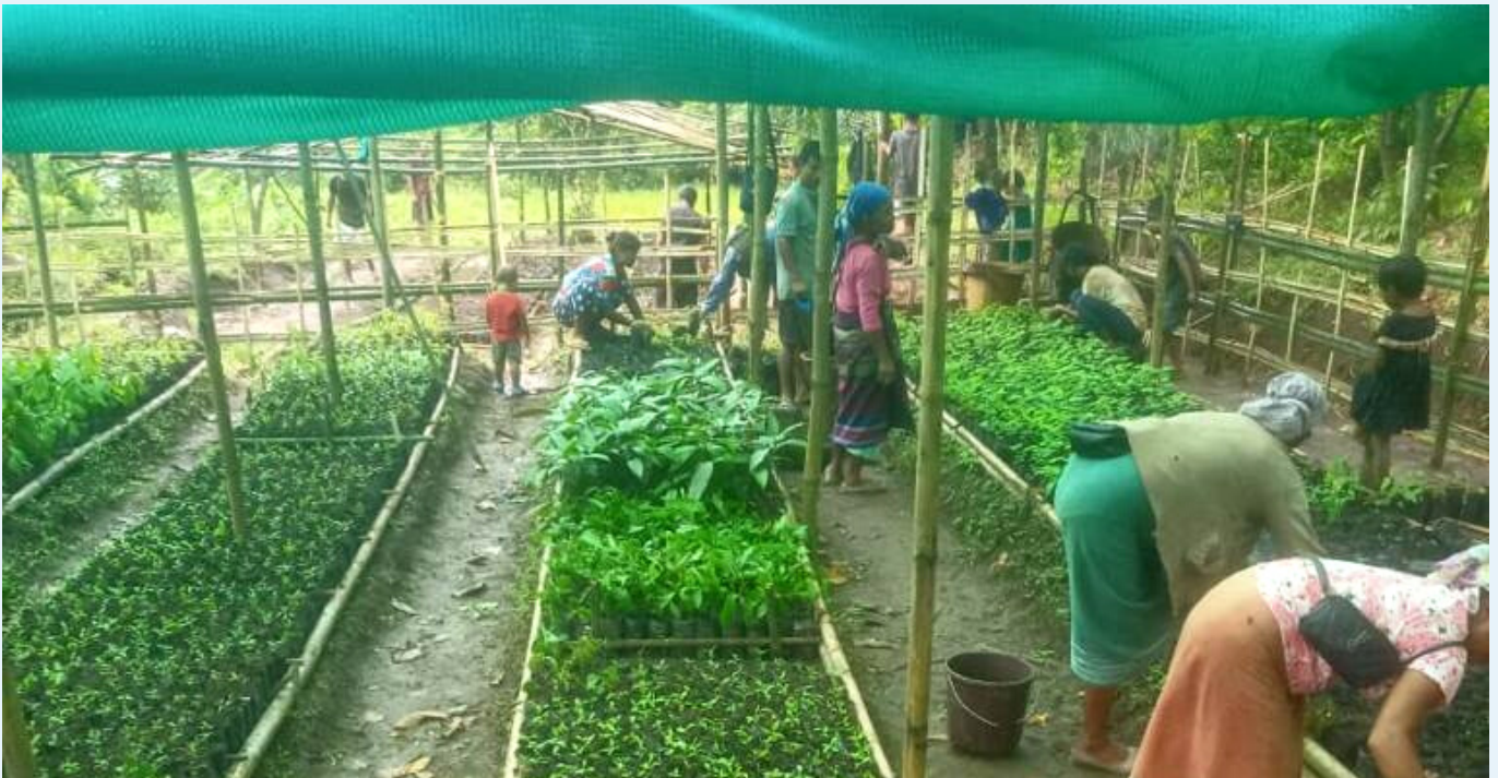
Ring weeding at Darang Akepgittim village.