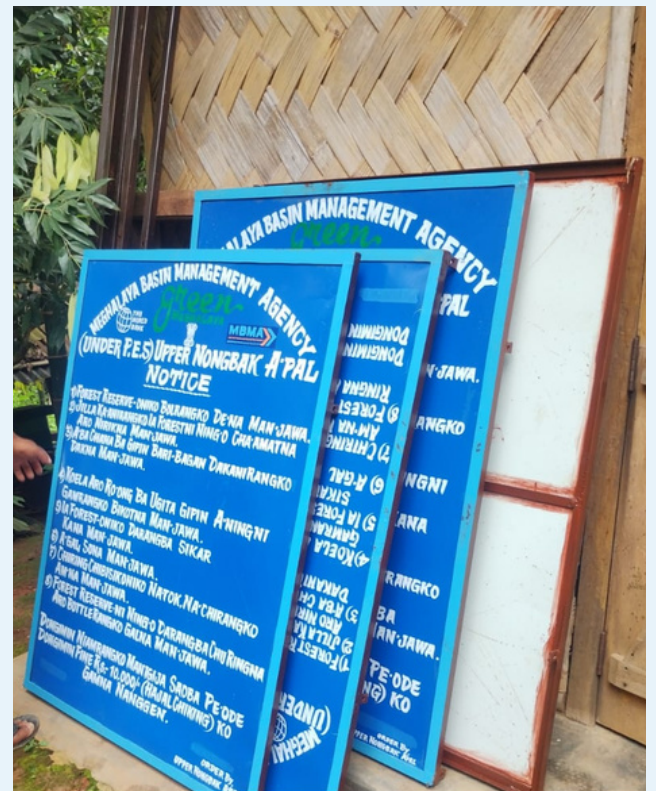
Setting up of signboard at Nongbak Apal Community Reserve