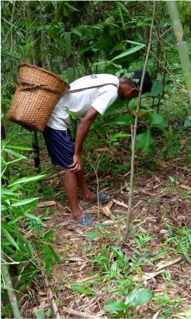
Ring Weeding at Songmagre village.