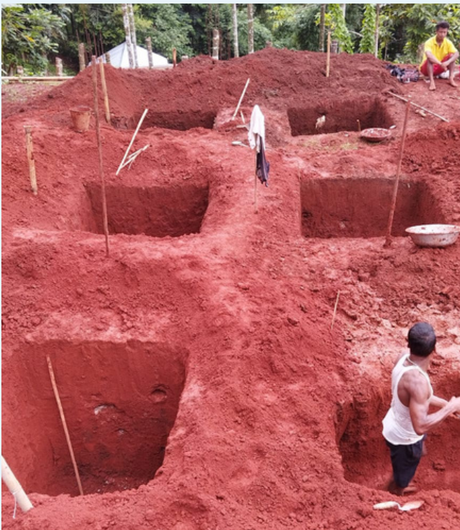
Umden Khasi village.