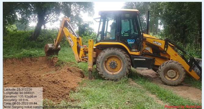
Site levelling and excavation in Sanjeng Nokat village.