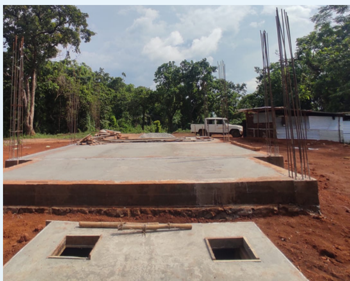
Simseng Balkol village.