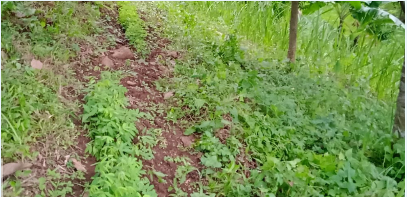
Mejolgri Nokat village.