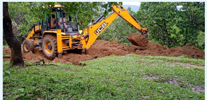
Excavation and site levelling in Dopanangre village.