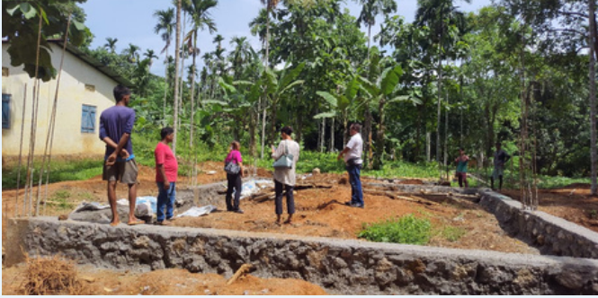
Thapa Darenchi village.