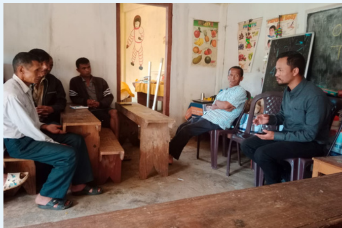
An Awareness Programme was conducted by the Bio-Resource team on promotion and cultivation of Medicinal and Aromatic plants on 5th August 2023 at Mawkyrdang, Mairang Block, EWKH.