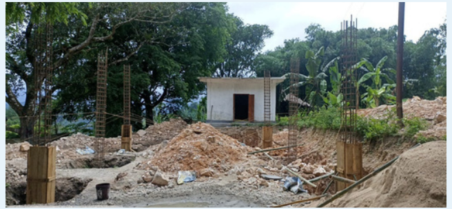
Rongkandi Dengjama village.