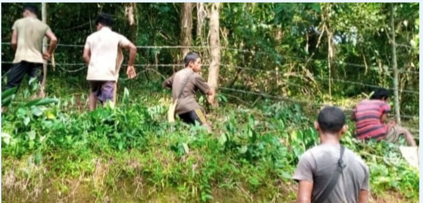
Fencing at Renchagre village.