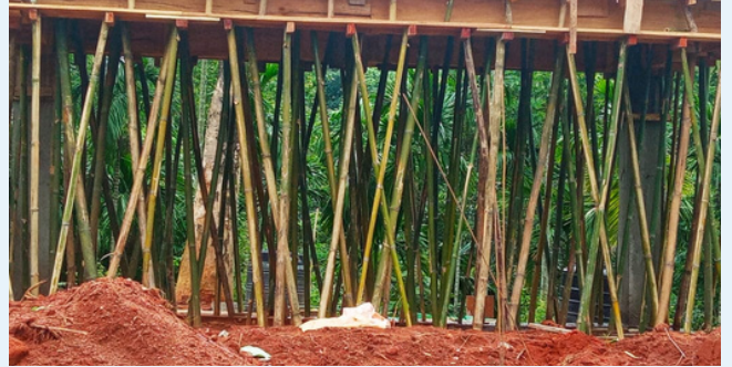
Nanil Apal village.