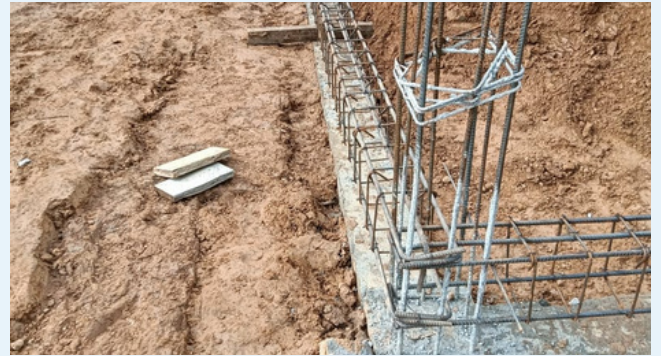
Dokongsi C village.