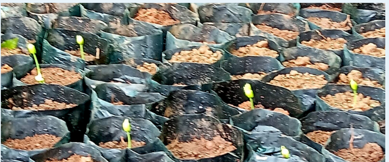
Seeds sourced from Nanil Apal village's extension nursery are currently in the germination process.