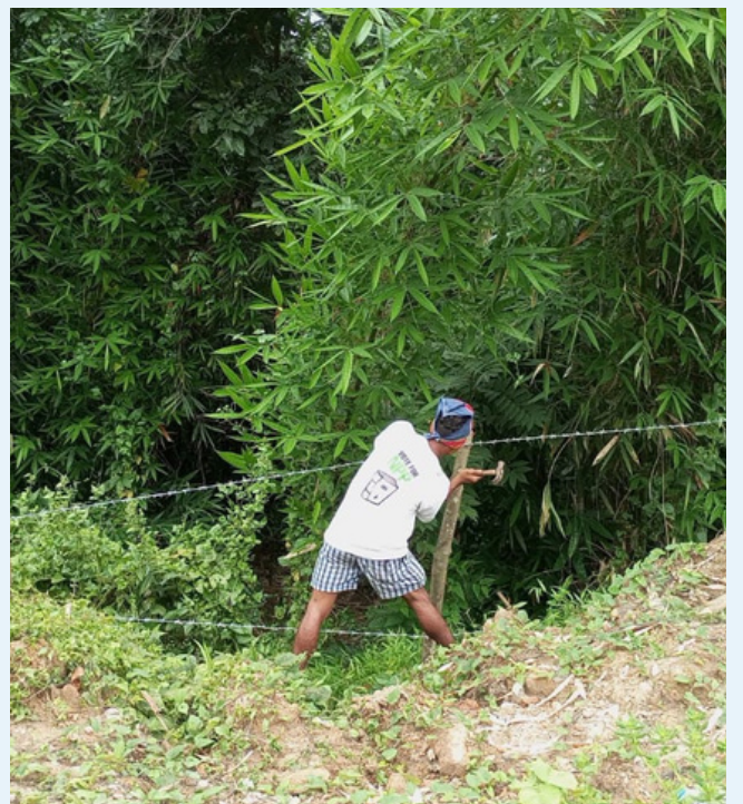
Fencing at Songmagre village.