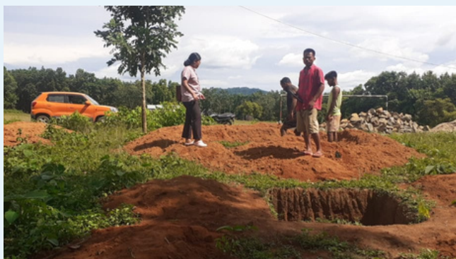
Lower Khongrapara village.