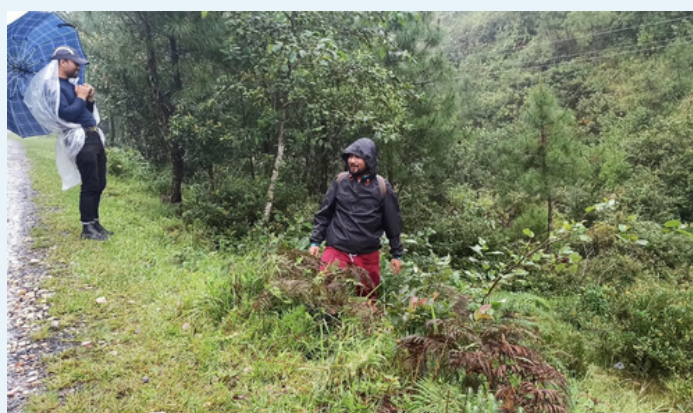
A field visit was conducted by the Bio-Resource team to Wahstew, Steplakrai, Synrangsohnoh, and Mawbeh located at East Khasi Hills district, Khadarshnong Laitkhroh block, in order to study the population of wintergreen and mapping areas for cultivating Medicinal and Aromatic plants.