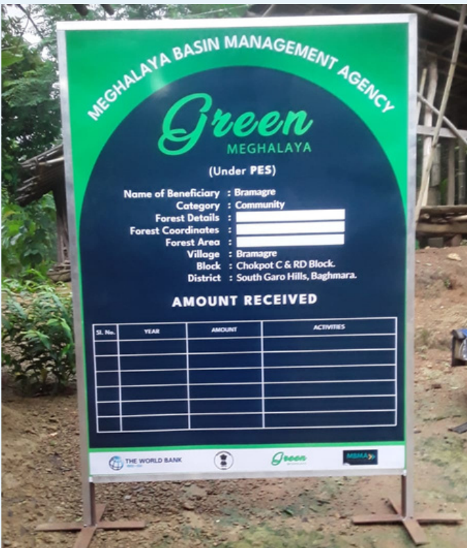
Setting up of signboard at Bramagre Community Reserve