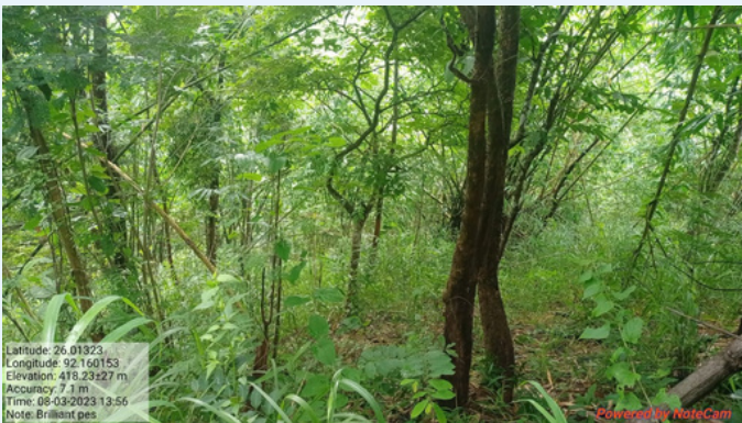
PES verification at Umsning

A visit was conducted to the Rem Megapgre forest reserve to assess the progress of designated tasks, and the Village Community Forests (VCFs) also undertook Forest Management Plan (FMP) activities during the visit.