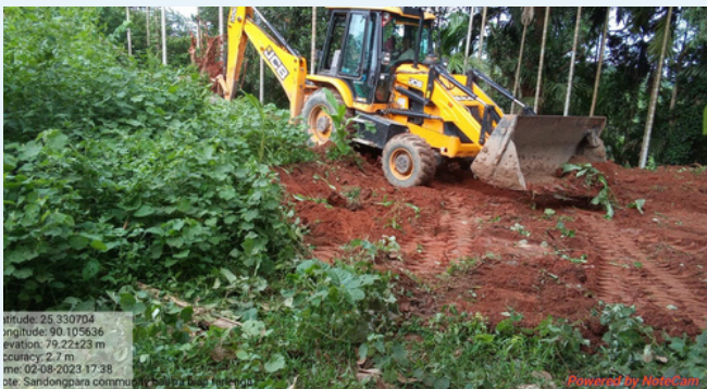
Excavation and site levelling in Sandongpara village.