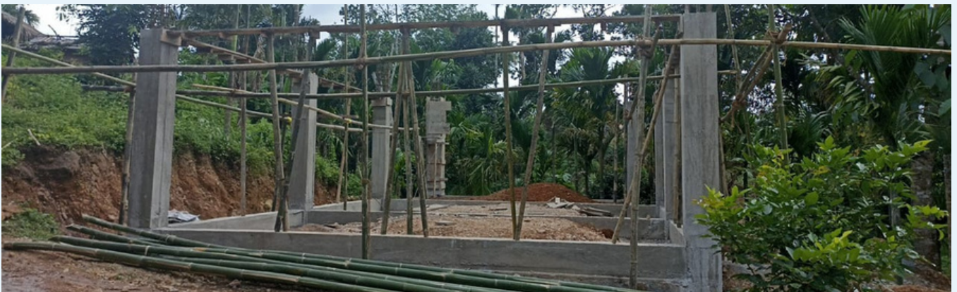
Rongkandi songgital village.