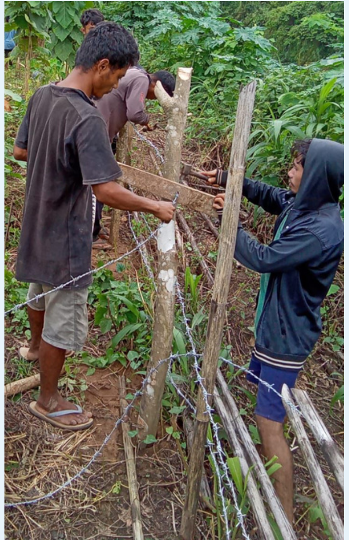
Fencing at Kopogre village.