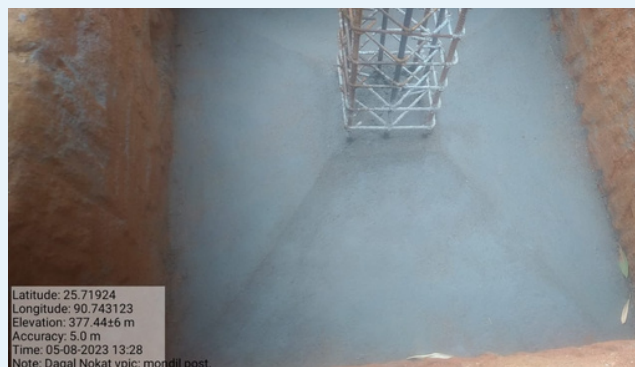
Dagal Nokat village.