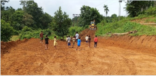
Land preparation for constructing a community hall in Silsekre village.