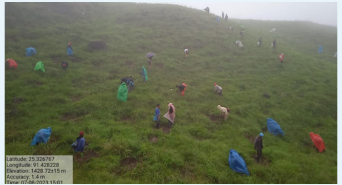
Mawrap VPIC completed ring weeding at the AR plantation on August 7, 2023.