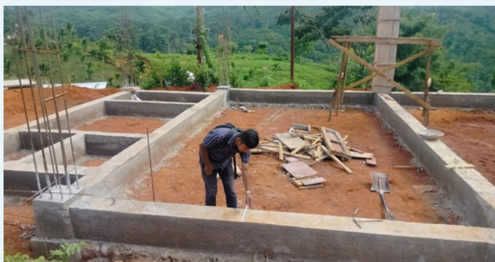
Danal Dasik village.