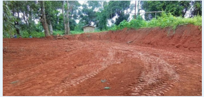
Land preparation for constructing a community hall in Chinapgre village.