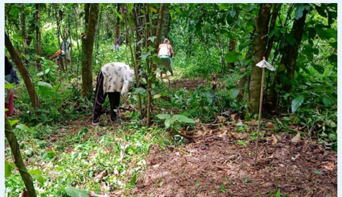
Weeding in progress at Abendagre village.