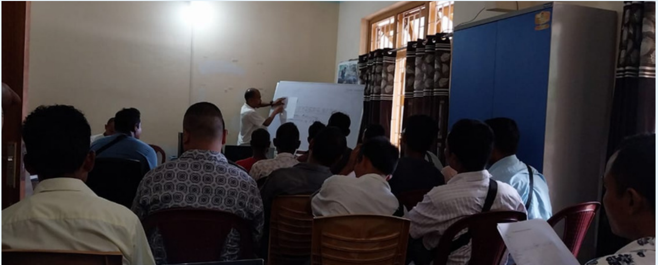
North Garo Hills

Meetings are underway for beneficiaries of the payment for ecosystem services scheme. The sessions encompass guidance on effective fund utilization and timely submission of Utilization Certificates (UC).