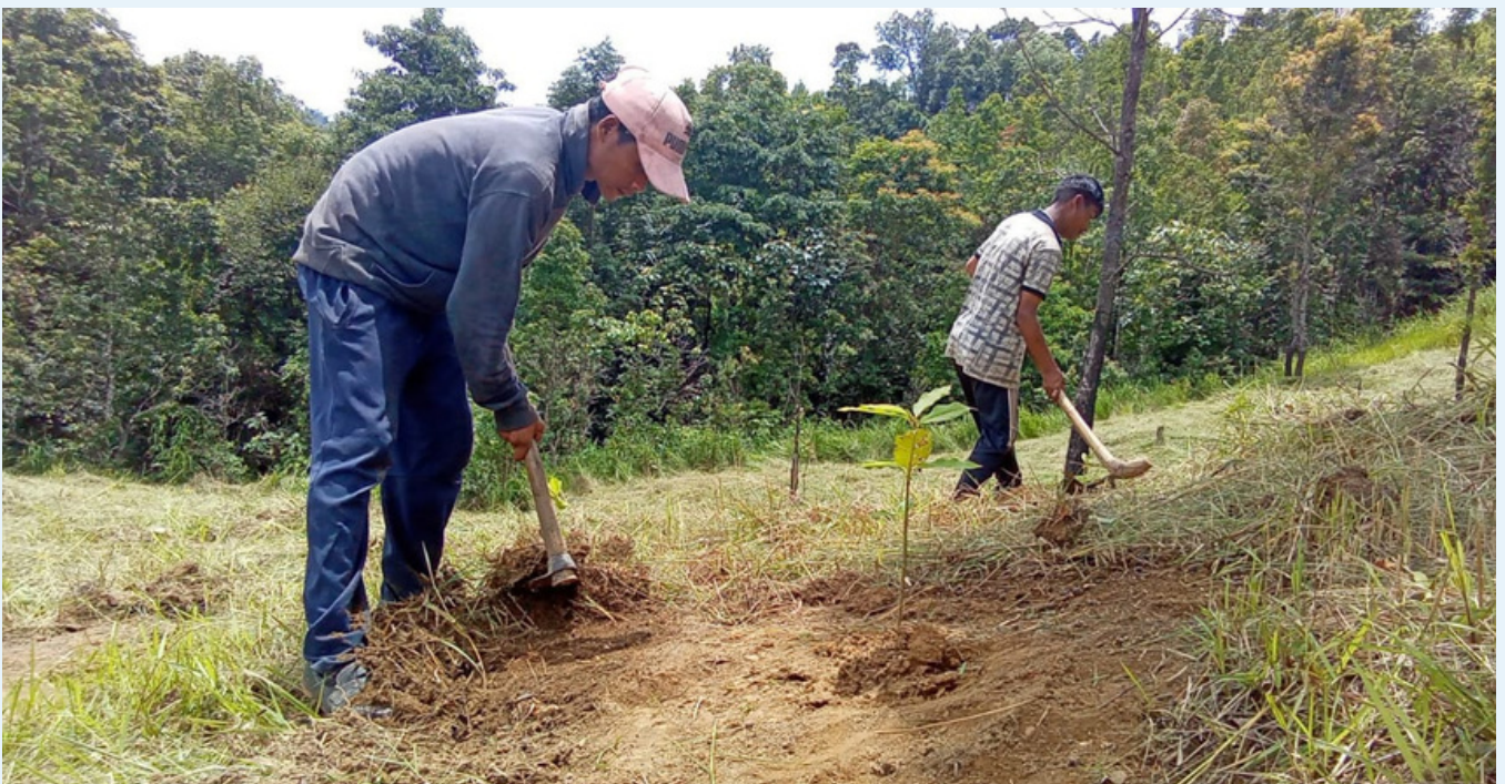
First ring weeding began in Tuidam village.