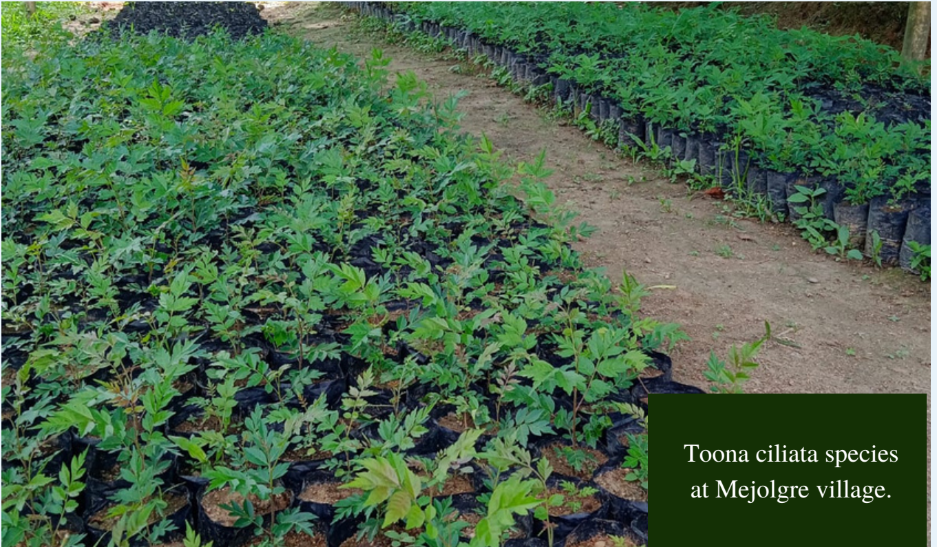
Toona ciliata species at Mejolgre village.