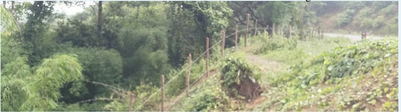
Fencing at Sonmagre village.