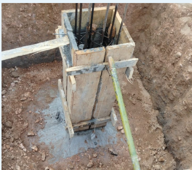
Danal Apal village.