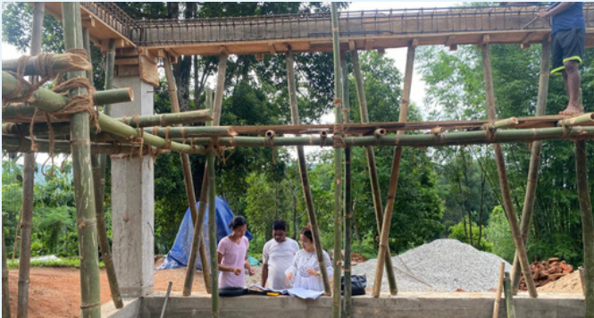
Thapa Ragolgre village.