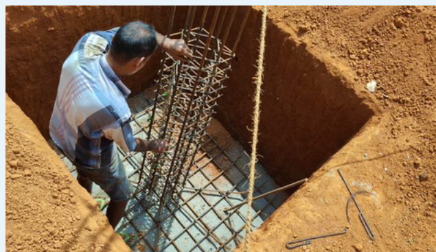
Kalak Songital village.