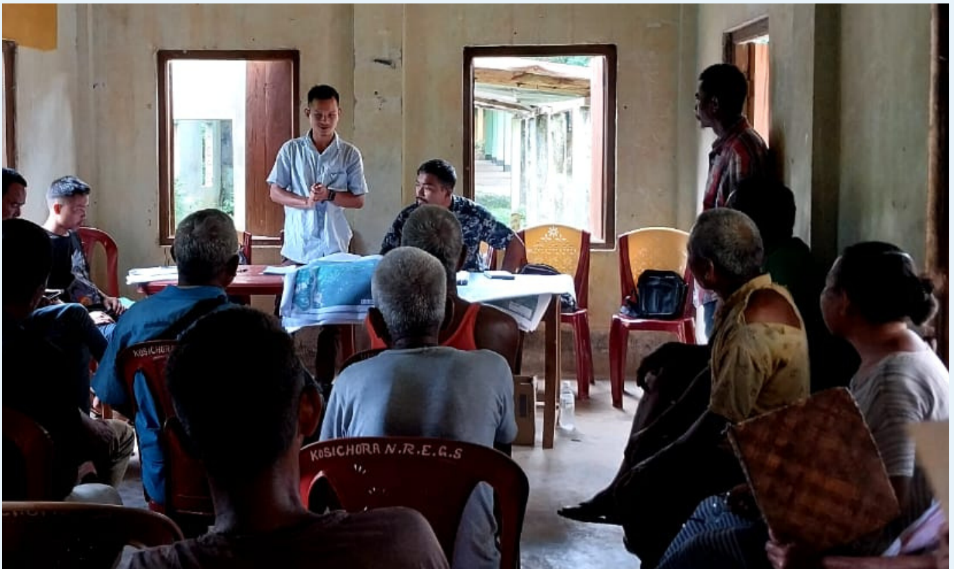
On July 3rd, 2023, micro planning began in Kosi Chora group II village.