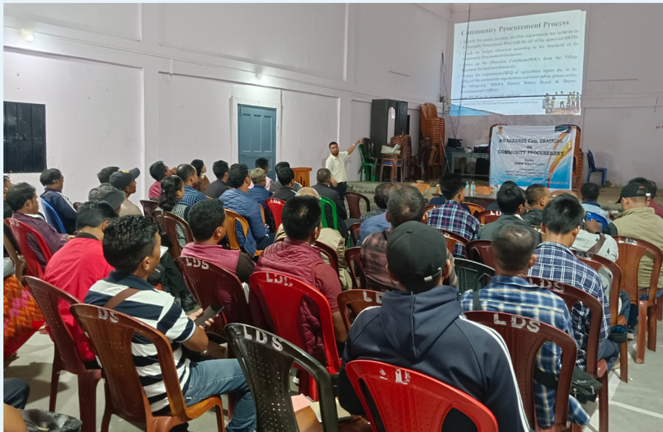
A successful Awareness Program and Training on Community Procurement was held at Lad Mukhla Hall, Thadlaskein Block, West Jaintia Hills, on August 3, 2023.