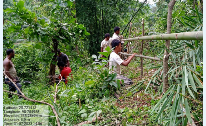
Completion of fencing at Mejlgre Nokat village.