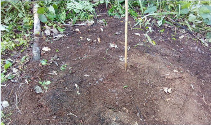
Weeding in progress at Thaugittim village.