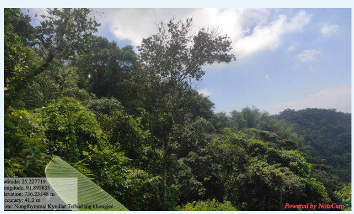
PES verification completed in Nongthymmai Kyndiar village.