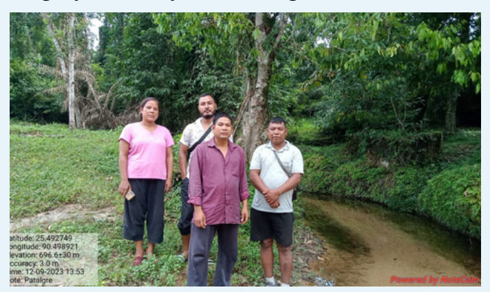
PES verification at Patalgre village.