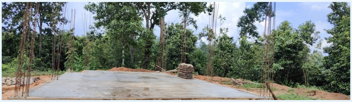
Kalak Songgital village.

Altude: 26.615151 angtude: 90.513748 mpre 905/227031143 mpre 905/227031143 mpre 905/227031143