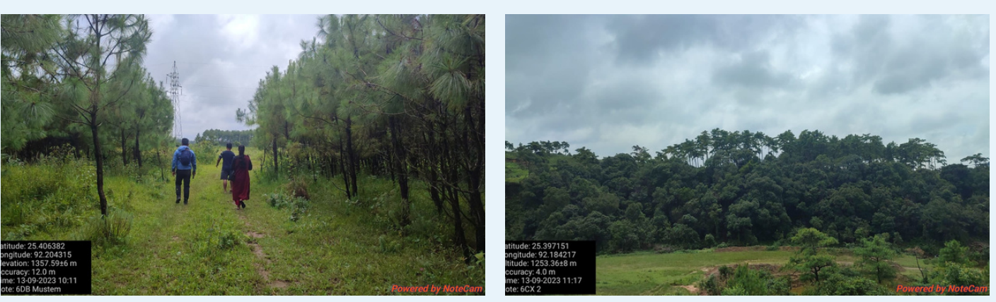
PES verification at Mustem village.