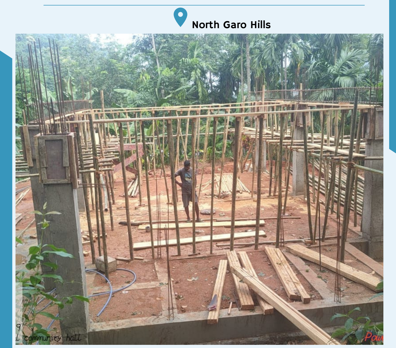
Rajasimla Songgital village.