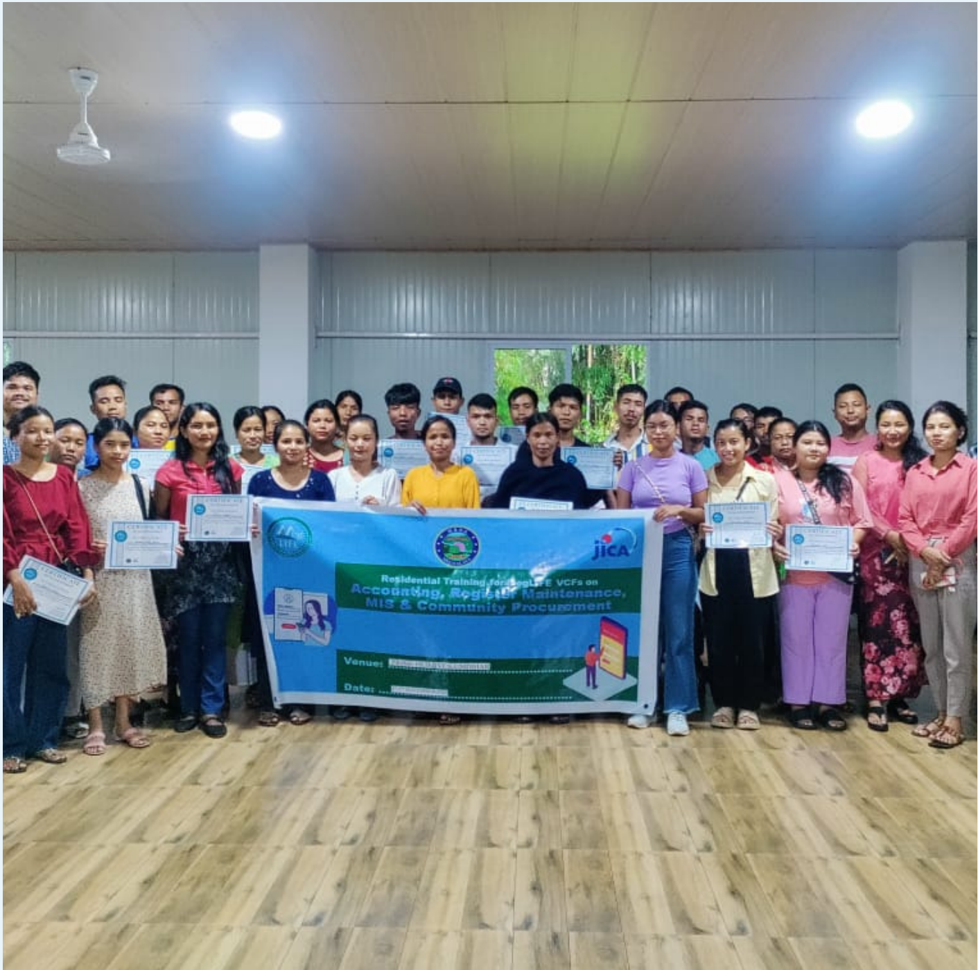
Umsning and Umling C&RD Block (RiBhoi).