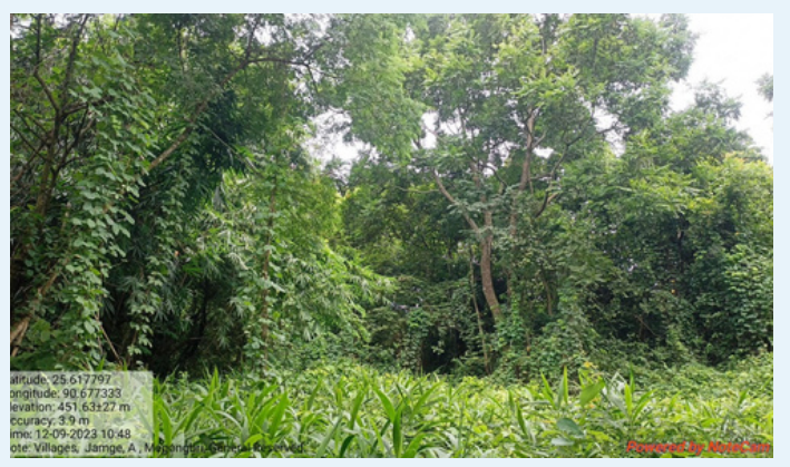
PES verification at Jamge A village.