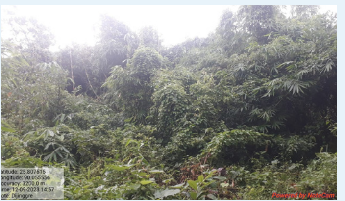
The UBIOD 21 STA