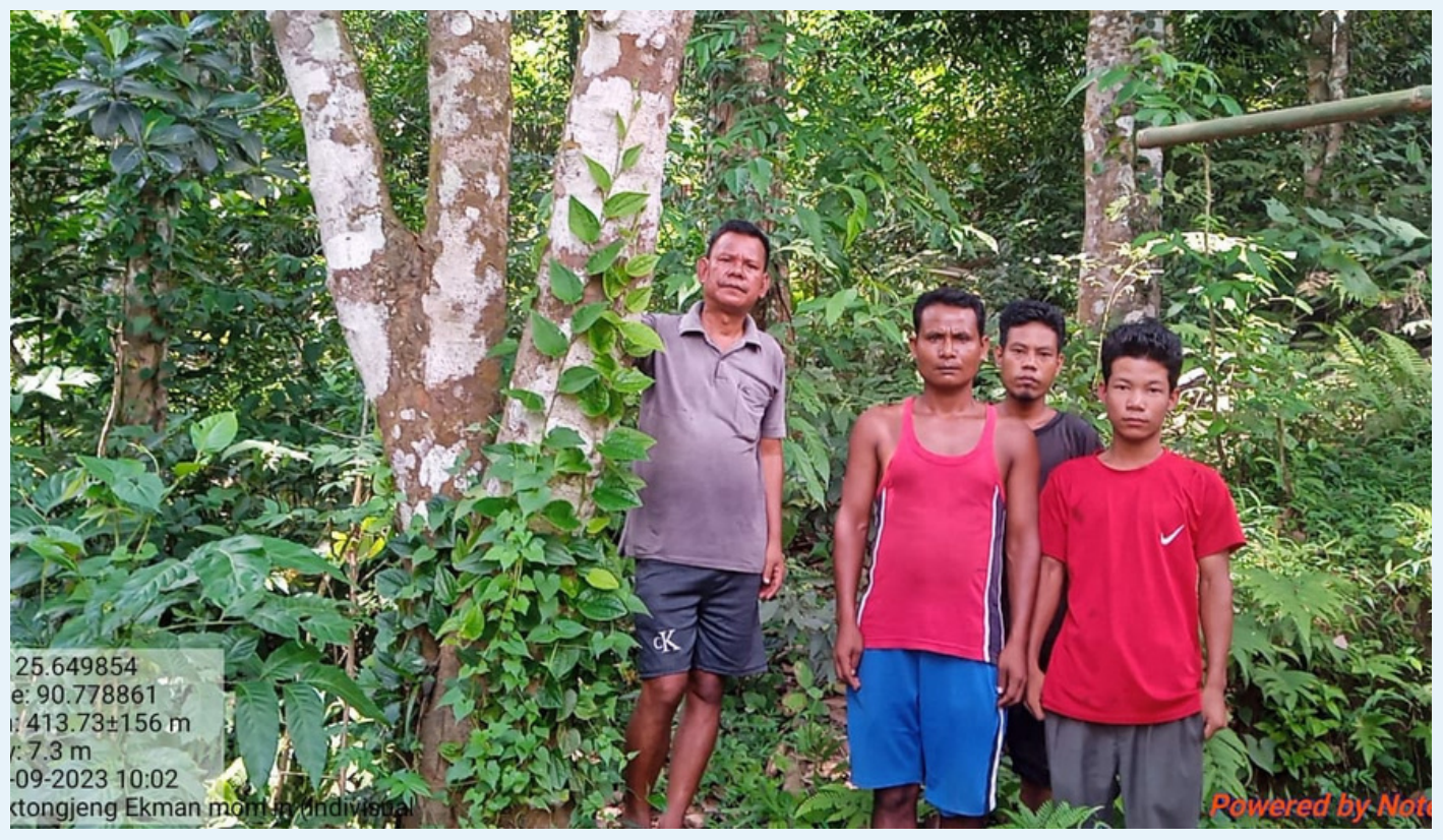
PES verification completed in Miktongjeng village.