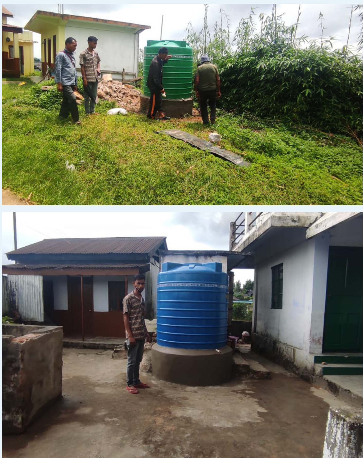
Plastic tanks at Pynthorlangtein village, under Thadlaskein Block.