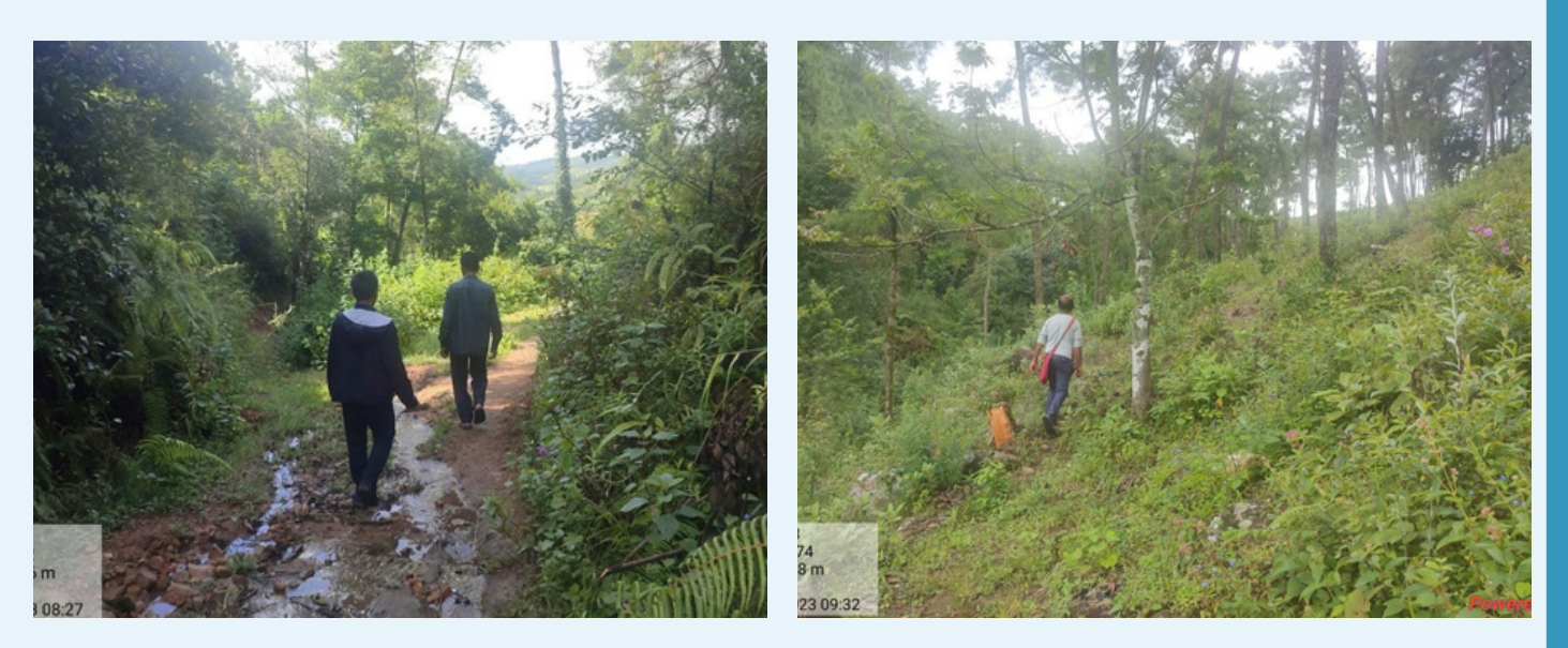
PES verification at Mawtharap village.