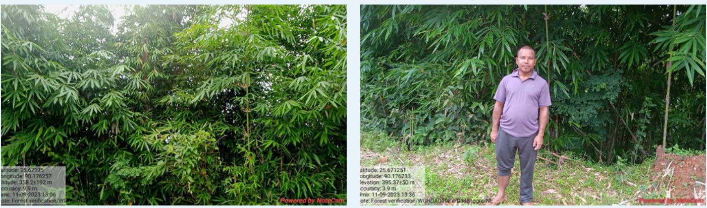
PES verification completed by Dadenggre Block applicant.