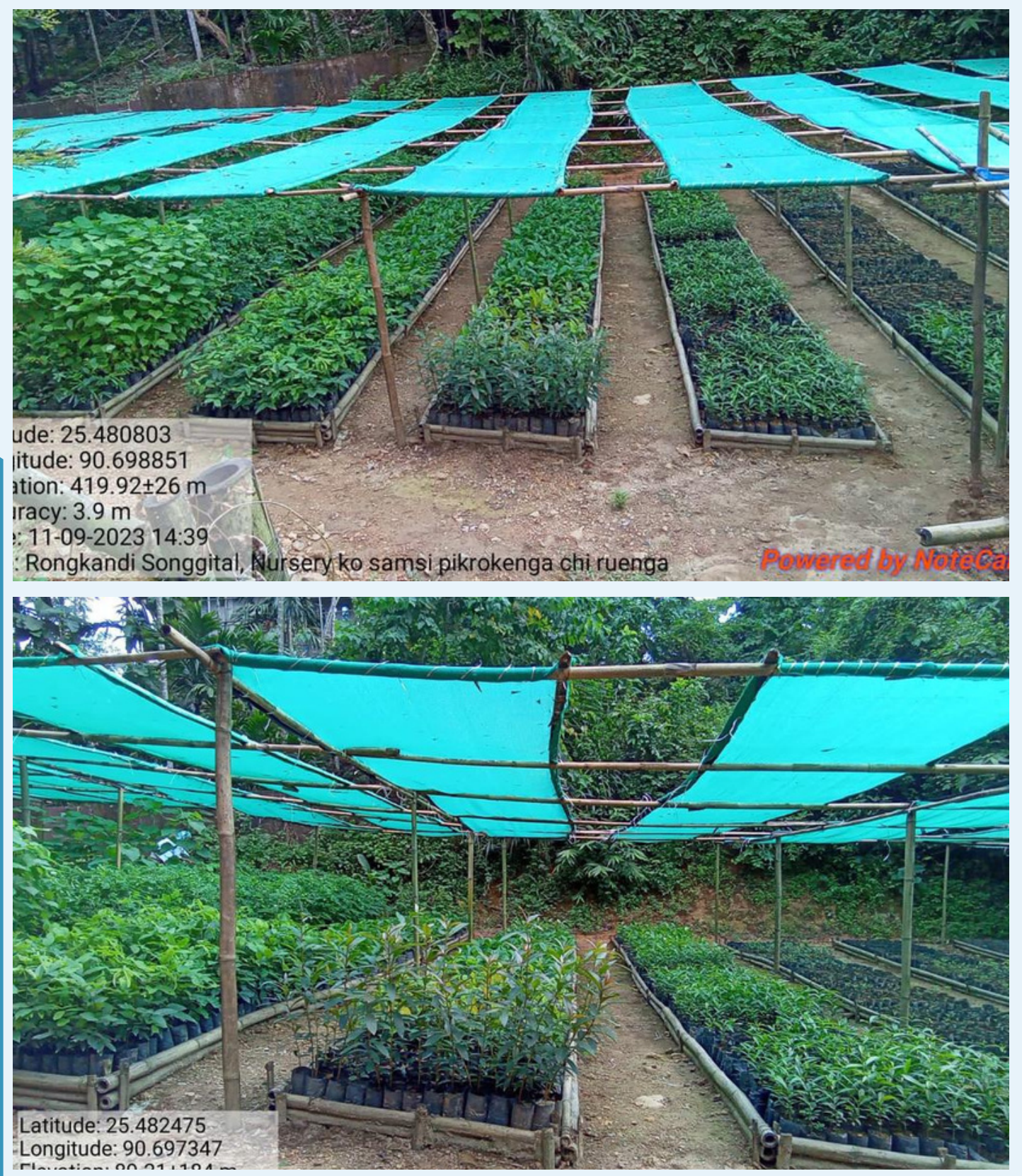
Rongkandi Songital village.