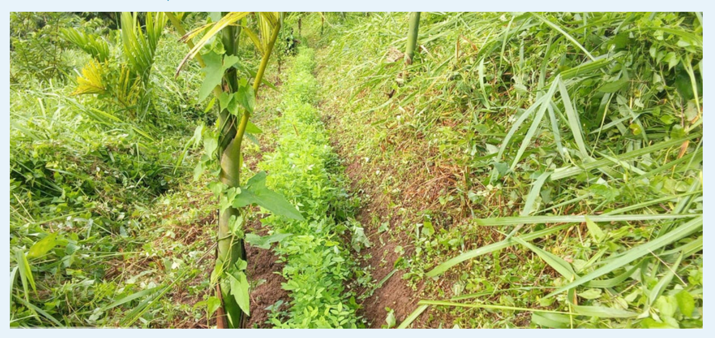
Mejolgre Nokat village.