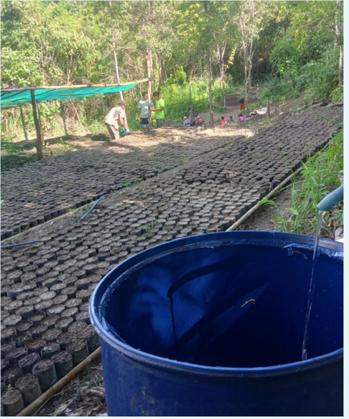
Nursery extension at Tlangpui village.