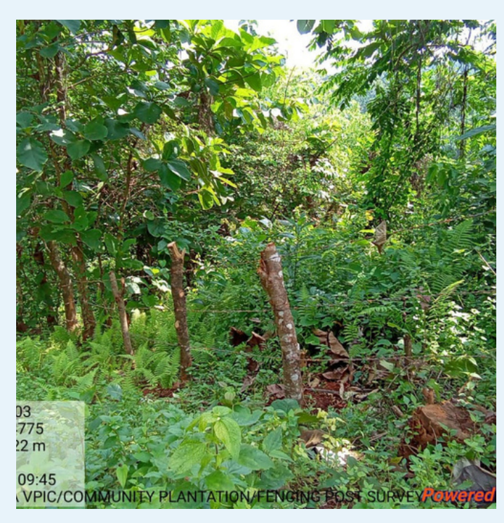
Gindopara plantation's resurvey concluded on August 30, 2023.