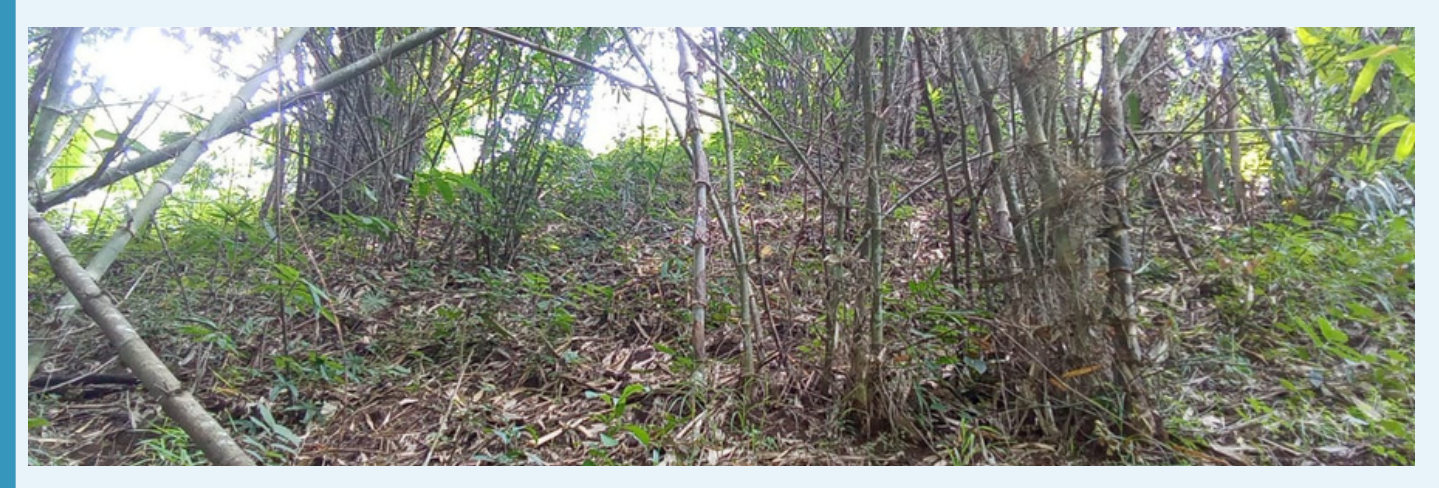
PES verification at Mawshang village.