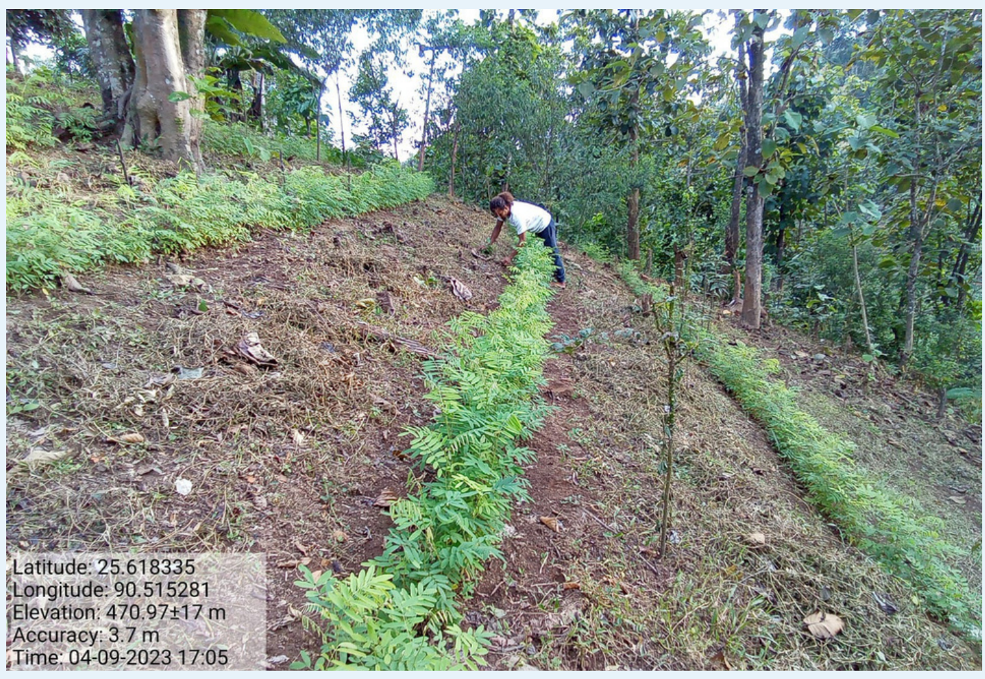
SALT farm from Amalgre village.