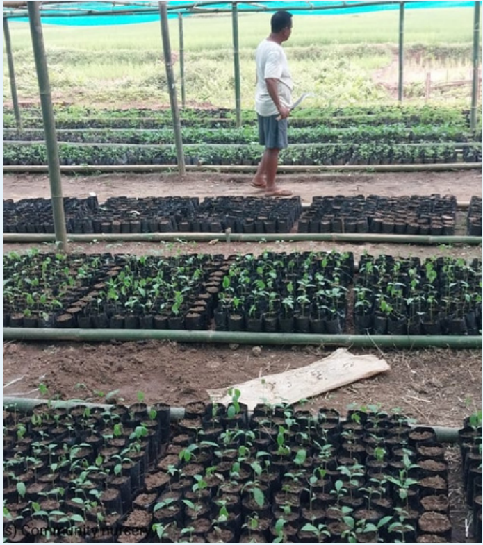
Expanding and extending nurseries in Rongpetchi village.