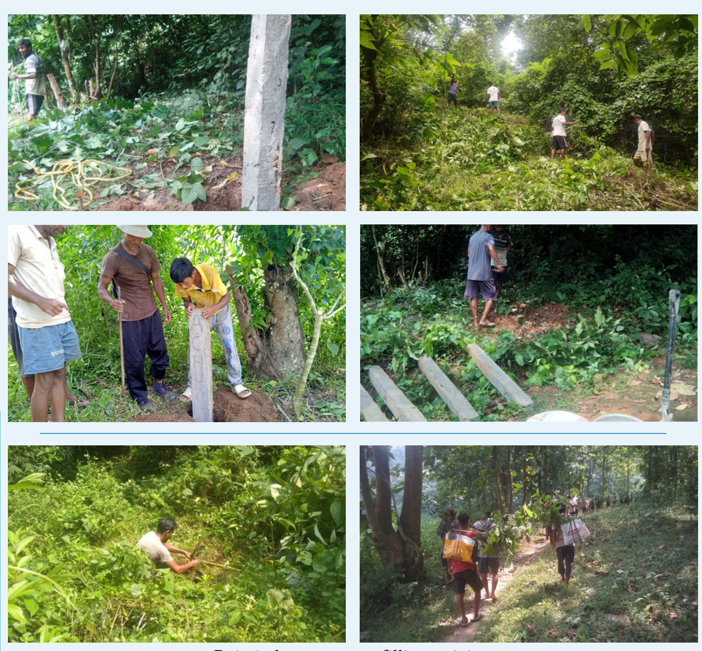
Rajasimla reserve gap filling activity.