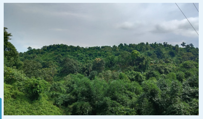
Gabil Mahari Reserved forest.