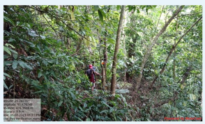
PES verification at Rangweng village.