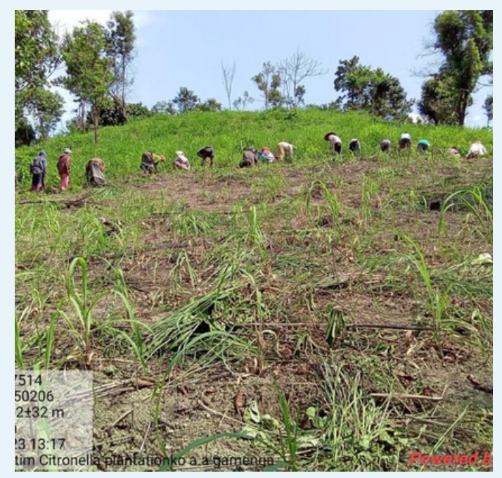
On September 5, 2023 first weeding going on for Citronella and Lemon grass plantation