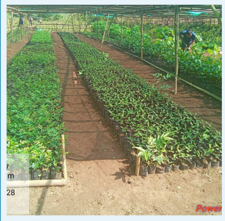
Dagal Nokat village.