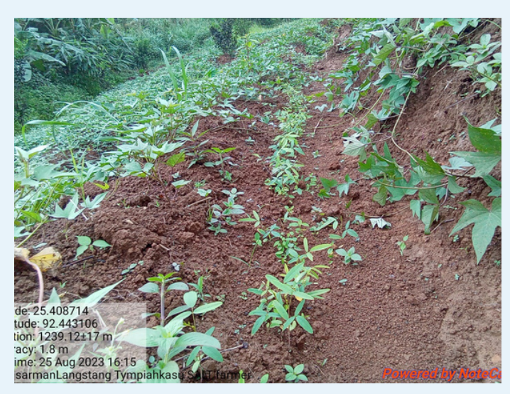
Witnessing germination alongside specific farmers within the Khliehriat Block.