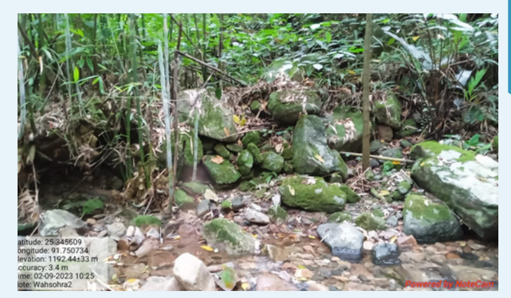
PES verification at Wahsohra village.