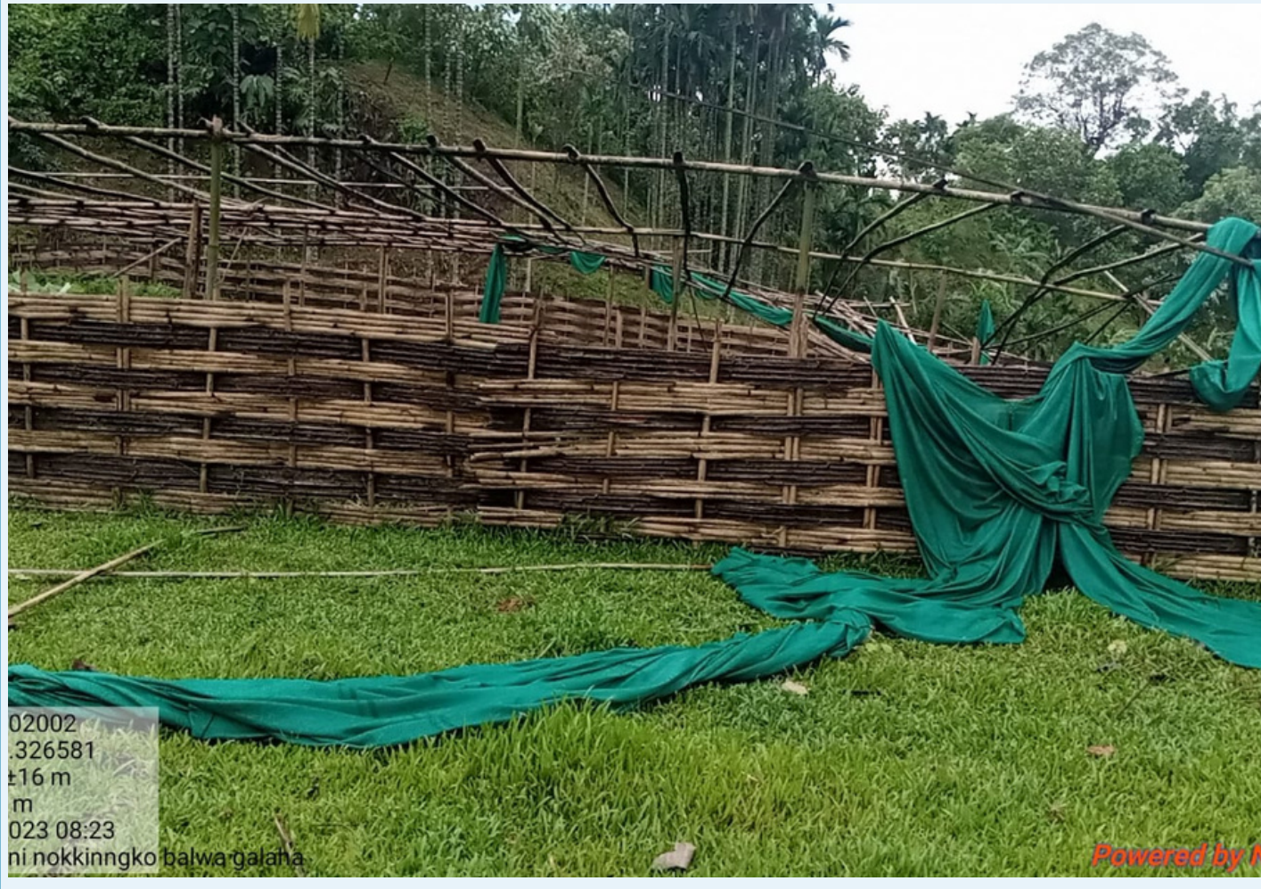
The strong winds experienced on September 4, 2023, caused significant damage to several nurseries located in the Gasuapara Block.