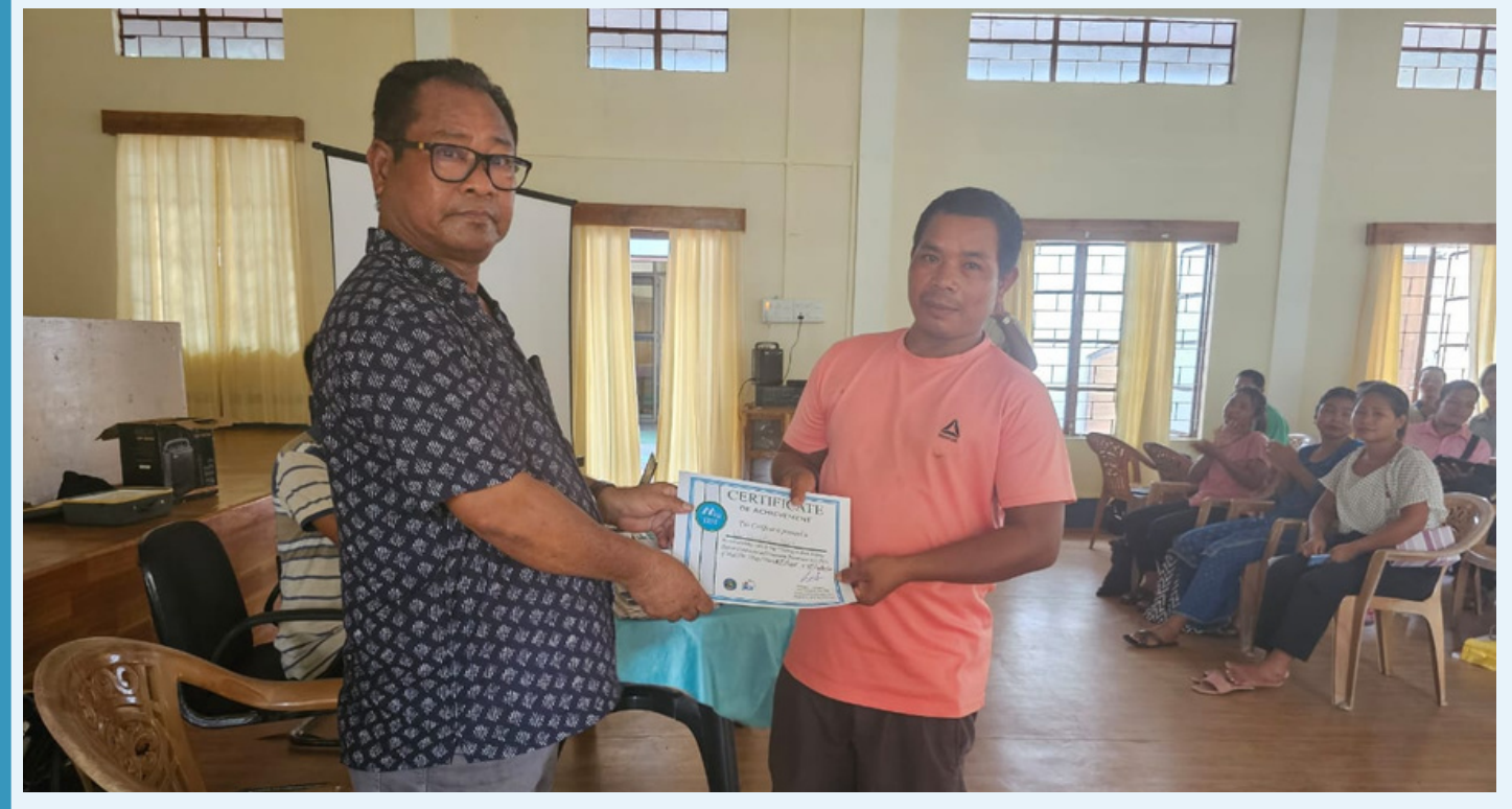
The four-day VCF training at Mendipathar Cooperative Society in the Resubelpara Block of North Garo Hills concluded on August 1, 2023.