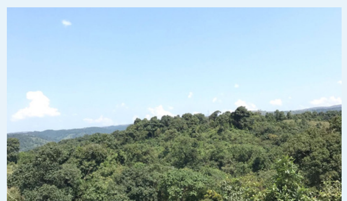
PES verification at Lurniang village.