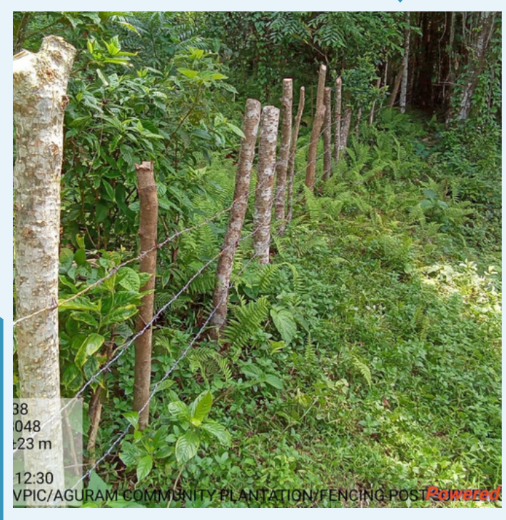
Resurvey of plantation sites in the village of Silsekgre commenced on August 31, 2023.