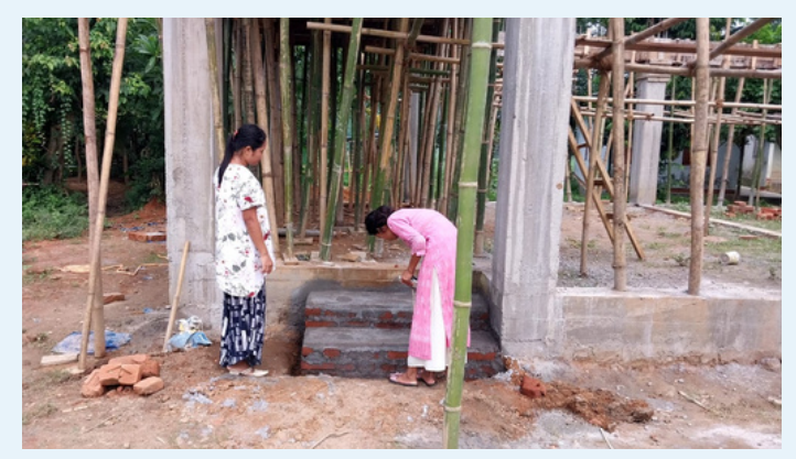
Nanil Apal village.