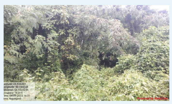
PES verification completed at Najokgre (B) village by VCFs.