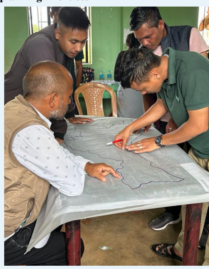
PLUP and Microplanning initiatives are currently underway in Khonshnong Laskein Block (Group II village) on August 29, 2023.