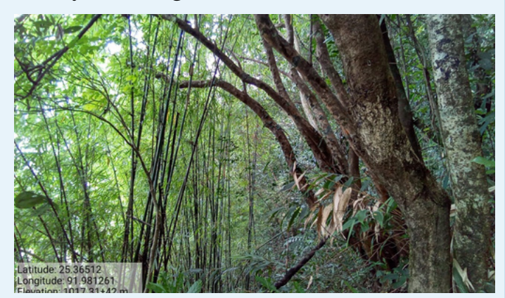
PES verification at Wahmawleiñ village.