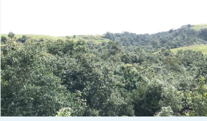
PES verification at Pamtadong village.