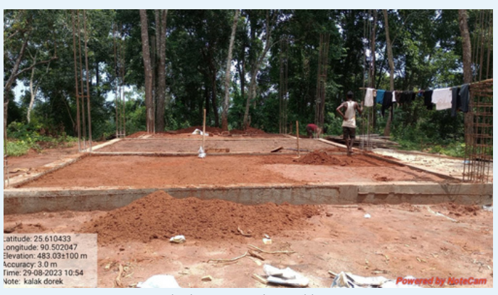
Kalak Dorek village.