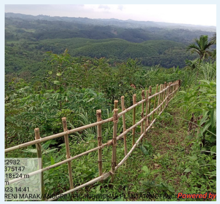
Anogre village plantation re-survey concluded on September 4, 2023.