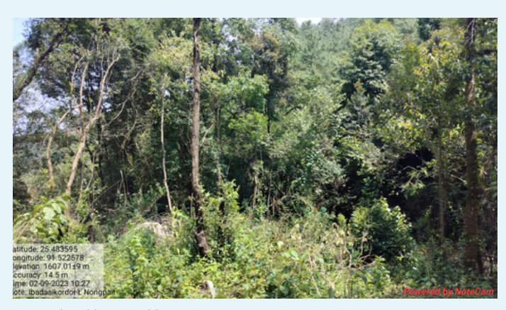
PES verification at Mawkyllei village.