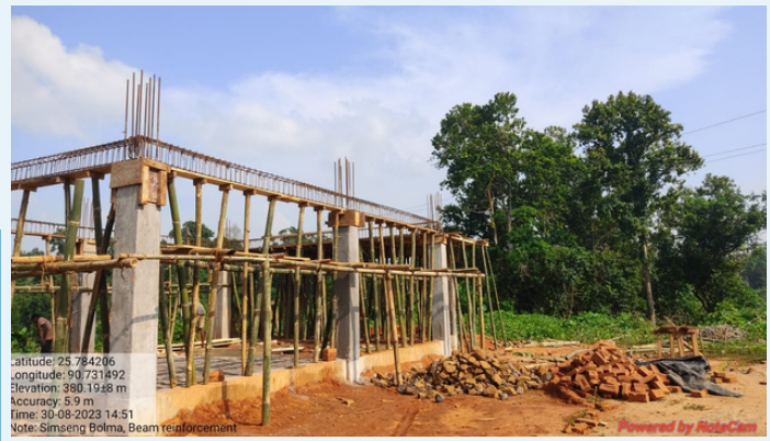
Simseng Bolma village.