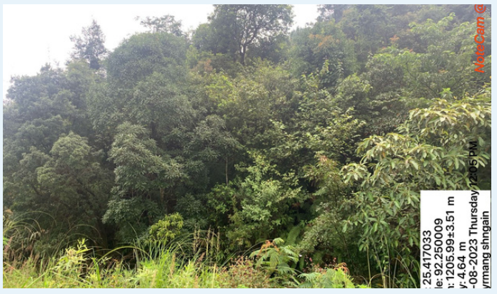
PES verification at Chyrmang nein village.