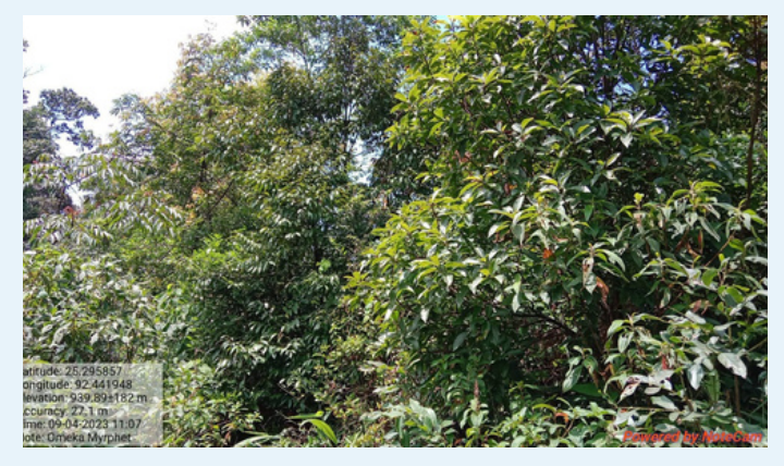
PES verification at Sakhain village.