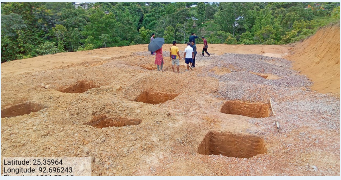
BPM's site visit to Tlangpui community hall on August 2, 2023.