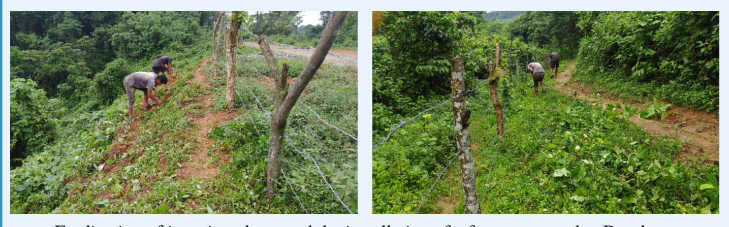
Eradication of invasive plants and the installation of a fence occurred at Dorakgre Community Reserve on September 1, 2023.