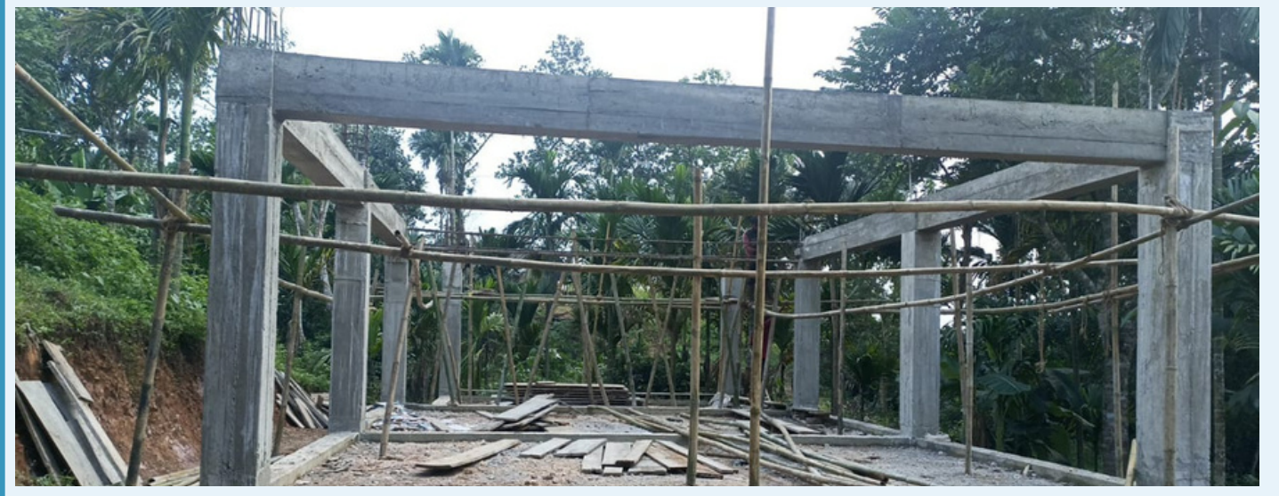
Rongkandi Songgital village.