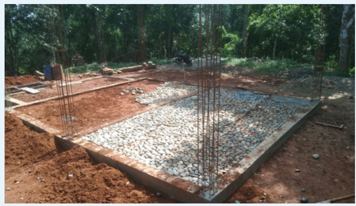
Kalak Songgital village.