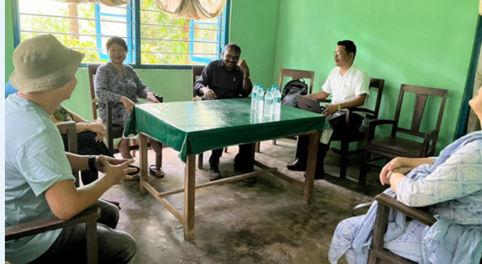
On August 30, 2023, MegLIFE team visited Gambarigre, Balupara, and Chibokgre community Halls.