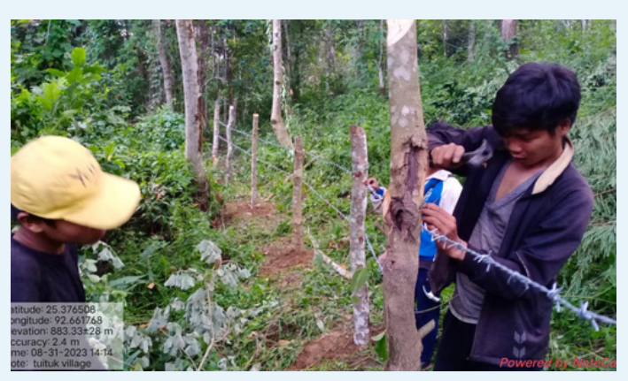
Fencing work at Tuituk village.