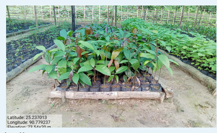
Rona Agal village.