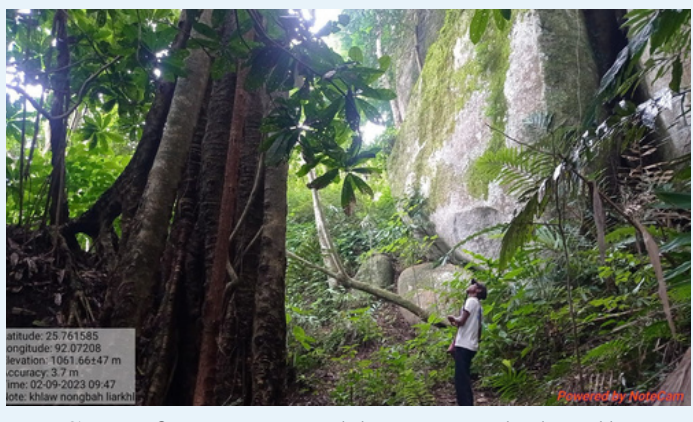
PES verification at Khlaw Nongbah village.