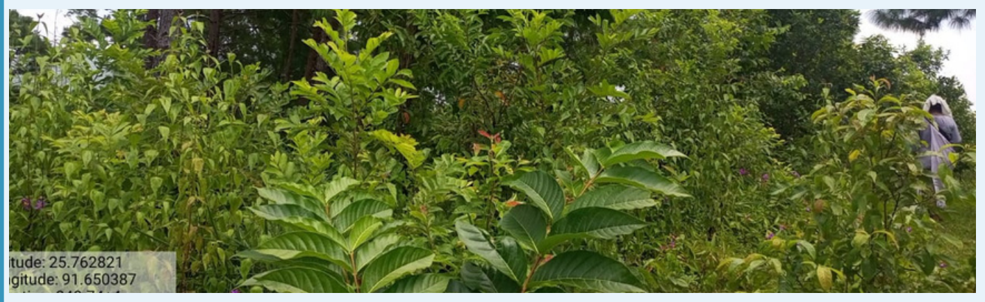
PES verification at Mawpat dongkiiingding village.