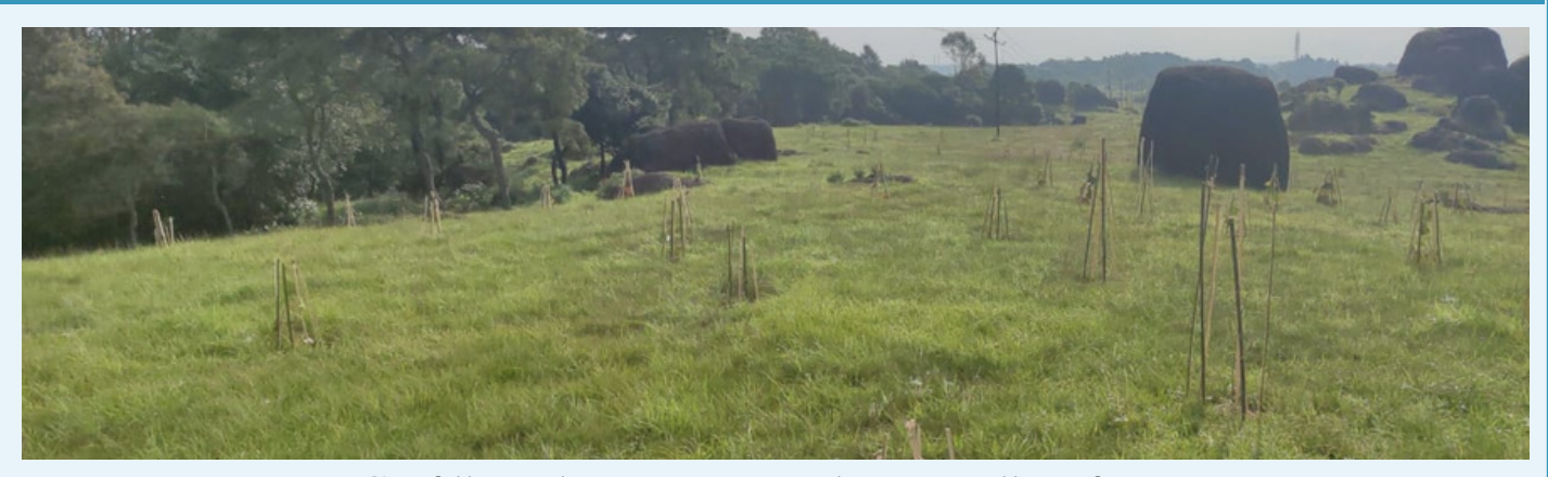
Gapfilling plantation in Mawlangwir village forest.