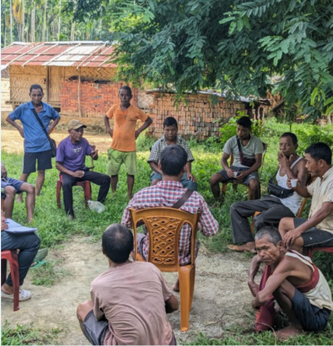
The Microplaning exercise commenced in Kantanggre village on August 31, 2023.