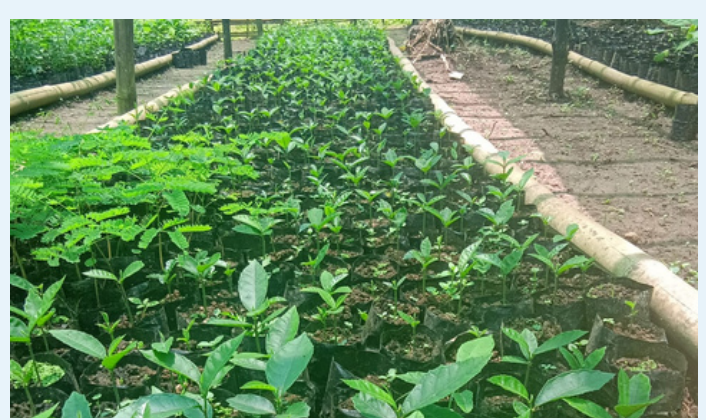
Expansion of the nursery in Rongpetchi village.