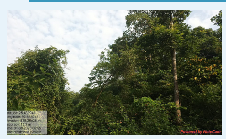
PES verification at Mooriap village.