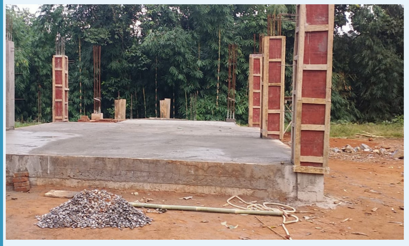
Dagal Nokat village.