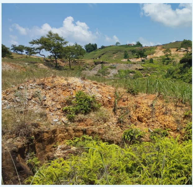
Follow up and Monitoring for newly plantation at Mawpiah, Mairang Block, EWKH and Sohkymphor Village, Wapung Block, EJH