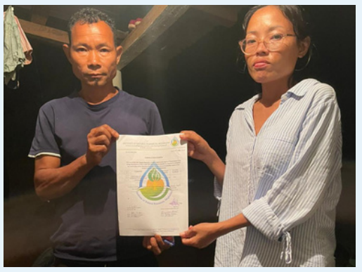
Rongrebok Kamagre Village, Samanda Block