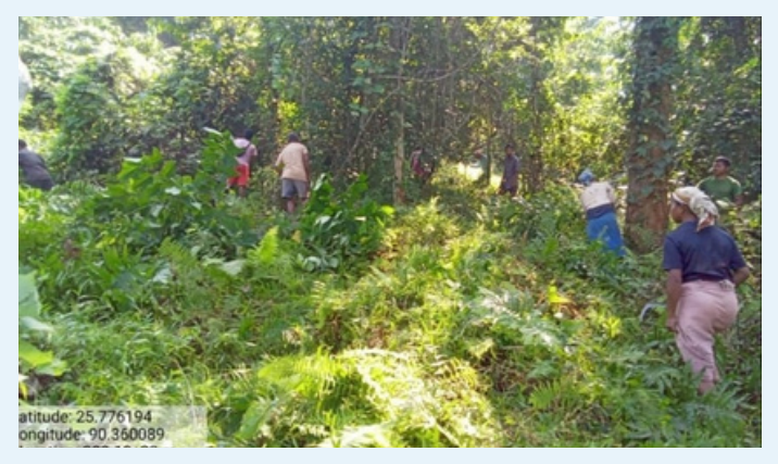
Second weeding and ring cleaning in Renchagre Rongram village.