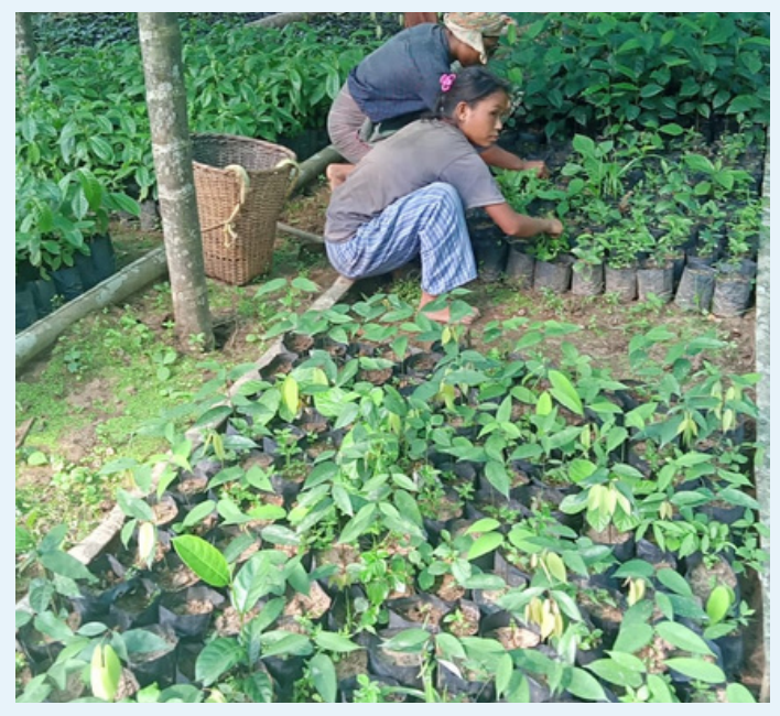
Weeding and filling vacancies are ongoing in Skagre village.