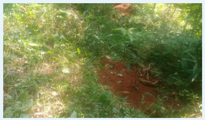
Second weeding and ring cleaning in Gindopara village.