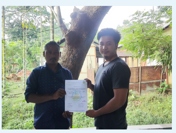
Rongmegre village, Chokpot Block