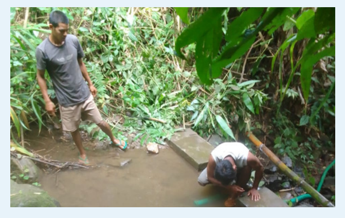
Dallangre Village, Dadengre Block