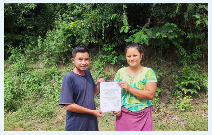
Gabil Ading village, Rongjeng Block