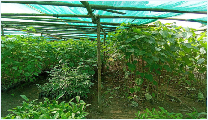
Simseng Gading village.