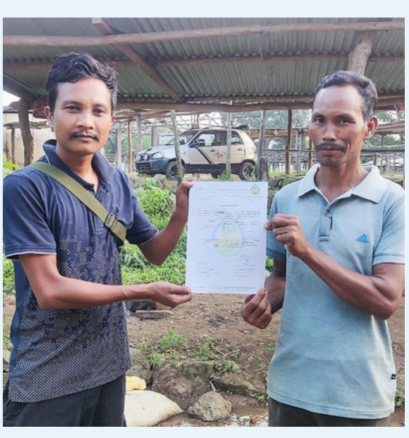
Siju Medical Colony village, Baghmara Block