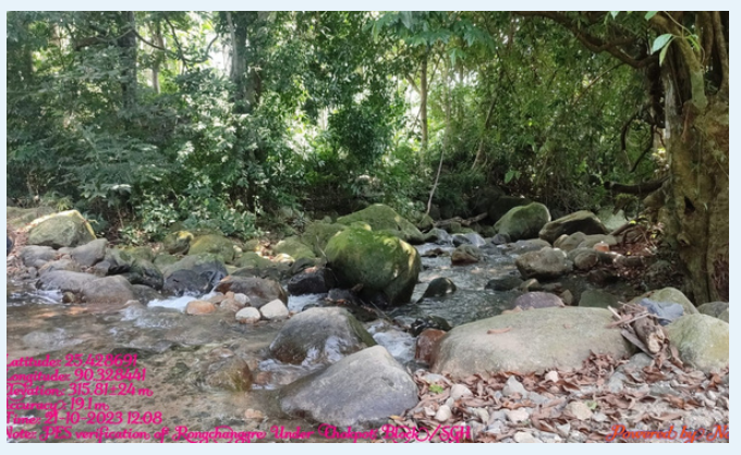
PES verification in Rongchanggre village.