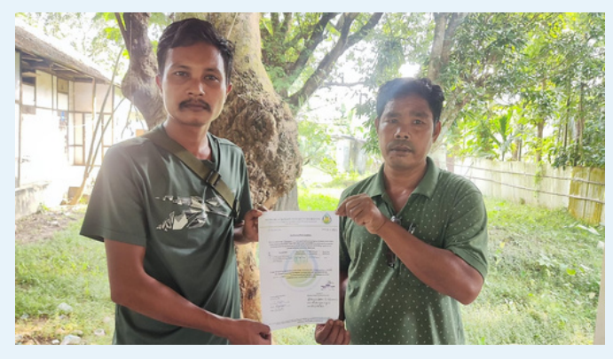
Mikadogre village, Chokpot Block