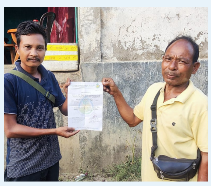
Siju Rongkenggittim village, Baghmara Block