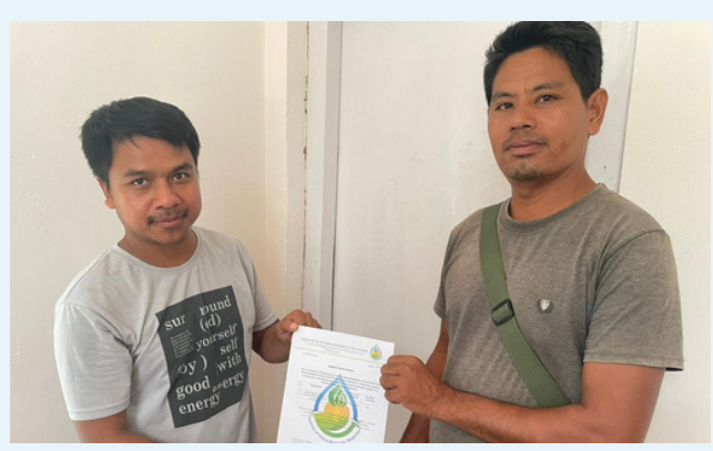
Jongdikgre village, Dadengre Block