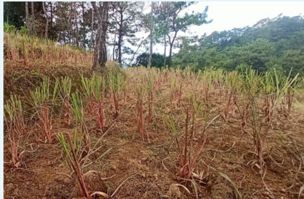
Site verification on the cultivation of citronella at Wahlang village, EKH.