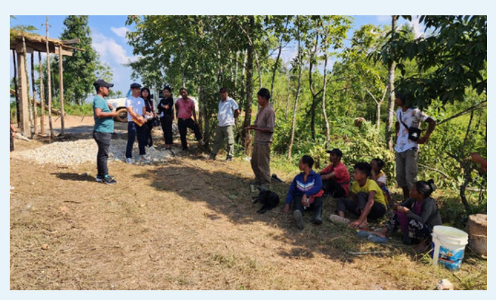
On October 18, 2023, the DPM and their team carried out an on-site inspection to assess the development status of community hall construction initiatives in the villages of Niangdai and Umtyrkhang.