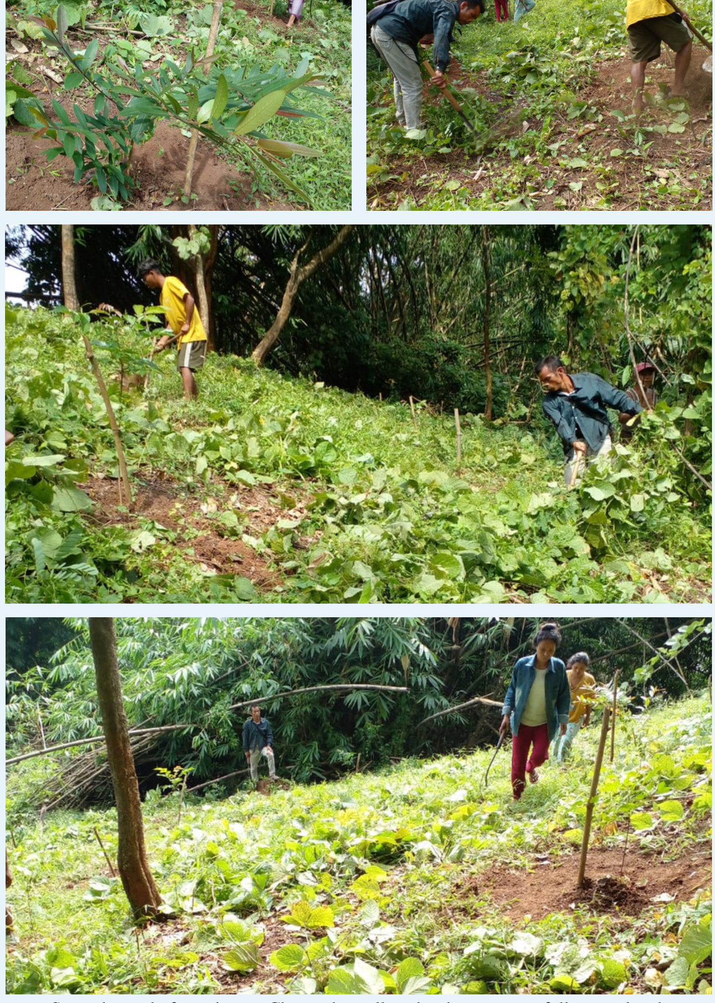
Second round of weeding in Chorepahar village has been successfully completed.