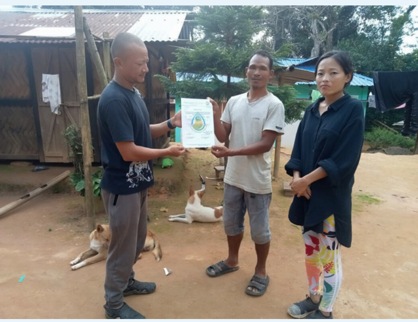
Rongap Songgital village, Songsak Block