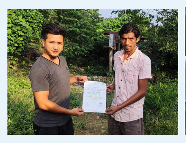
Siju Duramong village,Baghmara Block