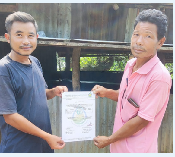
Upper Rongdotchi village,Baghmara Block