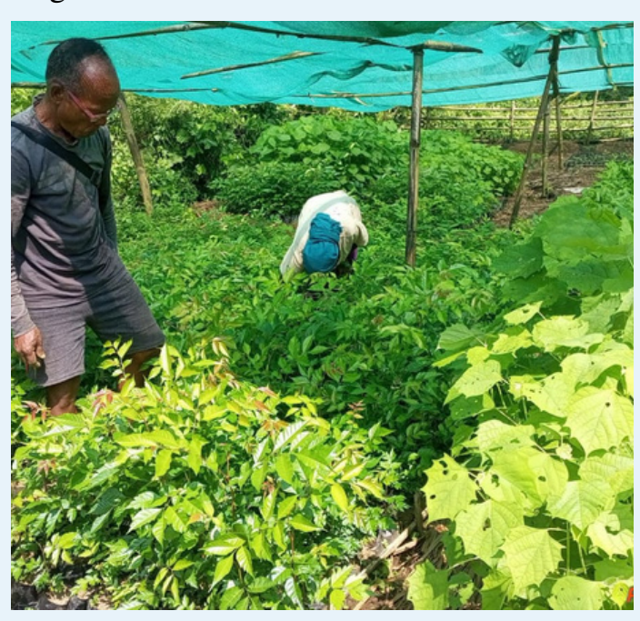
Simseng Balkol village.