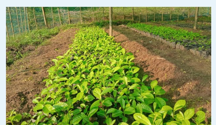
Nanil Apal village.