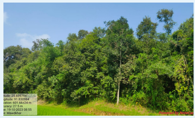
PES verification in Mawdkhar village.