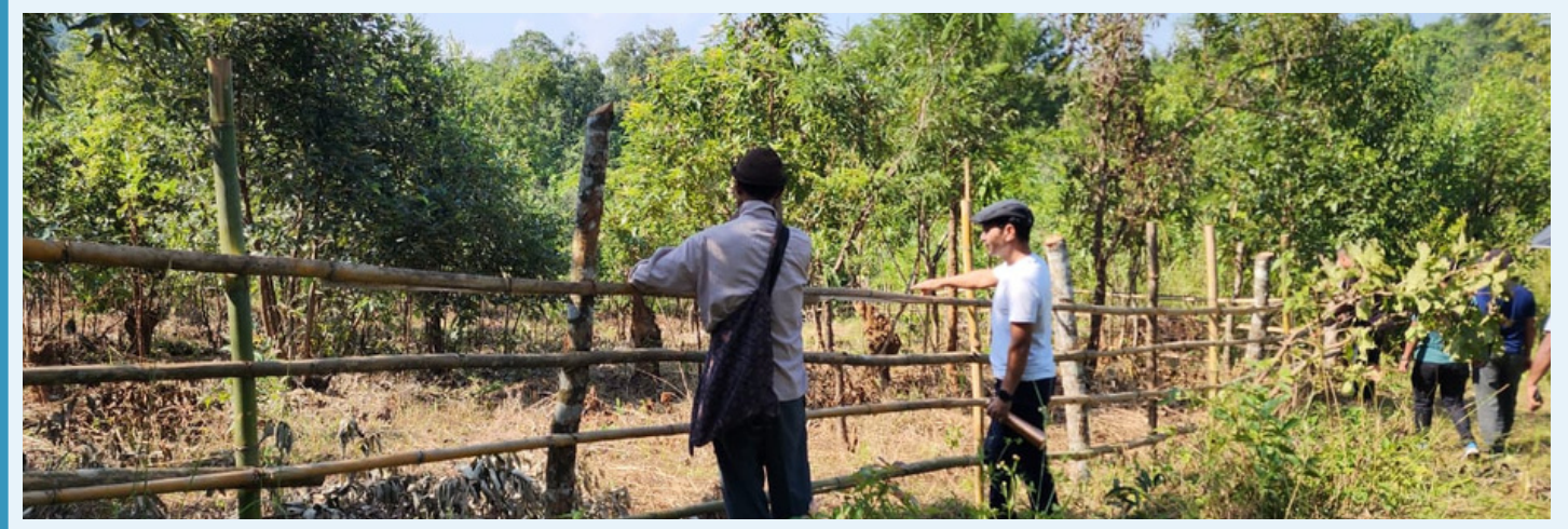
On October 18, 2023, the DPM along with the team visited the community nurseries located in Niangdai and Umtyrkhang.