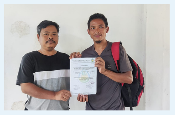
Darengre village, Chokpot Block