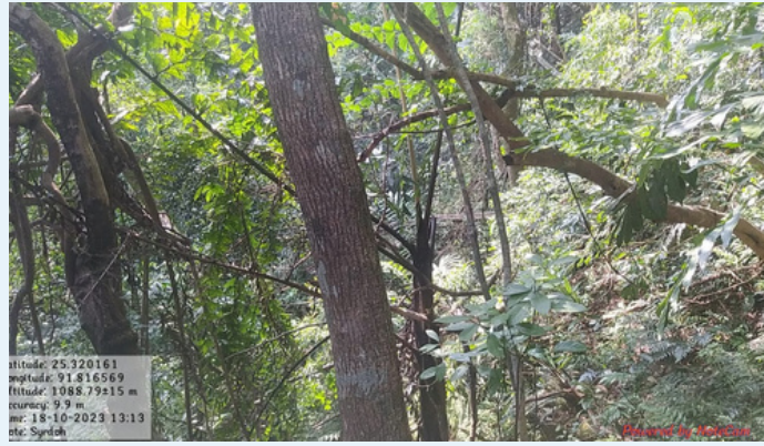
PES verification in Mawmang village.