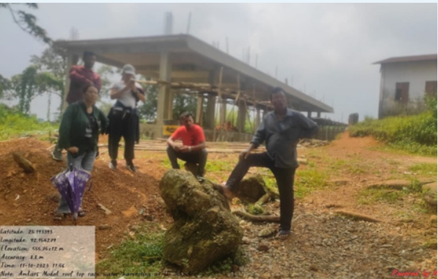
DPMU conducted follow-up on CTF-SRES and verification of WCC Work Completion Certificate.