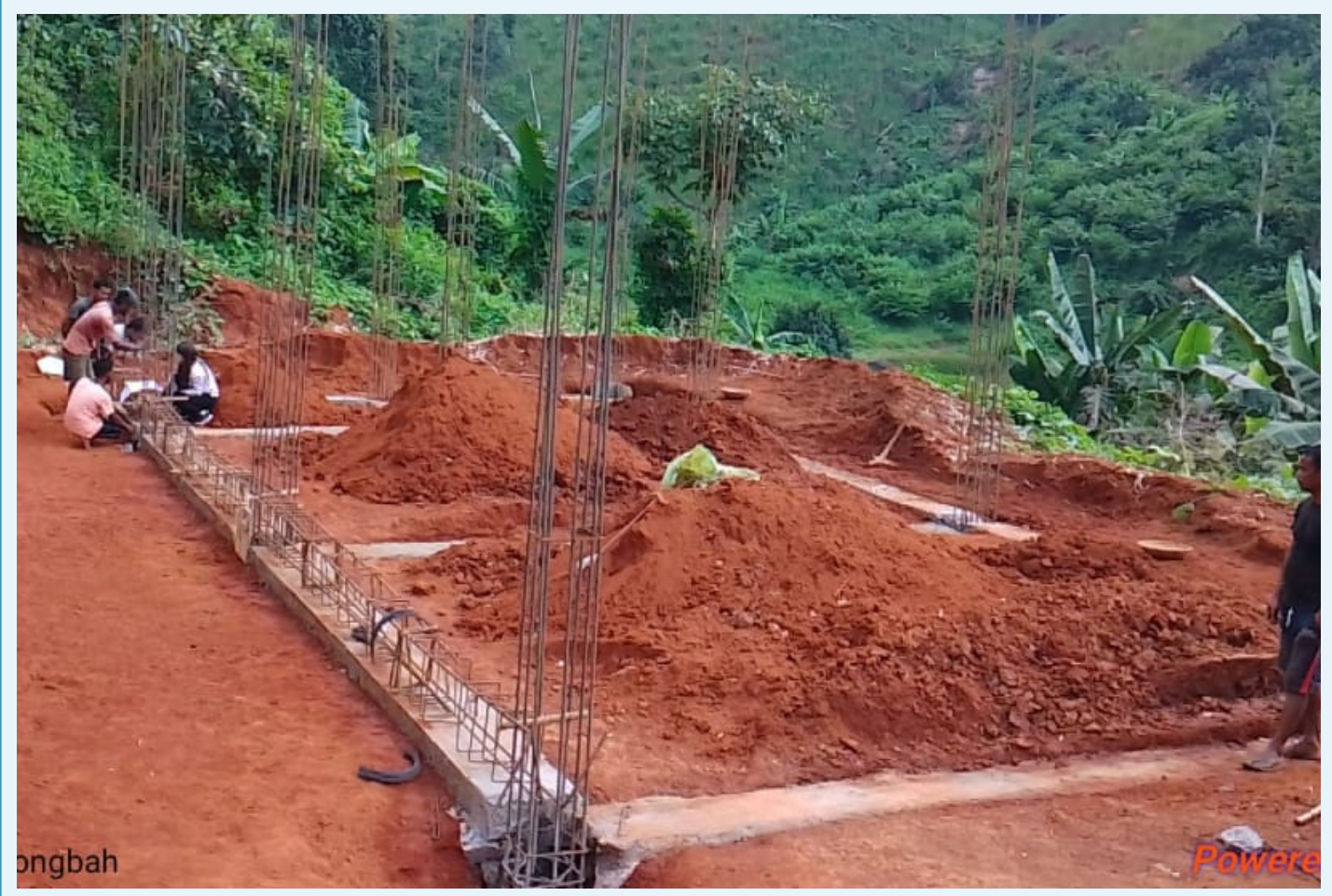
Umrang Nongbah village.