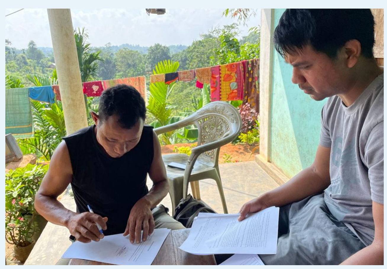
Chidaret village, Redubelpara Block,