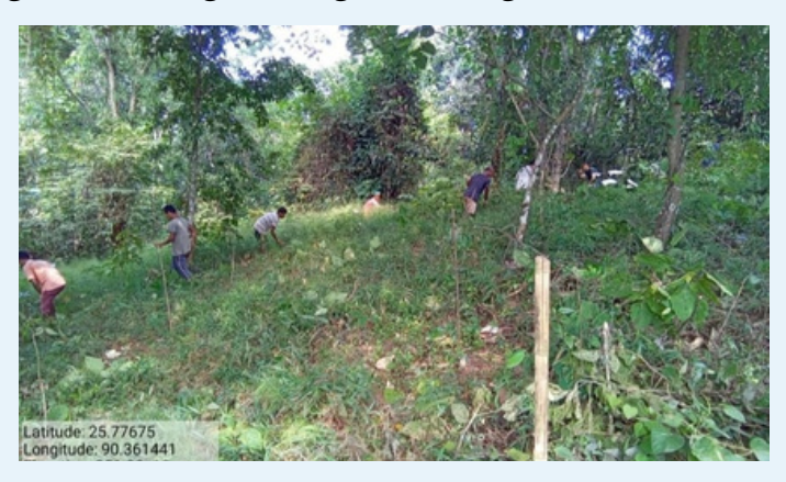
Seconnd weeding in Renchagre village.