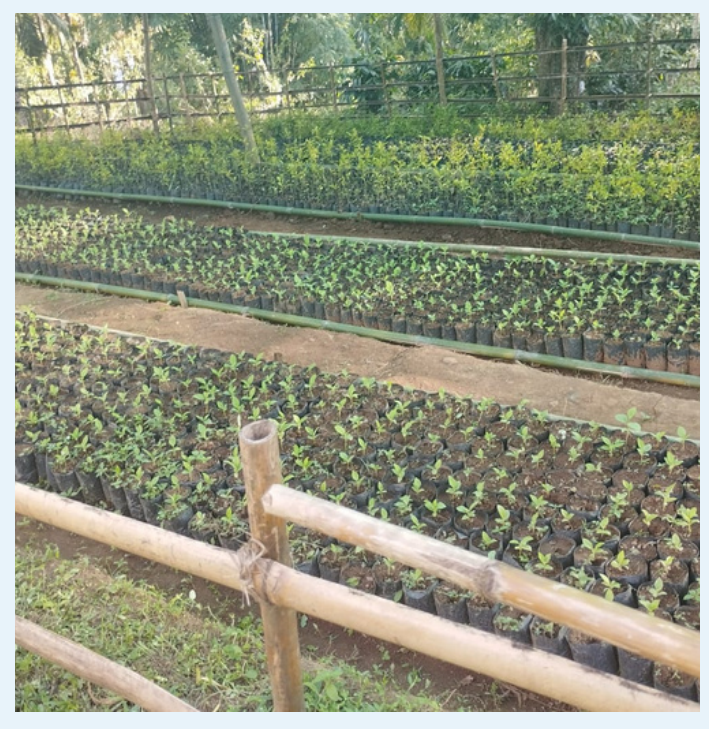
On November 1, 2023, Malika R. Marak conducted a visit to Ading Nokat village for the purpose of inspecting their newly established community nursery.