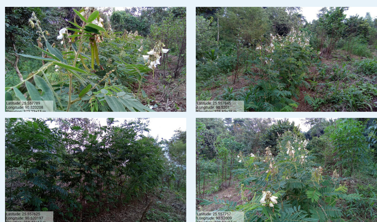
SALT Farming at Gitokgre village.