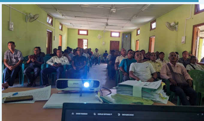
Bajengdoba Block and Resubelpara Block