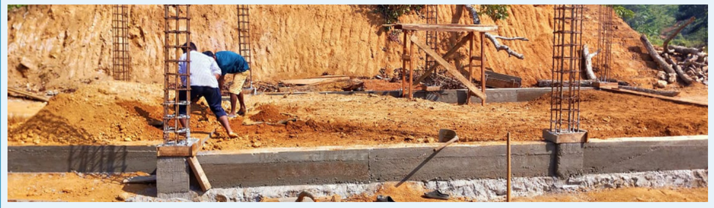
Bangsi Minol village.