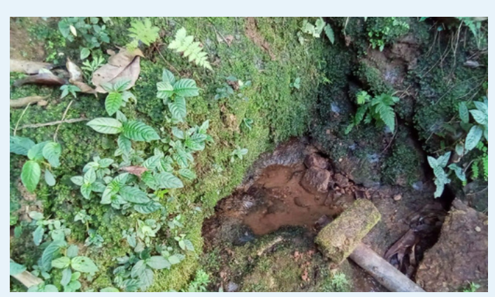
Chosen Site for SWC structure feasibility check in Chorepahar village.