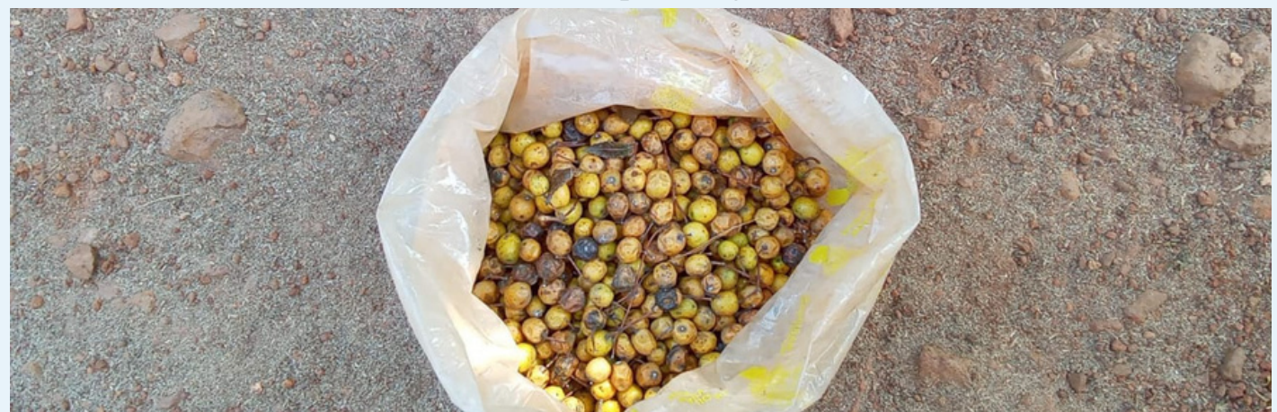
Bangsi Dogru VCF collected neem seeds for vacancy filling