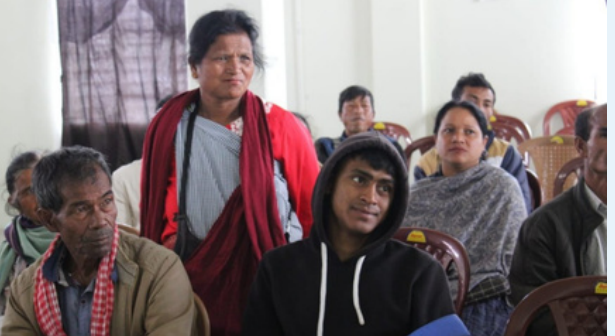
DPMU organized an orientation program on PES for Phase 2 beneficiaries of Amlarem and Thadlaskein blocks at the DPMU office.