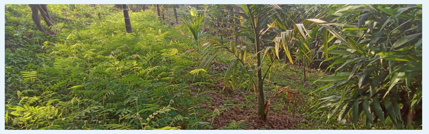
SALT Farming at Thaugittim village.