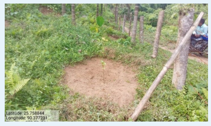
Second weeding clearing in Silsekgre village.