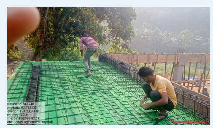
Bangsi Aga village.