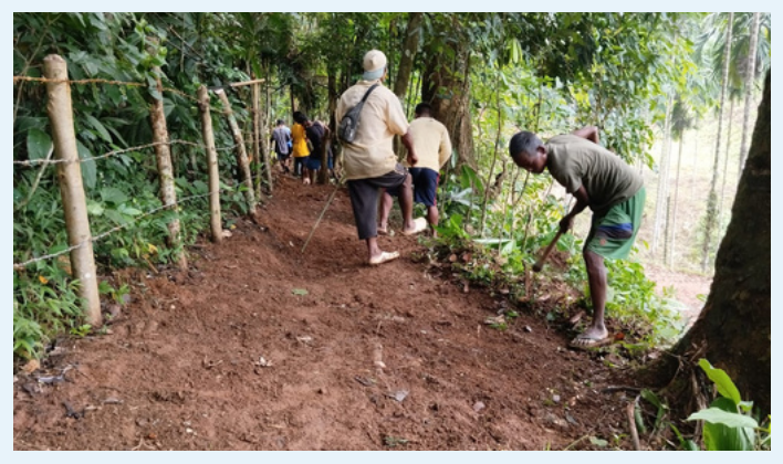
Clearing weeds and creating a firebreak in Silsekgre village.