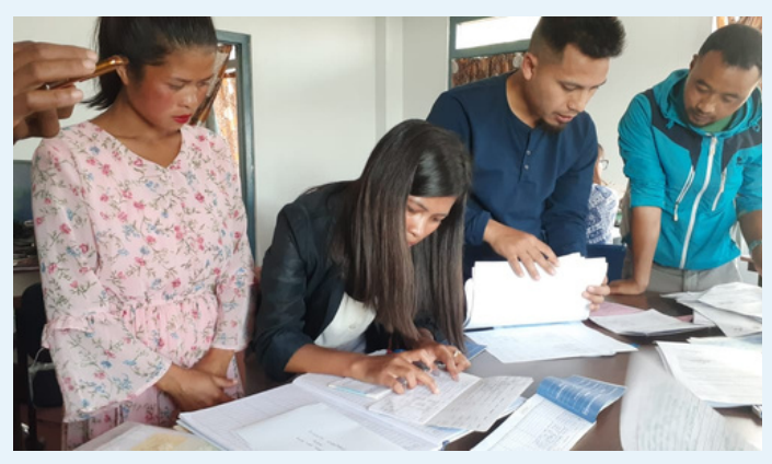
Checking and rectification of VPIC registers in the South West Khasi Hills from October 16 to November 1, 2023.