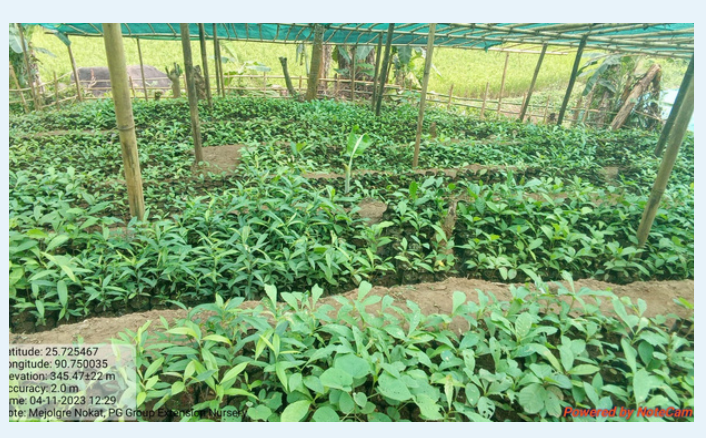
Mejolgre Nokat village.