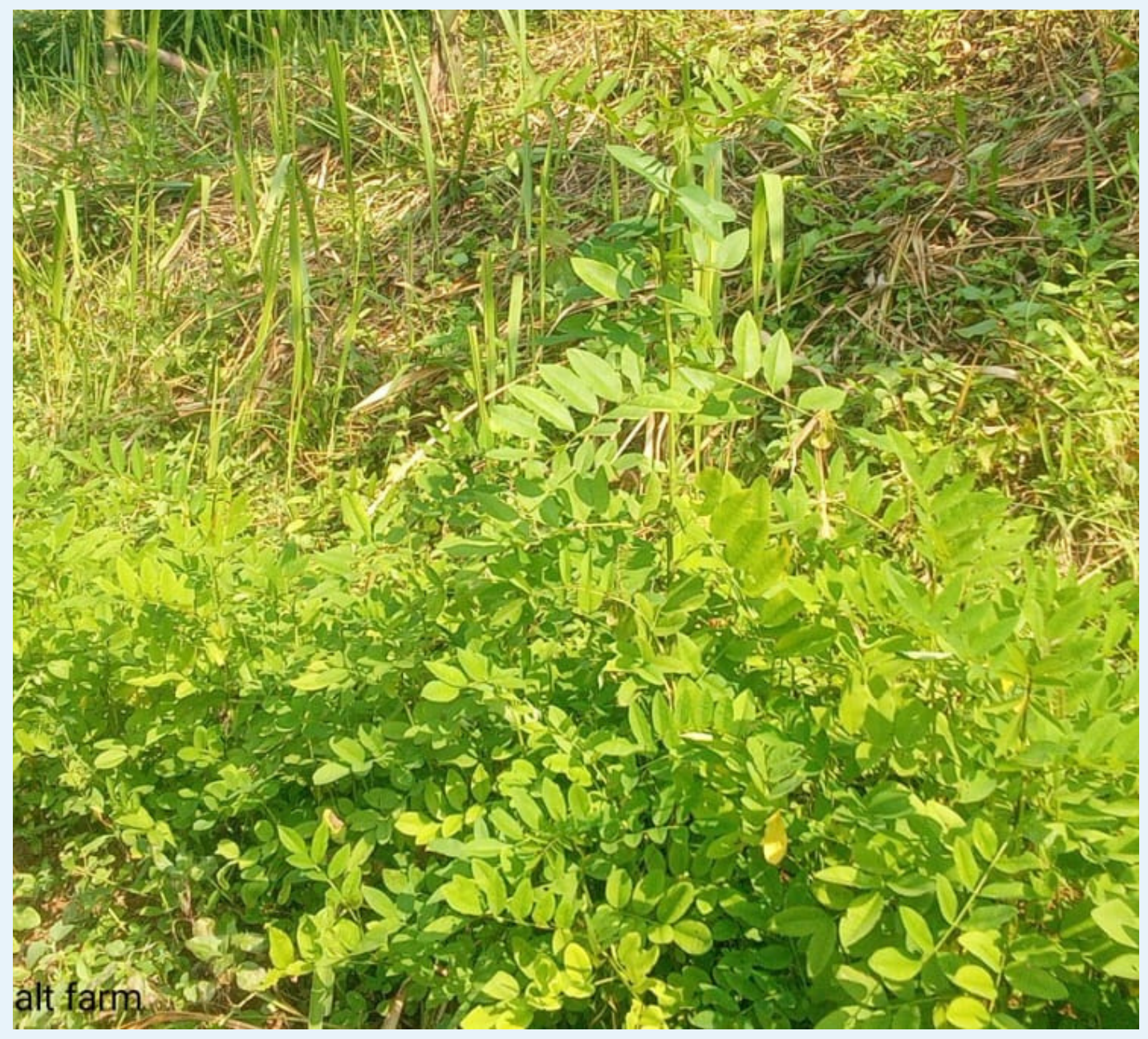
SALT farm of Helping Momin from Mejolgre Nokat village.