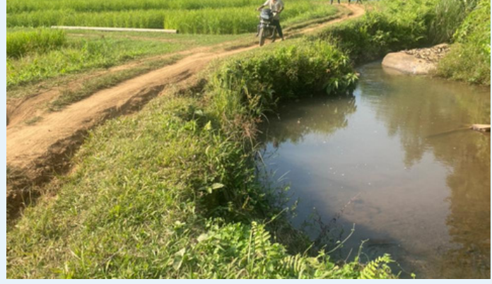
Chosen site for soil erosion control retaining wall