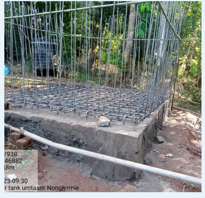
RCC water tank in Umtasor Nongjyrmie village.