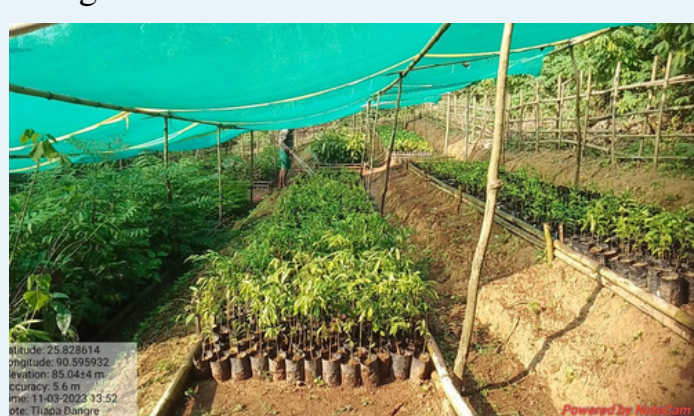
Thapa Dangre village.