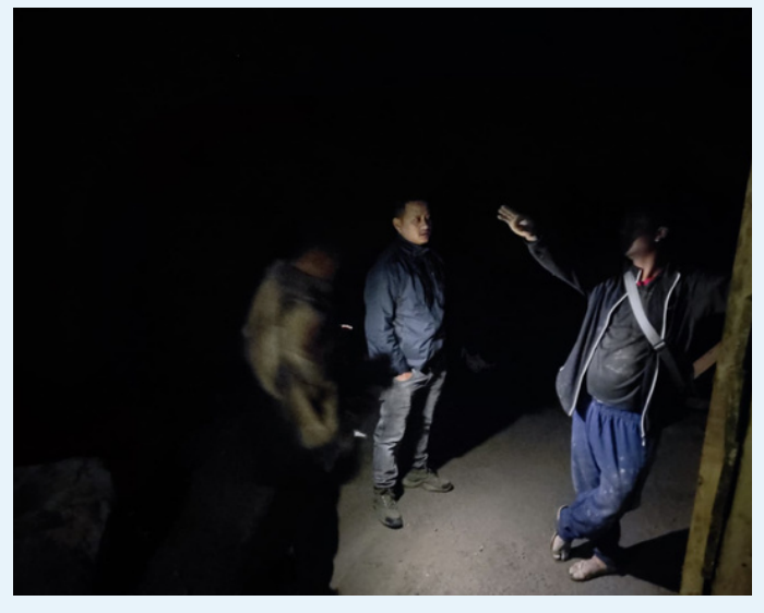
On November 4, 2023, an intervention site visit was conducted by DPM Shembhalang Khongjee at Mawlali VPIC.