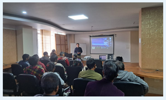
Blocks of Mawryngkneng, Sohiong, Khatarshnong-Laitkroh and Mawphlang