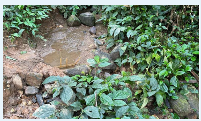
On November 1, 2023, Tueshva Ch Marak assessed potential check dam sites in Asil Chiringgre village for irrigation purposes and in Dangkong Doragre Village for domestic use. The streams in both areas have a consistent flow, but the water discharge is limited.