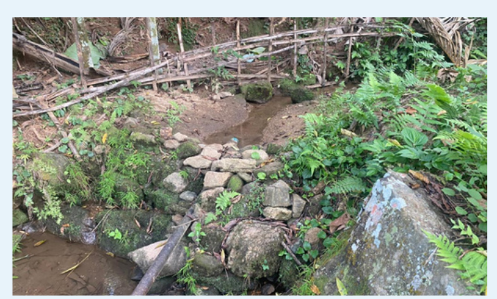
Chosen site for RCC check dam that will benefit 6 households.

Tengbath Marak visited Kolkatola village on November 7, 2023 to check out the spring tapped chamber and Jongchetpara nokat to evaluate the viability of the spring tapped chamber.