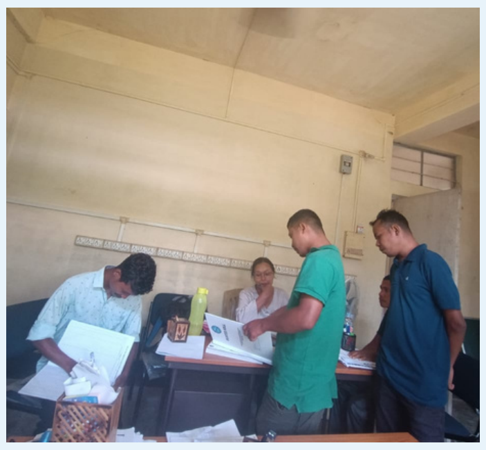
Checking of registers, cashbook, vouchers for Nepalgre VPIC under Betasing Block, South West Garo Hills, Ampati.