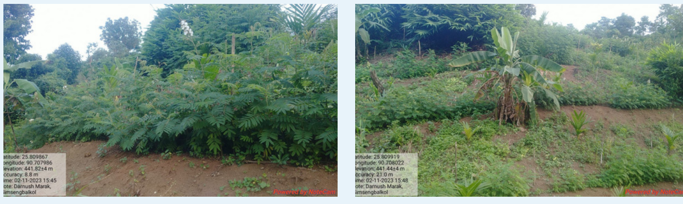
SALT Farming at Simseng Balkol village.