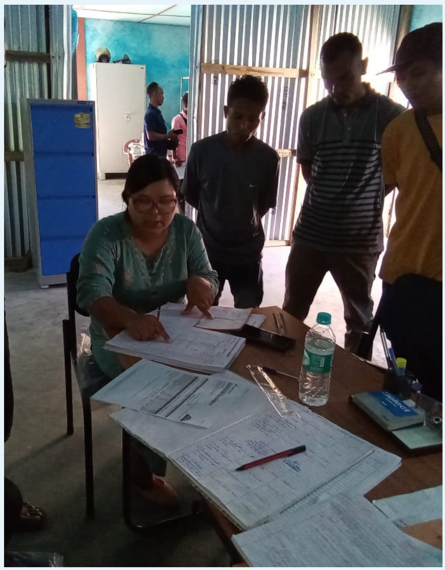
Cheking of register by F&A for 4 VPICs under Rongjeng Block.