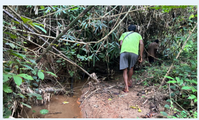
Asil Chiringgre village.