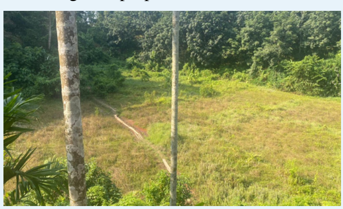
Chosen site for Conservation pond