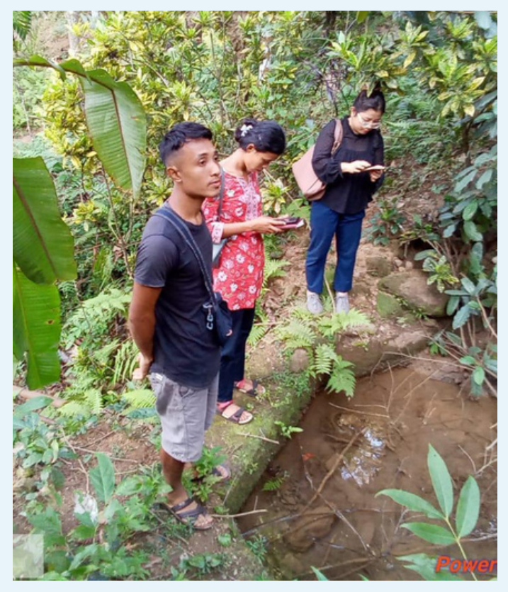
The chosen site for feasible to construct spring tap chamber that will benefit 5 households area.