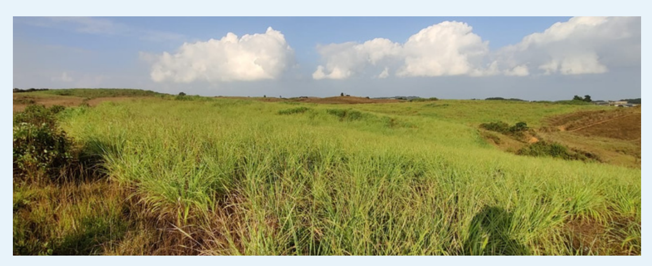
Study of Biomass through UAV application in East Jaintia hills.

In November 2023, the Bio Resource team carried out numerous field visits to facilitate the distribution of 5000 Tagetes minuta plants provided by CSIR-CIMAP Lucknow. These plants were distributed among various Self-Help Groups (SHGs), which included Step by Step SHG, Larem SHG Nongpyndeng (Meghalaya Public Co-operative Society), and the Rikhen Aromatic Crops Producer Group located under South West Khasi Hills and Eastern West Khasi Hills district.