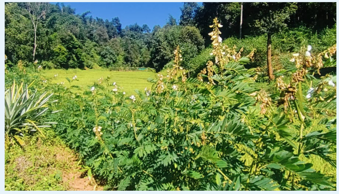
SALT Farm at Maweitnar village.