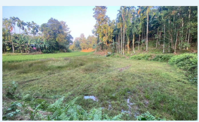
Chosen site for Dugout pond for irrigation use.