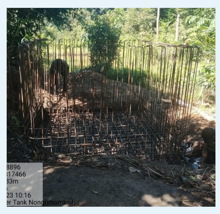
RCC water tank in Nongrim Umksih village,