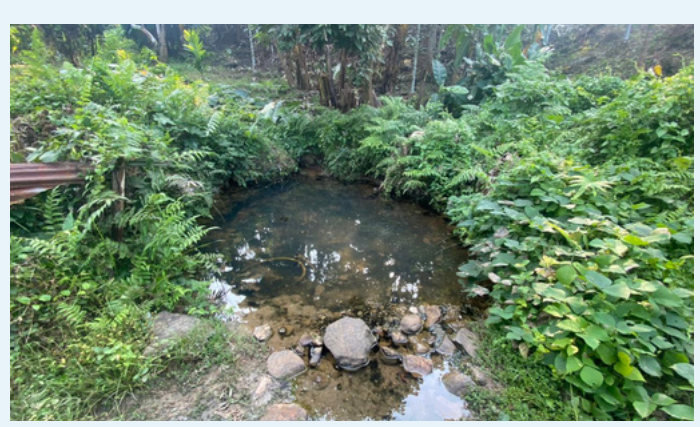
Chosen site for spring tap chamber.