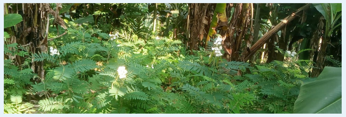
SALT farming of Pendas Momin.