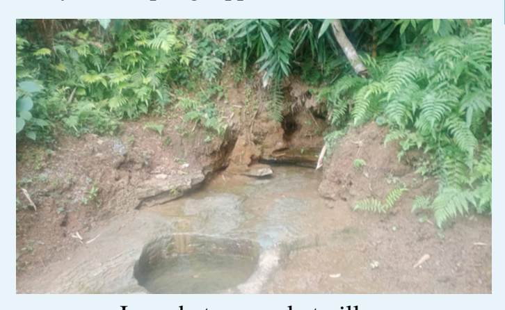
Jongchetpara nokat village

feasibility to construct Rcc\ check\ dam .