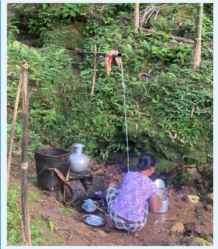
The selected site for the RCC storage tank that will benefit 7 households.