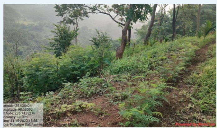
SALT farm of Shri Hebithson Sangma from Nokatgre village.