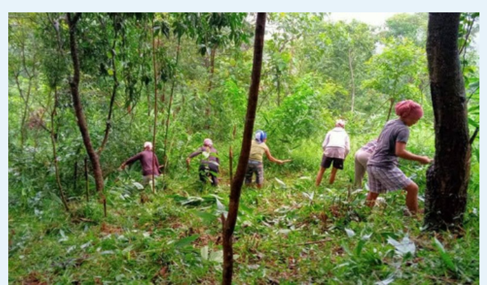
Second weeding cleaning in Anogre Rongram village.