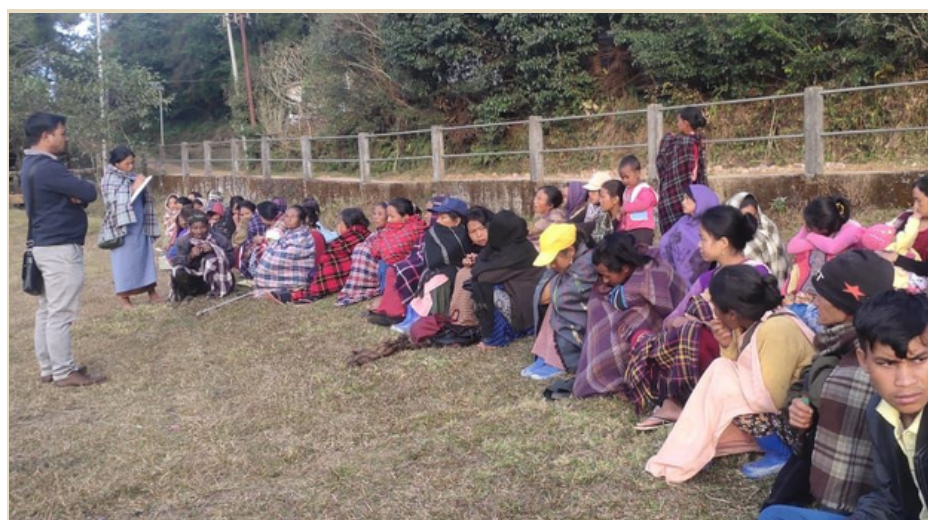
On December 4, 2023, a meeting was convened with members of the Integrated Village Cooperative Society (IVCS) at Umdiengpoh, East Khasi Hills . The discussions centered around crucial topics such as savings, loans, and the enrollment of new members.