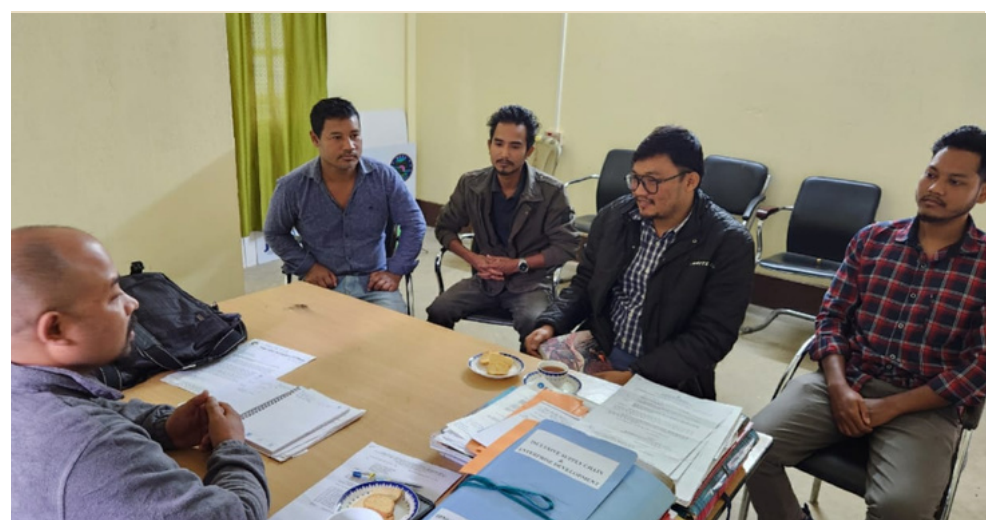
On December 7, 2023, a consultative meeting took place at the office of the District Project Management Unit in Resubelpara, North Garo Hills . The meeting involved discussions with the district team, Megha LAMP, and SeSTA NGO team on various issues related to Producer Groups, IVCS formation, and other pertinent matters.