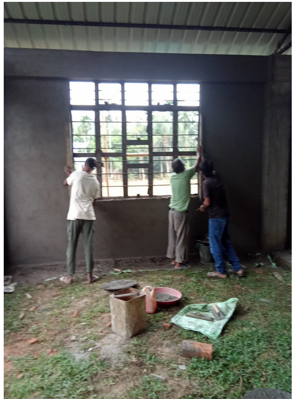
Ongoing construction of community halls in Various Districts.