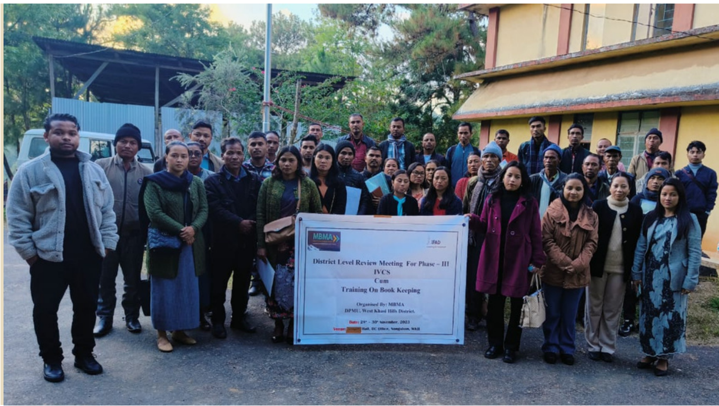
A District Review Meeting cum Training on Bookkeeping for Phase-3 IVCS was successfully conducted at the LBI Training Centre in West Khasi Hills District from November 28 to November 30, 2023. The event aimed to enhance bookkeeping skills and provide a comprehensive review of the ongoing initiatives within the district.