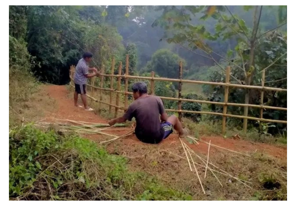
Updates from Bawagre Plantation! • Currently underway: the third round of weeding, creating a fireline, and fixing the fence. Our dedicated team is actively removing unwanted vegetation, establishing a protective fire barrier, and attending to necessary fence repairs. These efforts are vital for maintaining and enhancing the plantation, fostering a secure and eco-friendly environment for sustainable agriculture.