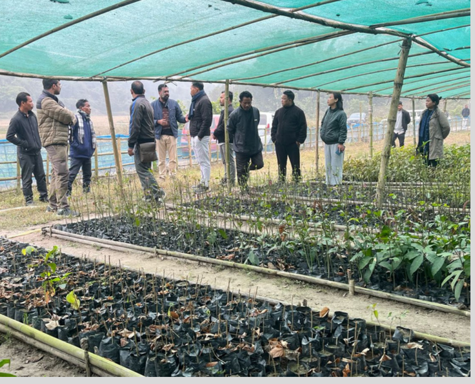
Shri Gunanka DB, IFS, APD MegLIFE carried out site inspection & review meeting at West Garo Hills. On the first day, APD visited various plantations, community nurseries, and SWCs interventions and engaged in community interaction in villages under Betasing and Zizak Block. On the second day, comprehensive review meeting was held for all DPMs, BPMs, FEs, FAs, PAs, & other vertical heads involved in the project. Meeting focused on assessing status of activities, discussing statistics, planning upcoming activities & strategies to achieve targets