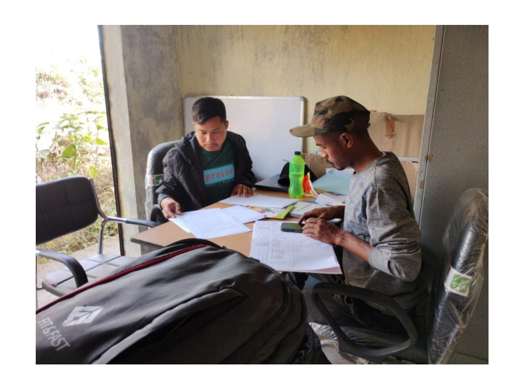
(Bokashi) was conducted for Producer Groups (PGs) at East members purchased shares and enrolled as new members of Rangblang Sohsynniang Area IVCS LTD, West Khasi Hills.

On February 1, 2024, a follow-up was carried out at Mawpud IVCS, South West Khasi Hills. Activities conducted, included collecting the IVCS monthly report, gathering Utilization Certificates (UC) for the corpus fund, and addressing other related activities.