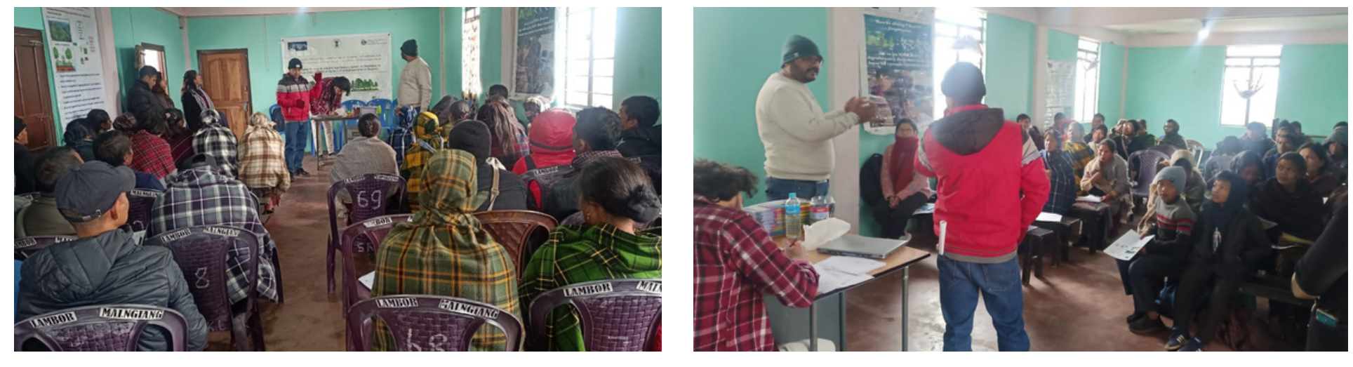
On January 30, 2024, the Accountant and their team in Rongara, South Garo Hills, were completely dedicated to the task of revising VPIC cashbooks and verifying vouchers.

"Focused Dedication: Accountant and Team in Rongara, South Garo Hills, on January 30, 2024"