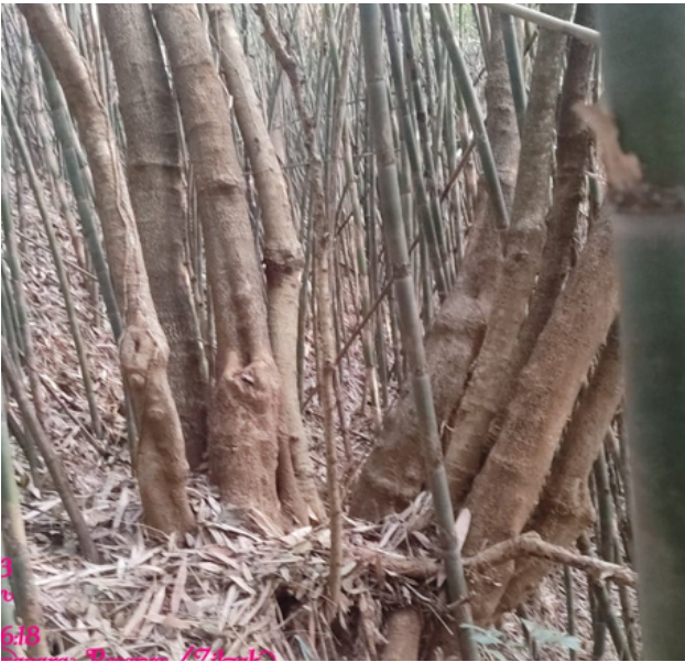
Forest fire protection and control measures have been implemented in the Dangsapara Community Forest, particularly in the Zikzak Block area.