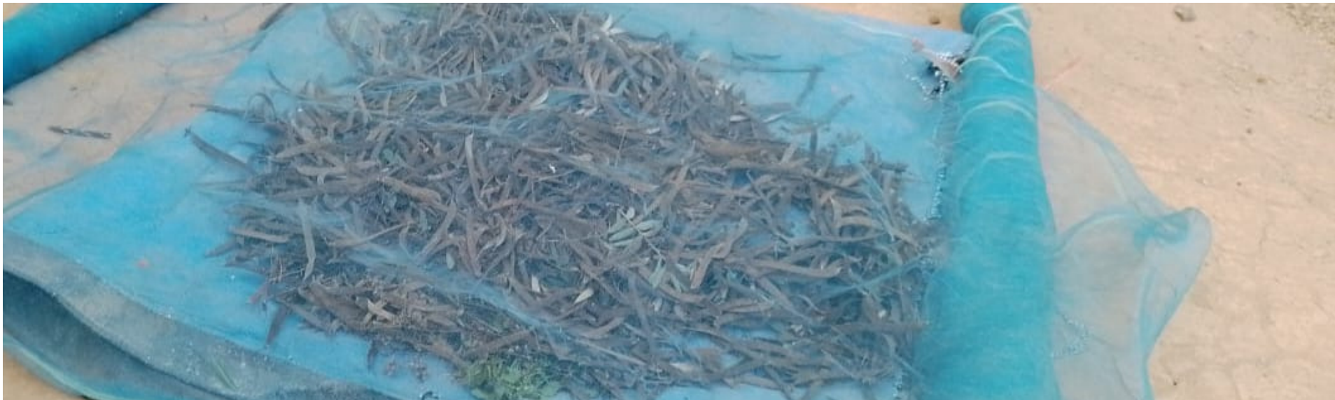
Fresh Tephrosia plant seeds have been gathered from Nepalgre village, located in the Betasing Block of South West Garo Hills.