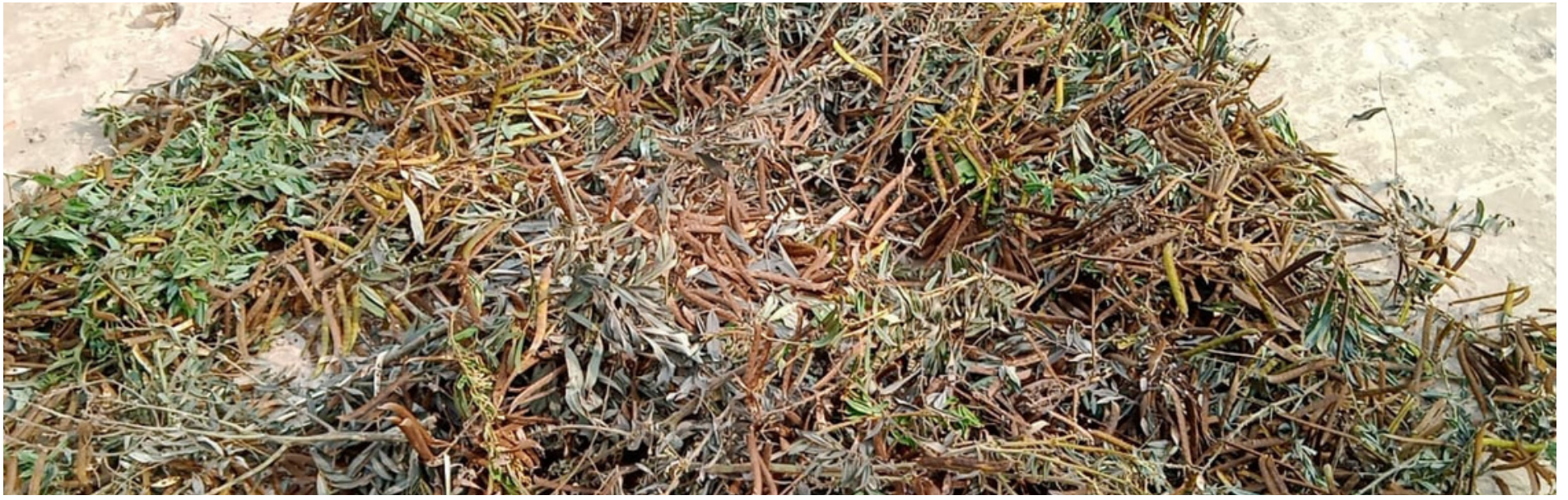
Nayapara seeds collection