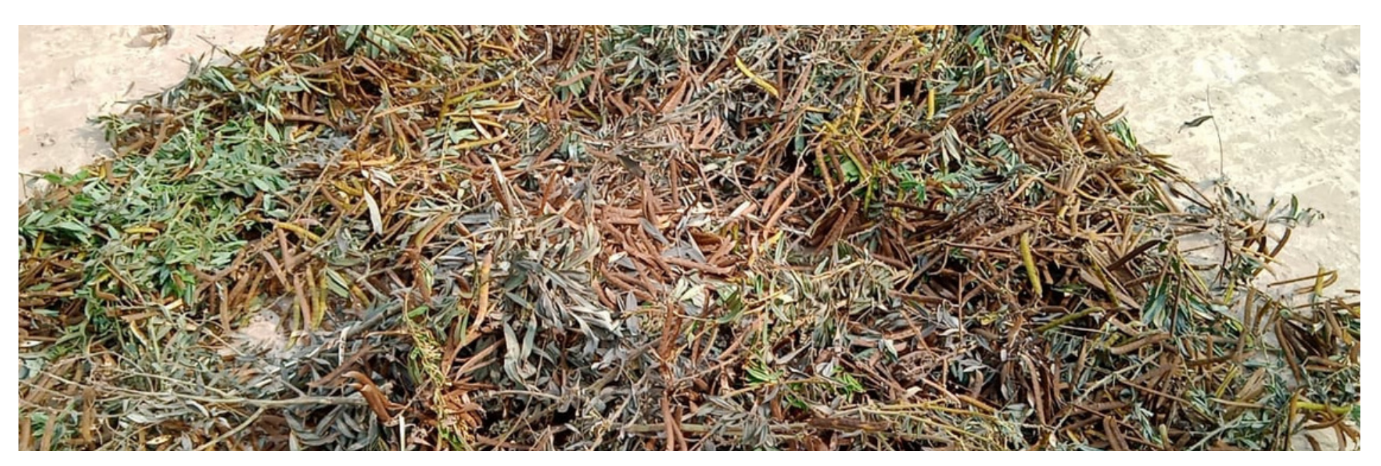
Nayapara seeds collection