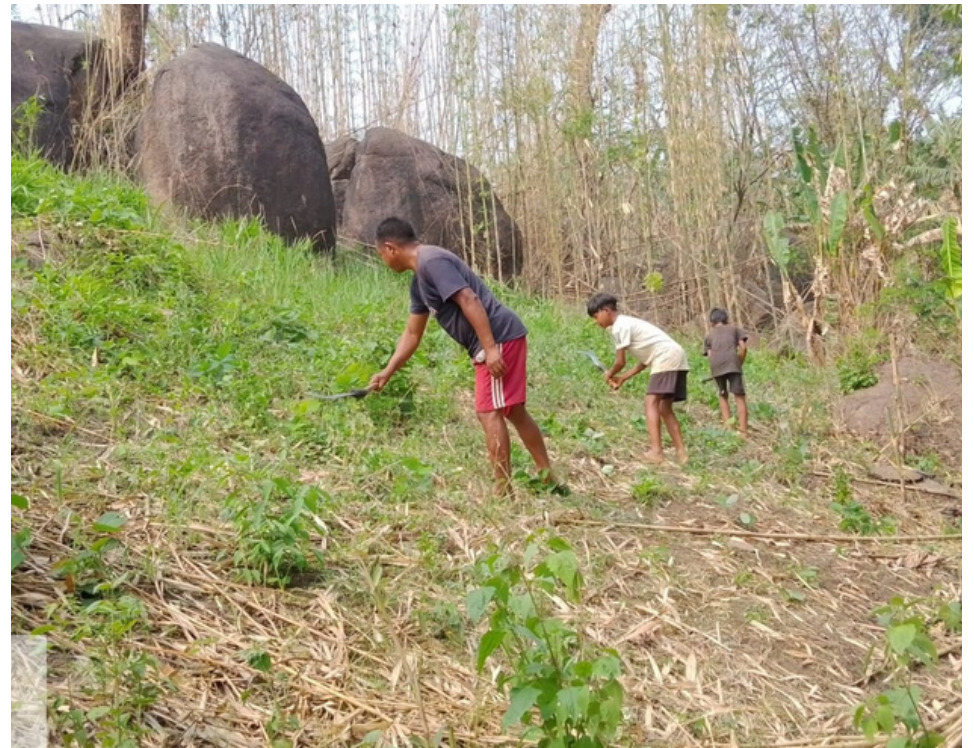
Efforts to clear the jungle in several villages and Blocks have initiated progress.