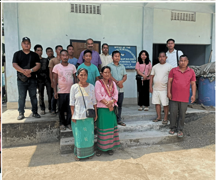
A visit to Jangrapara IVCS Ltd., (CMC) for black pepper cultivation as part of MBMA and BRDC's initiative under SLM to strengthen traditional practices for codifying to Meghalaya Organics.