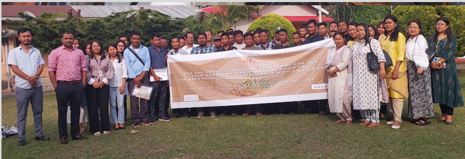
The Department of Horticulture, in collaboration with MBMA, organized a capacity building programme at the training hall of Rongram Horti Hub for Farm Managers and representatives of Cooperative Societies from Garo Hills as part of the Ginger Mission. Thirty-three Cooperative Societies representatives and eight Farm Managers participated in the programme.