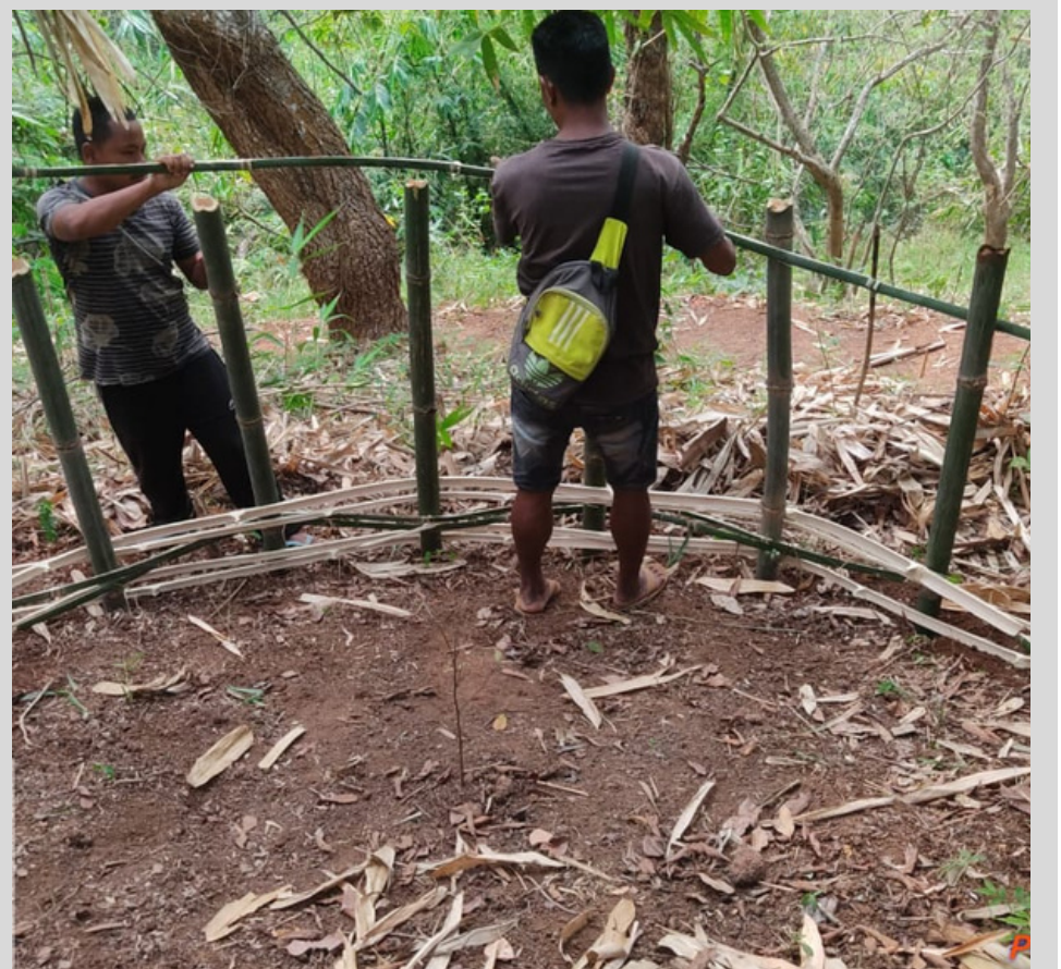
The FE, GIS, and Project Associate began and exhibited halfmoon terracing at the Mejlgre Nokat plantation site.