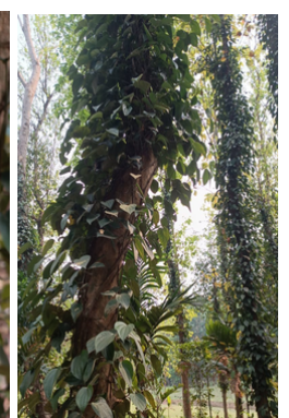
Documentation of Traditional Agri Practices at Jangrapara and Napakgre in West Garo Hills by BRDC.