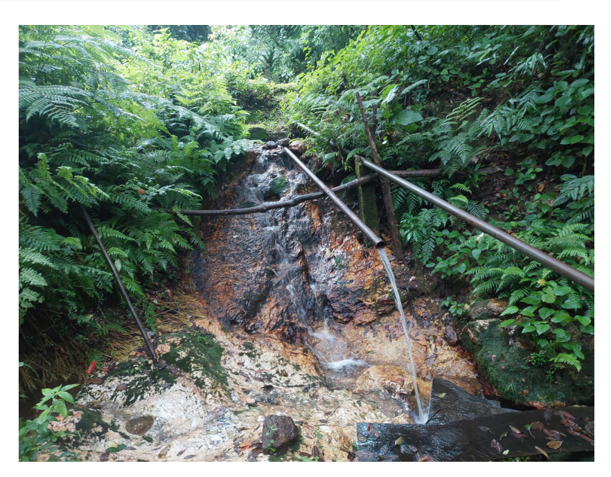
On September 11th, 2024, a spring in Balupara Village, used by 86 households for daily needs, was monitored by the Field Engineer of Ronram Block.