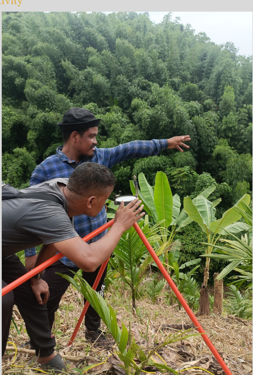
A field activity for the Forest Management Plan (FMP) was carried out in Anogre Village.