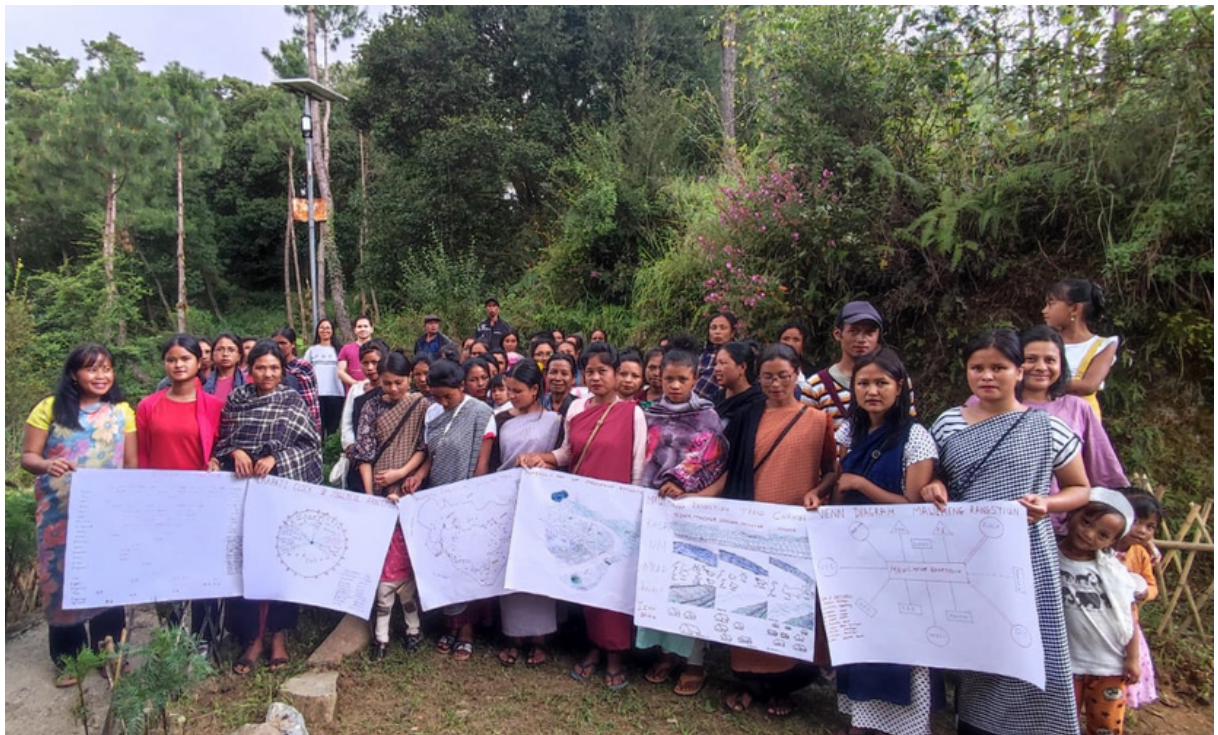
The Umiew CMU successfully conducted a Participatory Rural Appraisal (PRA) exercise at Rangsyuin Village under Mylliem Block on September 10, 2024. The exercise engaged community members in discussions aimed at identifying local challenges and opportunities, contributing valuable insights for future development initiatives in the area.