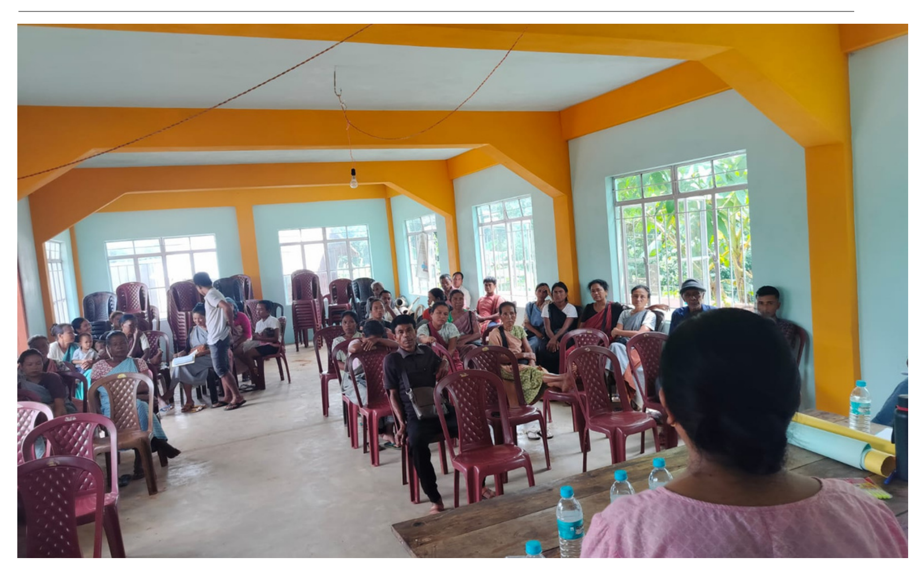
The first day of the PLUP and Microplan exercise for Batch II at Myrdon Mawtari Village, VPIC, took place on September 12th, 2024.