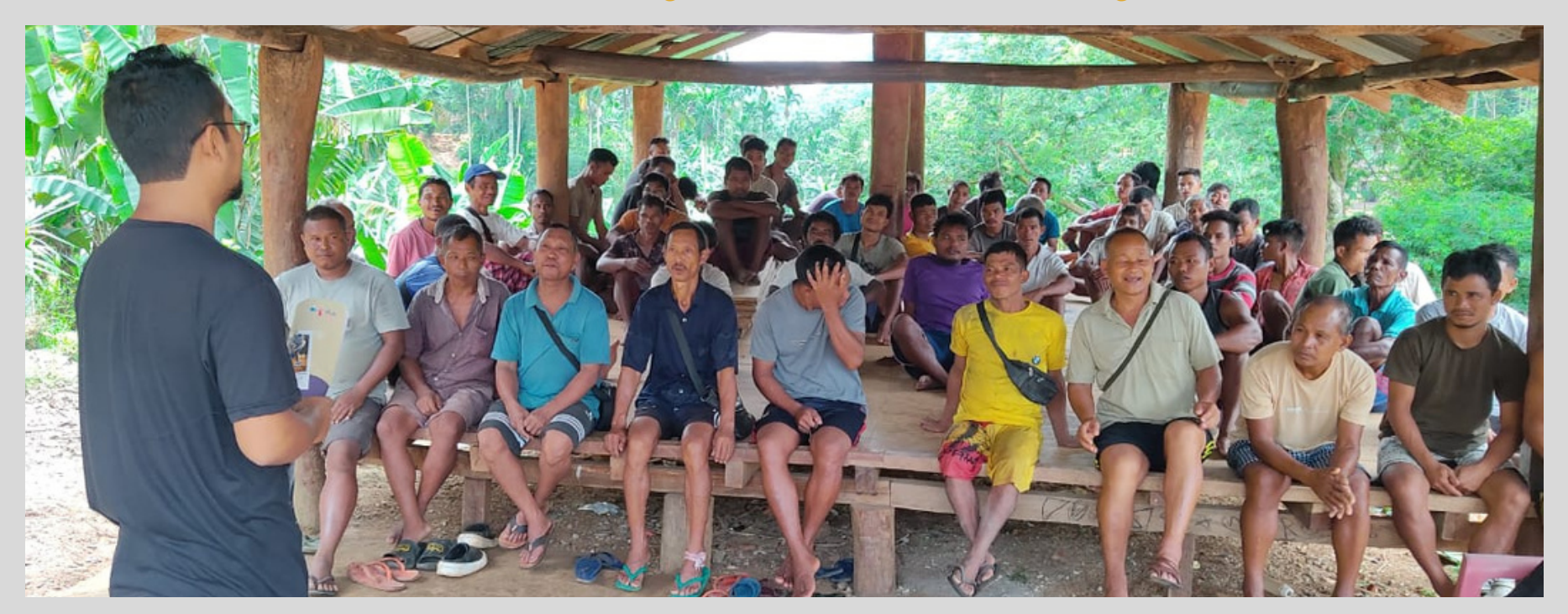
Chachat Abri IVCS IGM.